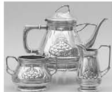
Austrian 800 silver Arts and Crafts three piece tea set, teapot 7-1/2" h, total approx weight 41.3 troy oz.