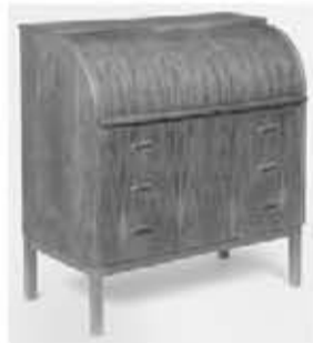
Danish modern rosewood cylinder desk. 37-3/4" h, 34-3/4" w, 18-3/4" d.