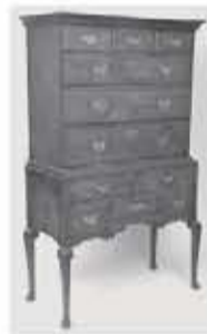
18th century New York cherry highboy, 68-3/4" h, 44" w, 21" d.