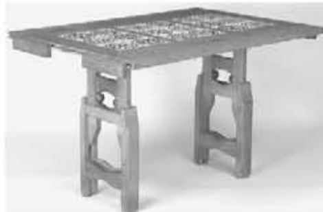
Guillemo und Chambron tile decorated adjustable oak dining/occasional table, 29-1/2" h, 50-1/2" w, 35-1/2" d (as pictured).