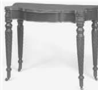
Early 19th century carved mahogany card table, attr. to Samuel McIntyre , 29-1/2" h, 36" w, 17-1/2" d.