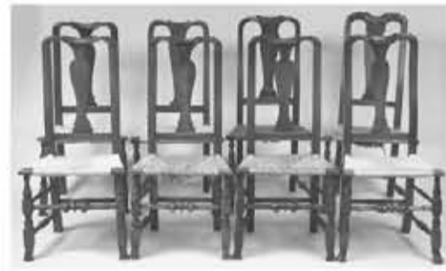
Assembled set of (8) American country Queen Anne side chairs, approx 41-1/4" h.