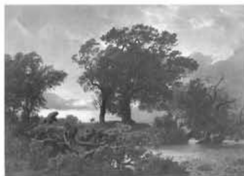
JOHANN WILHELM SCHIRMER (German, 1807-1863), oil on canvas, 30-3/4" h, 42-1/4" w.