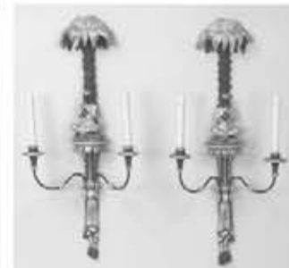
Pair of large Blackamoor gilt figural two light sconces, 31-1/2" h, 15" w.