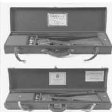
Parker DHE 12g. on 1-1/2 frame, A. Francotte Grade 14E in 28g.