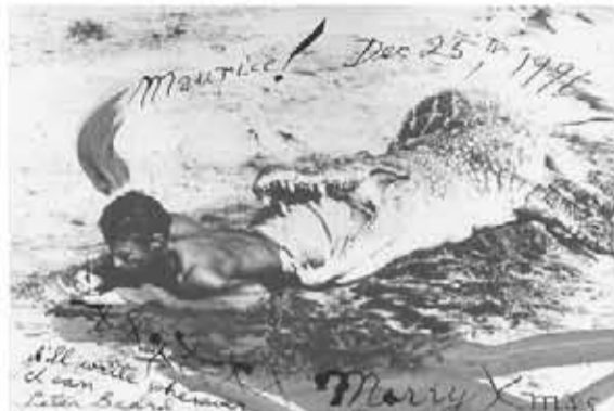
PETER BEARD (American, b.1938), photograph with red and black ink, 13" h, 18" w.