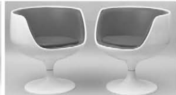
Pair of Eero Aarno Cognac XO chairs with red upholstery, 27" h, 27" dia.