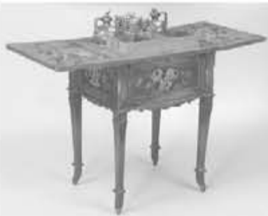
Continental tanatulus table with painted floral decoration. 31-1/2" h, 23-1/2" w (closed), 19-1/2" d.