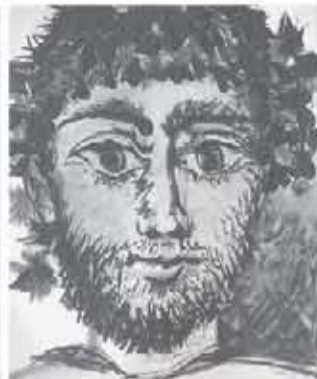
PABLO PICASSO (Spanish, 1881-1973), color etching, 11-3/4" h, 9-3/4" w.