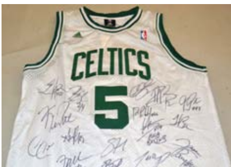
2008 Champion Celtics Kevin Garnett Team Signed Jersey