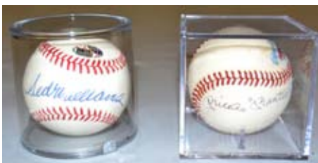
Ted Williams & Mickey Mantle