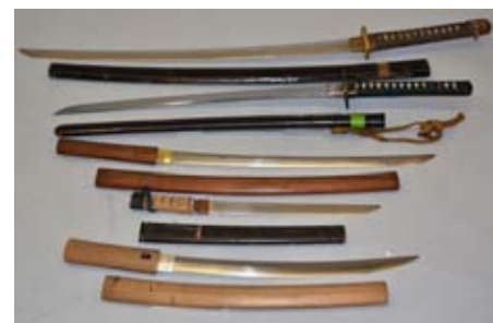
Selection Early Japanese Swords