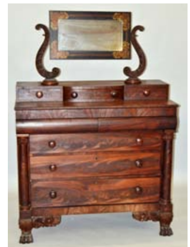
N.E. Classical Empire Chest