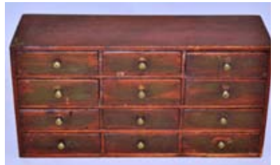
1 of Several Multi-Drawer Cabinets