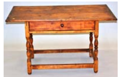
1 Drawer Tavern Table