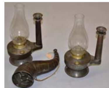
Selection of Early Tin Lighting