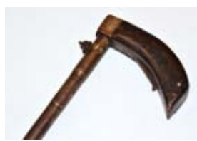
19th Cent. Gun Cane