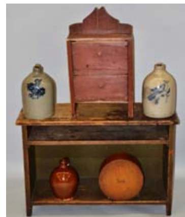
Selection of N.E. Accessories - Whatley & Taft