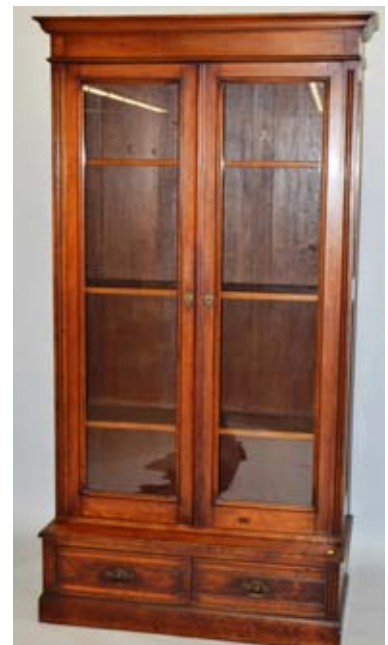
Vict. Walnut Bookcase