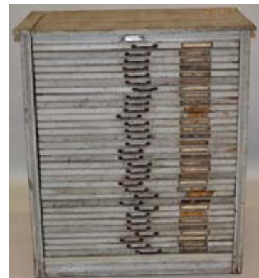
Multi-Drawer Type Set Cabinet