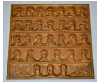
1929 Bronze President Plaque