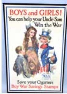
James Montgomery Flagg