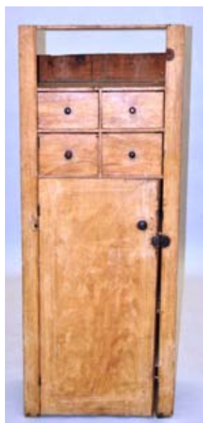
Unusual N.E. Grain Painted Cupboard