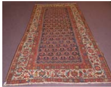
Selection Antique Oriental carpets