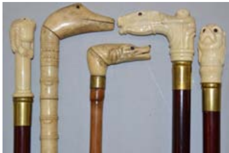
Selection Carved Ivory Canes