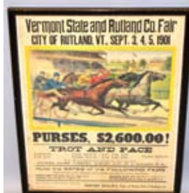
1901 VT State & Rutland Co. Fair Broadside