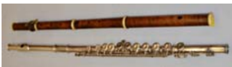
Early Flutes - (1) H. Bettoney Boston (Sterling)