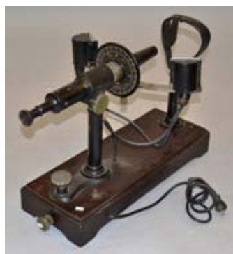
E.B. Meyrowitz NY - Paris