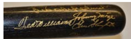
Hall of Fame Ted Williams & Other Black Bat