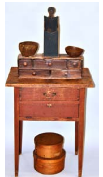
Selection of Early Country Accessories