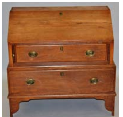
Q.A. Pine Desk on Frame