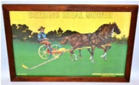
Deering Ideal Mower Adv. Sign