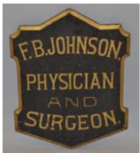
VT Painted Trade Sign