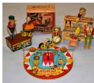
Tin Litho Toys