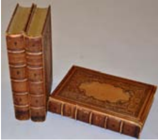
Audubon Quadrupeds of N. Amer. 1st Octavo Edition