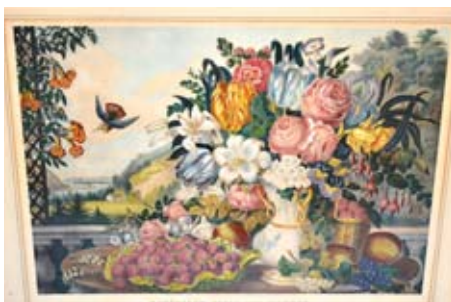
Lg Folio C&I Landscape Fruit & Flowers