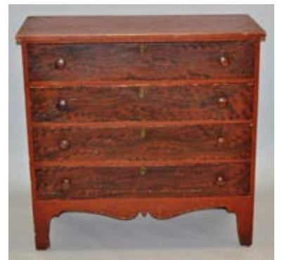
Paint Decorated 4 Drawer Chest