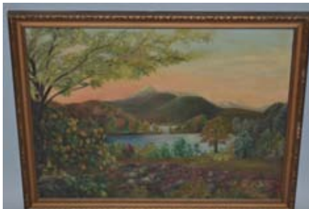
Mt Chochura Signed Ethel Macy