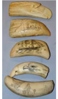
Selection Scrimshaw Whale Teeth