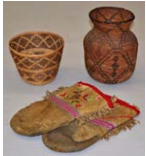
Native American & Inuit