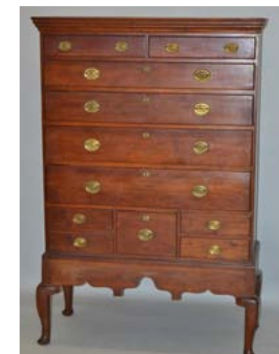
N.E. Q.A. Chest on Frame