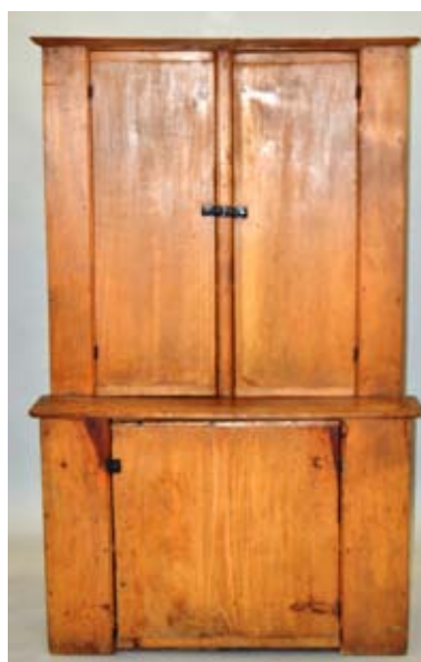
Pine Stepback Cupboard