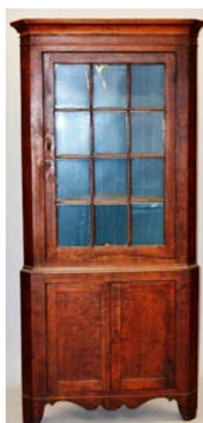
2 Pc Corner Cupboard