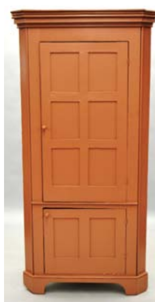
18th Century N.E. Corner Cupboard