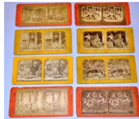
Selection of Stereoview Cards - incl. Diableries