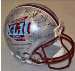
Champion N.E. Patriots Team Signed Helmet (XLII)