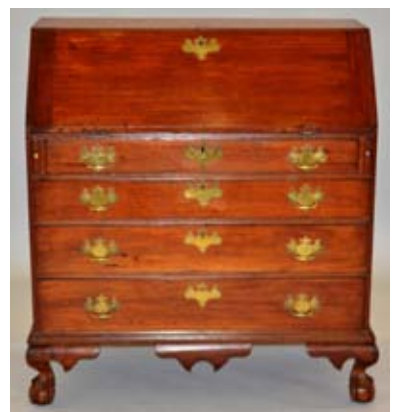
Chippendale Slant Front Desk