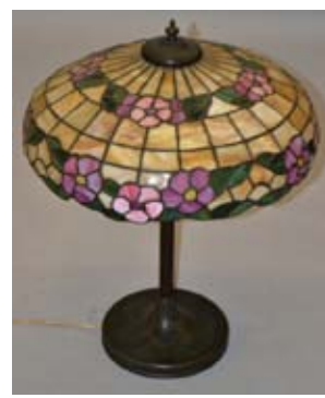
Attributed Handel Lamp