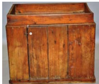
Pine Dry Sink