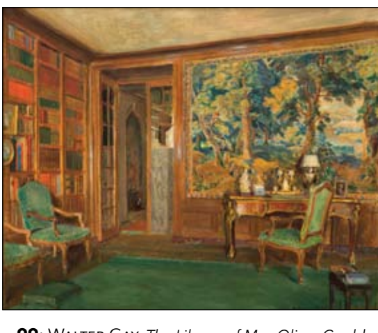
99 : WALTER GAY, The Library of Mrs. Oliver Gould Jennings , oil, 18<sup>1/2</sup> x 21<sup>1/2</sup> in., $20,000 - 40,000