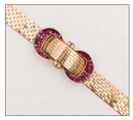
146 : VAN CLEEF & ARPELS Gold, Ruby, and Diamond Covered Wristwatch, $6,000 - 9,000