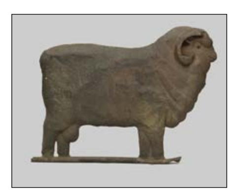
296 : American Weathervane, late 19<sup>th</sup> century, height: 26 in., $3,000 - 5,000