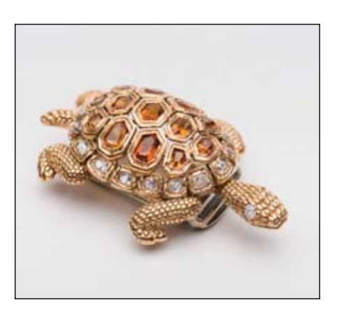
148 : Cartier Gold, Citrine, and Diamond Turtle Brooch, $3,000 - 5,000