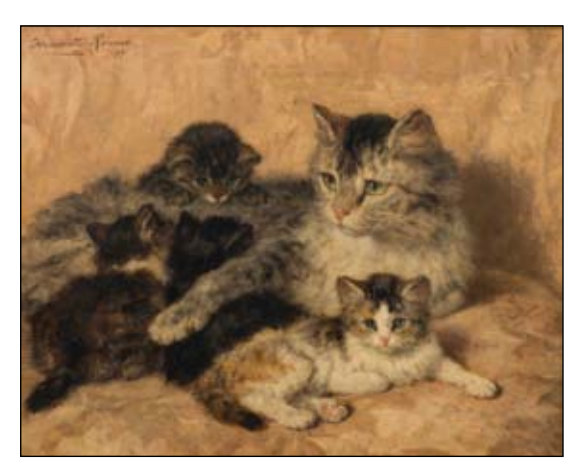
7 : Henriette Ronner-Knip, The Happy Family , oil, 15 x 20 in., $20,000 - 40,000