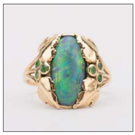
144 : Louis Comfort Tiffany Black Opal and Demantoid Garnet Ring, $2,000 - 3,000