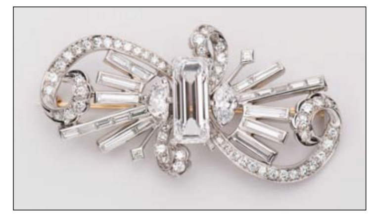
152 : Emerald Cut Diamond, 4.37 CTS., D, IF, $40,000 - 60,000 151 : Platinum and Diamond Brooch, $2,000 - 4,000 (center diamond: lot 152)