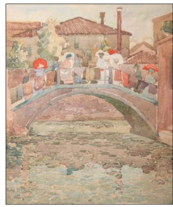
46 : MAURICE PRENDERGAST, Ponte Mendicanti , watercolor, 12<sup>1/8</sup> x 9<sup>15/16</sup> in., $20,000 - 30,000