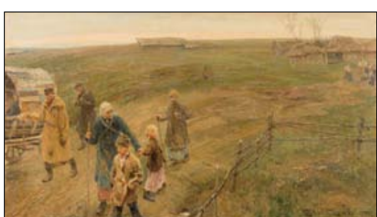
110 : VASILY NIKOLAEVICH BAKSHEEV, The Departure, oil, 14 x 25 in., $4,000 - 6,000