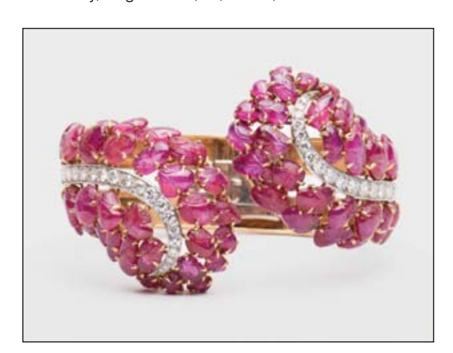
155 : BOUCHERON Gold, Carved Ruby, and Diamond Bangle Bracelet, $8,000 - 12,000