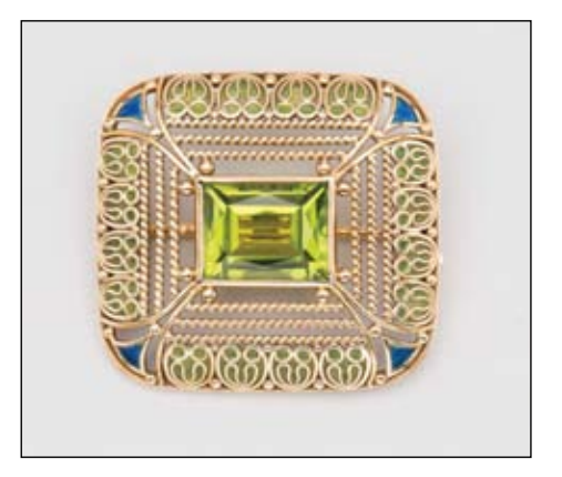
157 : LOUIS COMFORT TIFFANY Peridot and Plique-à-Jour Brooch, $3,000 - 5,000