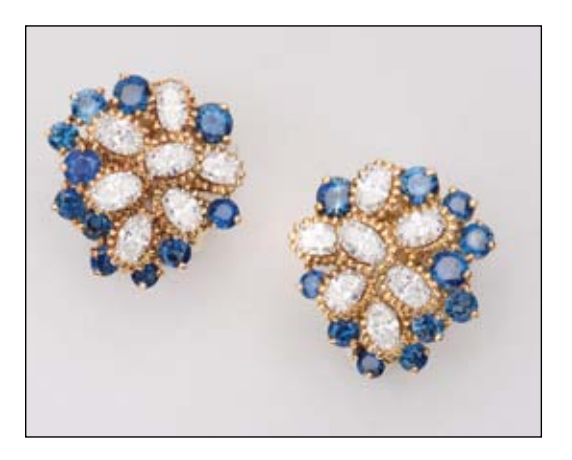
174 : OSCAR HEYMAN Gold, Platinum, Diamond, and Sapphire Earclips, $4,000 - 6,000