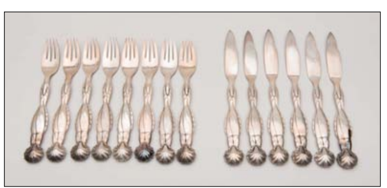
248 : GEORG JENSEN Pattern no. 55 Silver Fish Service, ca. 1914, $5,000 - 8,000