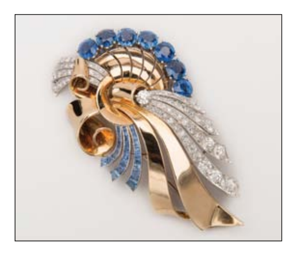
175 : RAYMOND YARD Gold, Platinum, Diamond, and Sapphire Brooch, $3,000 - 5,000