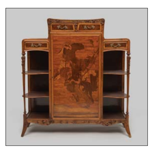
325 : Louis Majorelle French Walnut and Exotic Wood Inlaid Art Nouveau Etagere, ca. 1900, height: 52 in $4,000 - 6,000