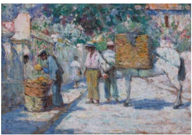
American School Oil on Board

SHIPPING ADDRESS 50 Market Street South Portland, Maine 04106