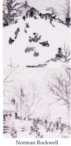
Winter and Spring, 2 of 4 studies for each season, all to be offered in this auction, originally drawn for a 1958 calendar