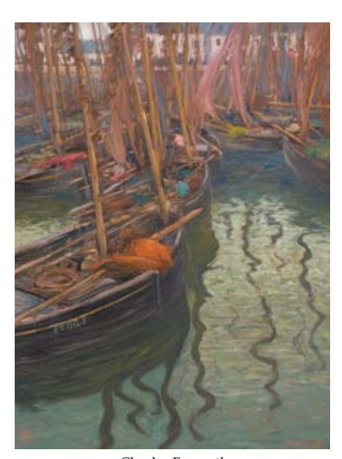
Charles Fromuth 1 of 13 consigned from the artist's estate