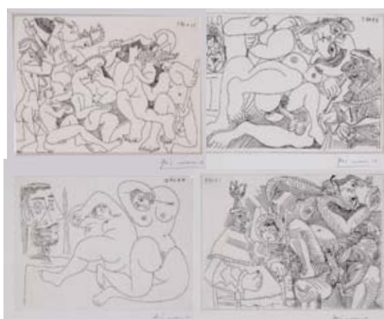
Pablo Picasso 4 Plates from Series 347, 1968, full margins