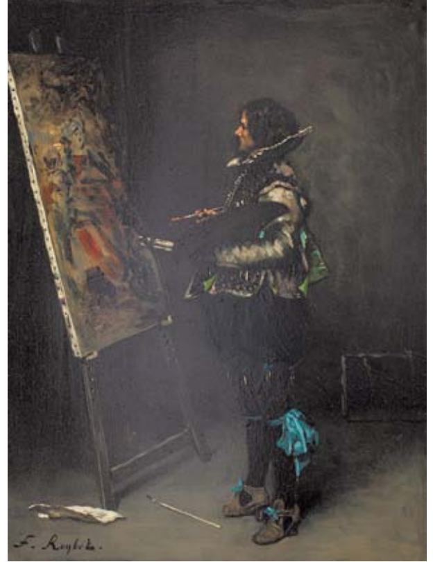
Ferdinand Victor Leon Roybet