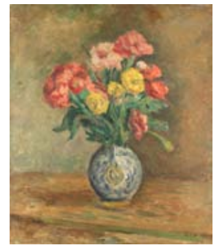
Lot 23 MAXIMILIEN LUCE FRENCH 1858-1941, Vase de Fleurs oil on canvas