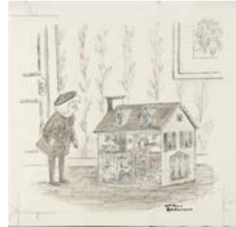
Lot 189 CHARLES ADDAMS AMERICAN 1912-1988 Ransacked (New Yorker Magazine March 11th, 1972), ink and wash on paper