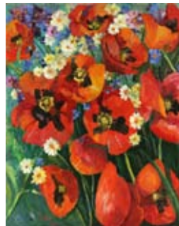
Lot 159 MARTIRO S. SARIAN ARMENIAN 1880-1972, Poppies and Camomiles, oil on canvas