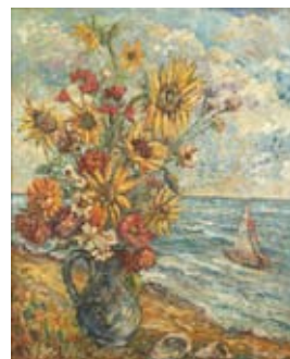
Lot 72 DAVID D. BURLIUK RUSSIAN/AMERICAN 1882-1967 Flowers by the Seashore, oil on canvas