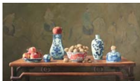
Lot 4 YIN YONG CHUN CHINESE/AMERICAN B.1958 Walnuts and Apples, oil on canvas