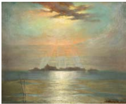
Lot 196 EDWARD MORAN AMERICAN 1829-1901 A View of the Hudson River and Bedloe's Island (1897) oil on canvas