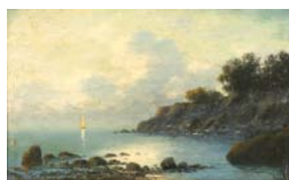
Lot 48 LEV FELIKSOVICH LAGORIO RUSSIAN 1827-1905 Coastal Scene, oil on board