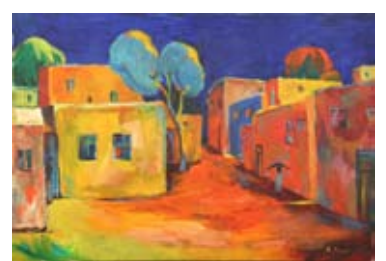
Lot 161 MINAS AVETISIAN ARMENIAN 1928-1975 Sultry Day (Aug, 1960), oil on canvas