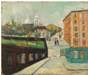
Lot 33 MAURICE UTRILLO (ATTR.) FRENCH 1883-1955 Untitled, oil on board