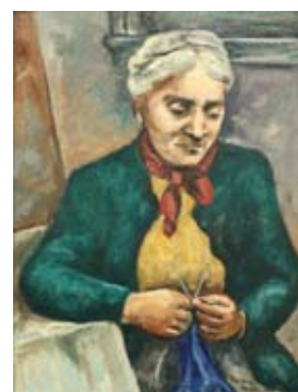
Lot 125 RAPHAEL SOYER RUSSIAN/AMERICAN 1899 - 1987 oman Knitting, 1940, Oil on canvas Artboard