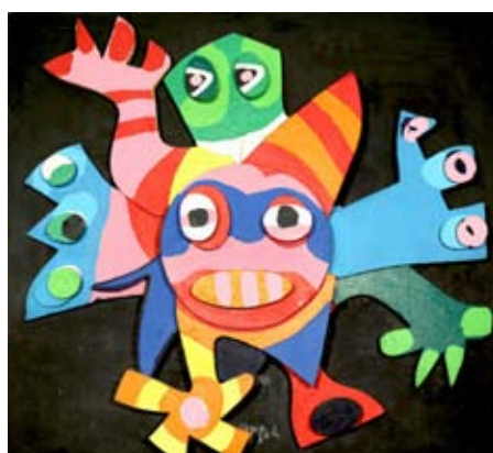
Lot 147 KAREL APPEL DUTCH 1921-2006 Wizard; Circus Series (Circa 1978), wood sculpture