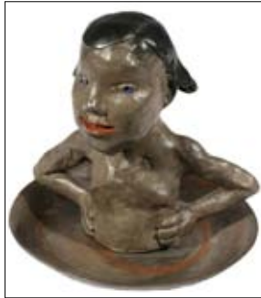
Lot 178 LENA CRONQVIST SWISS B.1938 A Young Girl, bronze