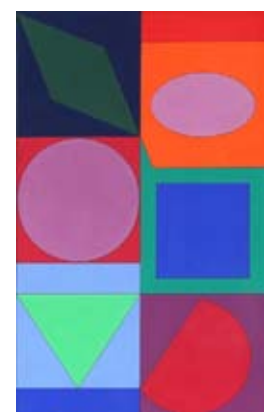
Lot 150 VICTOR VASARELY FRENCH/HUNGARIAN 1906-1997 Marsan-X (1964), acrylic on panel