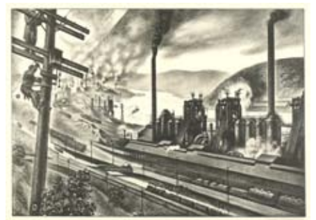
Lot 114 LOUIS LOZOWICK UKRAINIAN/AMERICAN 1892 - 1973 Steel Valley, 1936, lithograph