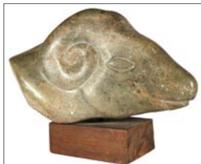
Lot 165 JOHN BERNARD FLANNAGAN AMERICAN 1895-1942, Ram's Head, stone sculpture