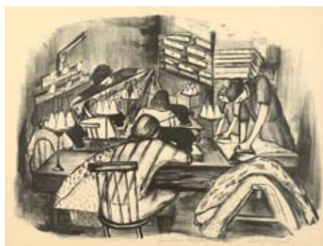
Lot 102 RIVA HELFOND AMERICAN B.1910 Curtain Factory, c. 1938, lithograph