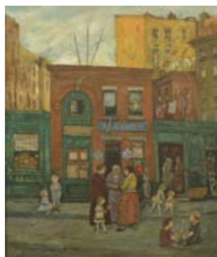
Lot 117 JEROME MYERS AMERICAN 1867 - 1940 Shops in Harlem, 1936, oil on canvas