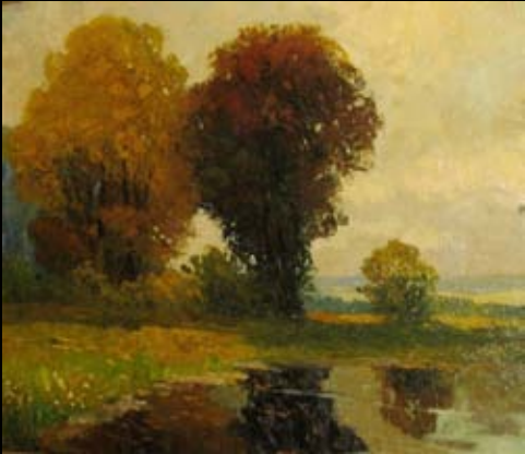
Impressionist Landscape, Early 20th C., signed A Lenz