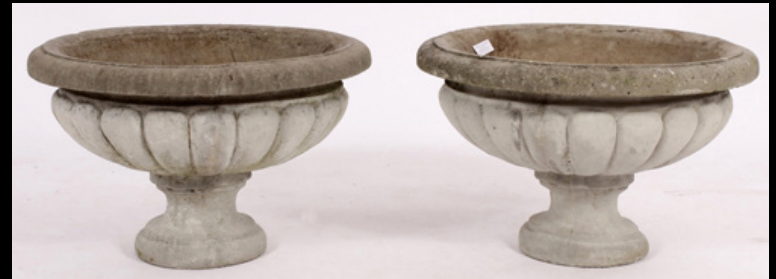
Pair of Classical Style Cement Garden Urns

Friday, October 7 – Tuesday, October 11, 10am-5pm each day