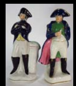
Two Staffordshire Pottery Figures, late 19th C., Napoleon and Wellington

Still Accepting Consignments for Thanksgiving Auctions: