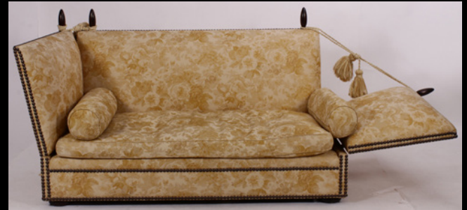
George Smith Upholstered Tiplady Knole Sofa, Bennisson fabric

Friday, October 7 – Tuesday, October 11, 10am-5pm each day