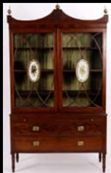
Federal Bookcase Cabinet, 19th C.