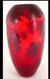
Legras Art Nouveau Cameo Glass Vase, French, Early 20th C.