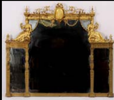
Large Gilt Neoclassical Mirror, 19th C.