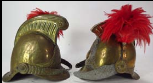
French Brass Fireman's Helmets, c. 1900