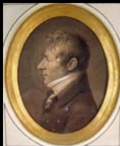
French School, Early 19th C., Profile Portrait of a Gentleman, pencil with charcoal