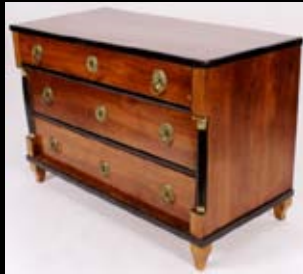
Biedermeier Commode, mid 19th C.