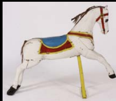
Folk Art Carousel Horse, American, Late 19th C.