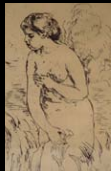
Pierre August Renoir, French, 1841-1919, Baigneuse Debout, A Mis-Jambes Woman Bathing