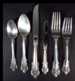
Wallace Sterling Silver Flatware Service for 8, Grand Baroque pattern