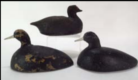
Antique Working Duck Decoys, 19th C.