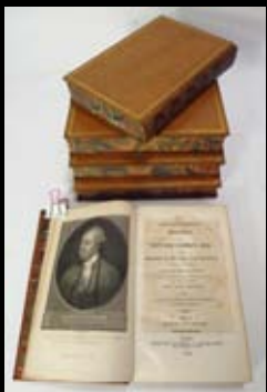
8 Volumes of Edward Gibbon's Decline and Fall of the Roman Empire, 1838