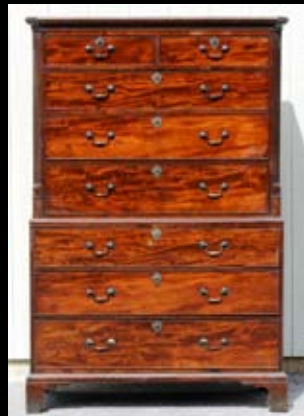
George III Flame Mahogany Chest on Chest, English, 19th C.