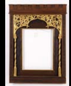
Tabernacle-Style Gilt and Stained Frame