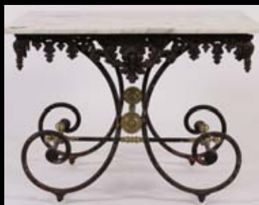
French 19th C. Marbletop Bakers Table