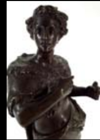
Bronze sculpture, probably of Herakles wear pelt of the Nemean Lion, 19th C.