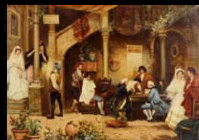
Spanish School, c.1900, Courtyard Scene