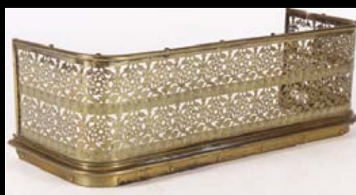
Victorian Pierced Brass Fireplace Fender, 19th C.