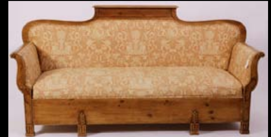
Rustic Biedermeier Pine Upholstered Sofa, 19th C., upholstered in Bennisson fabric