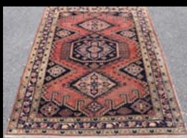
Set of 12 Sterling Dessert Plates, c. 1928, Royal Armorial with Coronet