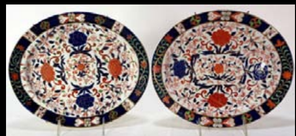
A pair of Royal Crown Derby Imari Platters, probably Bloor, c. 1830

Still Accepting Consignments for Thanksgiving Auctions: