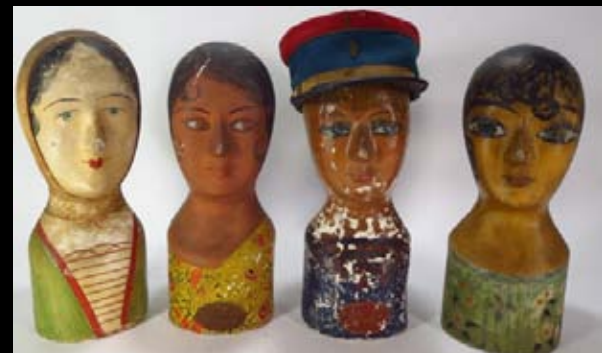
French Milliner's Papier Mache Hat Stands, 19th C.