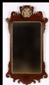
Federal Mirror, with Gilt Plumes in Crest, C.1800