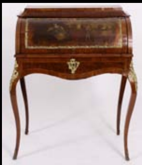
Louis XV Style Parquetry Inlaid Wood, Vernis Martin Cylinder Bureau