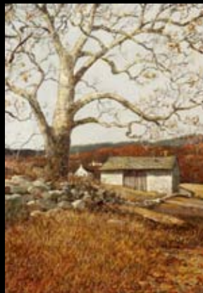
Eric Sloane, American, 1905-1985, Sycamore