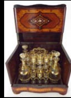
French Tantalus, specimen veneered parquetry with mother of pearl inlay, c. 1870