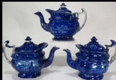
Staffordshire Transferware Teapots English, C. 1800