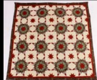
Eight-Point 16 Star Quilt, Late 19th- Early 20th C.