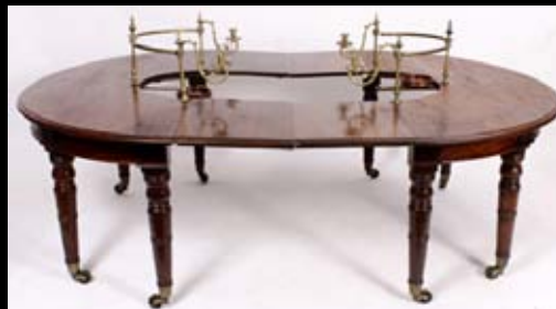
Regency Mahogany and Brass Huntboard Table, 19th C.