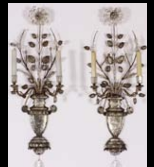
Pair of Bagues-Style Silvered Metal and Glass Wall Sconces