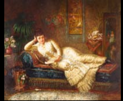
French School, 19th C., Lady Reading Letter