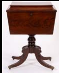
Regency Mahogany Wine Cellarette, 19th C.