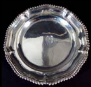
Set of 12 Sterling Dessert Plates, c. 1928, Royal Armorial with Coronet