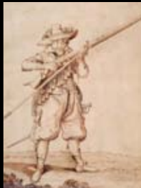
Dutch School Man w Musket Sepia Ink Drawing 17th C. enhanced with black ink