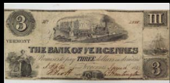
1847 $3 Bank of Vergennes Note - Vermont, by W Dane & Co.