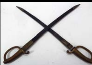
A Pair of Spanish Military Swords with Leather and Brass Scabbards