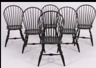
Set of 6 Windsor Style Chairs Painted Green