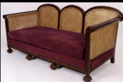
Plantation-Style Caned & Cushioned Daybed