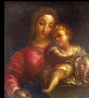
Old Master Painting, Continental, Madonna and Child