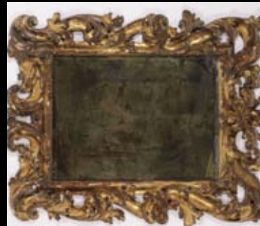
Large Italian Handcarved Giltwood Frame Mirror, 17th-18th C.