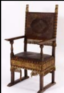
J. B. Sciver Co., 17th C. Style Arm Chair C. 1900