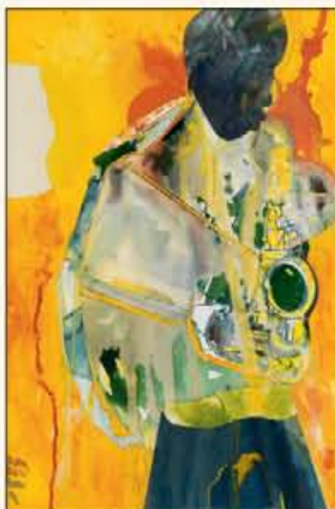
Romare Bearden, All the Things You Are , collage, color dye and watercolor on board, 1987. Estimate $120,000 to $180,000.