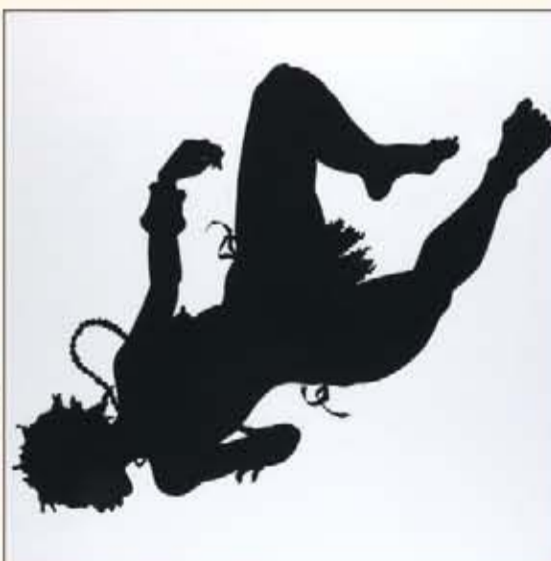
Kara Walker, African-American , linoleum cut, 1998. Estimate $15,000 to $25,000.