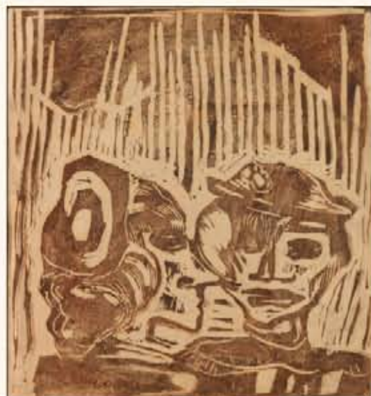
William H. Johnson, Night Birds , woodcut, circa 1935. Estimate $20,000 to $30,000.