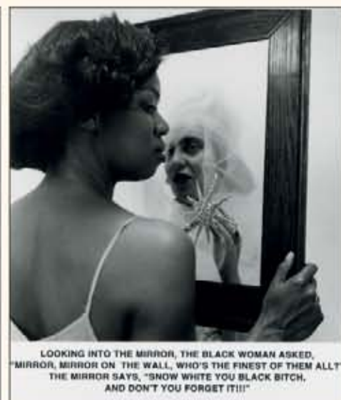
LOOKING INTO THE MIRROR, THE BLACK WOMAN ASKED, "MIRROR, MIRROR ON THE WALL, WHO'S THE FINEST OF THEM ALL?" THE MIRROR SAYS, "SNOW WHITE YOU BLACK BITCH, AND DON'T YOU FORGET IT!!!"