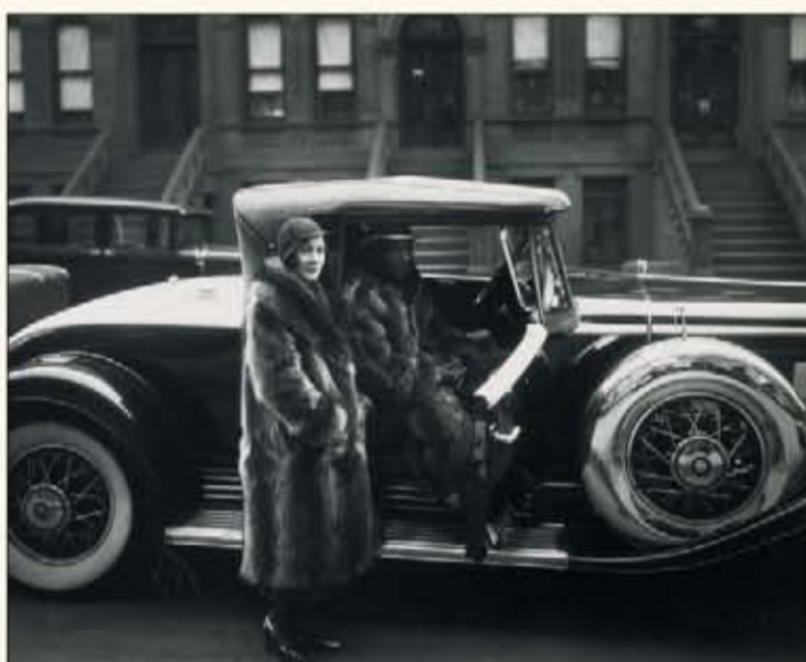
James VanDerZee, Eighteen Photographs , complete portfolio of silver prints, 1905-38. Estimate $35,000 to $50,000.