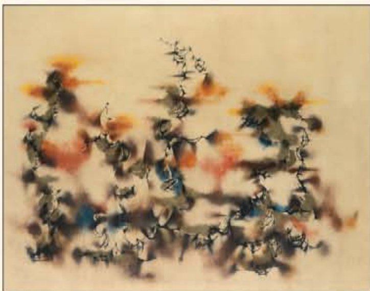
Norman Lewis, Birds in Flight , oil and metallic paint on canvas, 1953. Estimate $150,000 to $250,000.