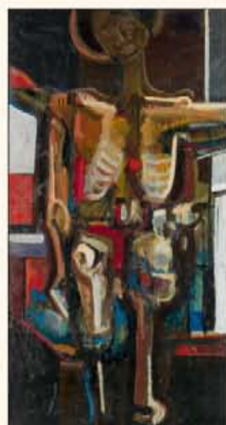
David C. Driskell, Black Crucifixion , oil on canvas, 1964. Estimate $35,000 to $50,000.