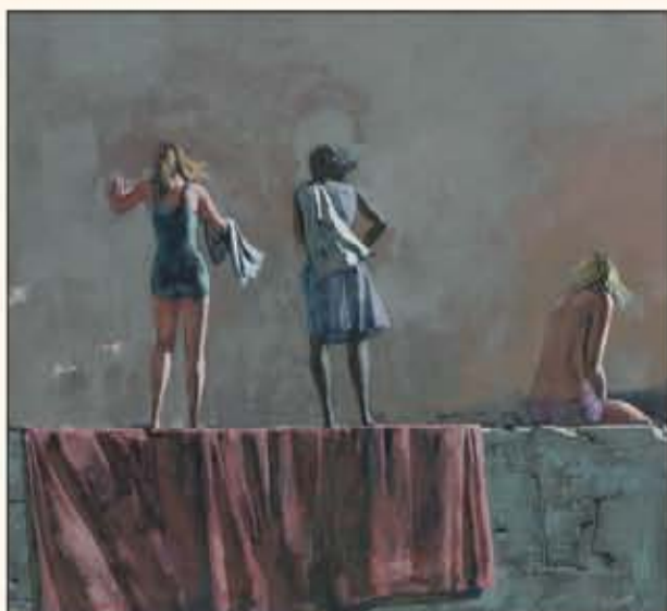
Hughie Lee-Smith, Untitled (Three Women) , oil on canvas, circa 1964. Estimate $30,000 to $40,000.