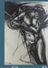
Jose Clemente Orozco (Mexican, 1883-1949) Torso , signed Charcoal: 29 1/2 x 23 1/2 in.