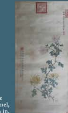
Empress Dowager Cixi (Chinese, 1835-1908) Chrysanthemum , 1902, sealed Ink on silk: 48 x 24 in.