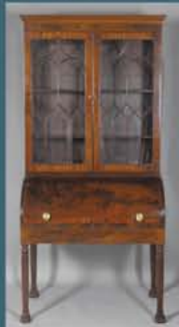
Fine English Regency Banded Mahogany Cylinder Secretary