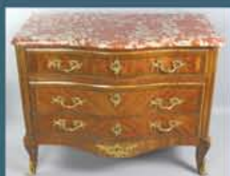
Louis XV Style Ormolu Mounted Royal Tulip and Kingwood Commode