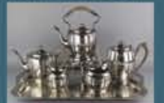
English Five-Piece Silver Tea and Coffee Set and a Plated Tray