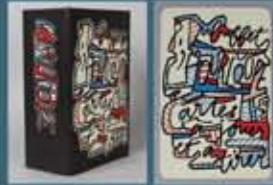
Jean Dubuffet, Banque de l'hourloupe-cartes a jouer... London, 1967