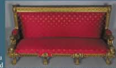
Pair of American Victorian Giltwood Hall Settees