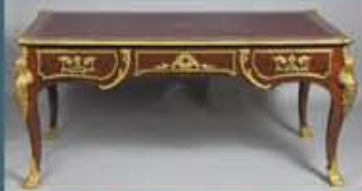
Louis XV Style Gilt Mounted Kingwood Bureau Plat