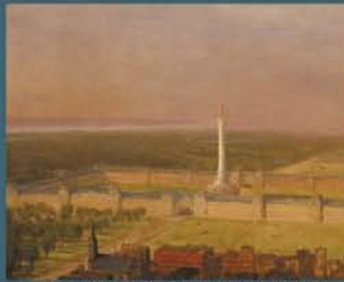
Albert Bierstadt (American, 1830-1902) Project for an American Monument , Possibly Baltimore, Oil on canvas: 38 x 48 in. To be included in the upcoming catalogue raisonne