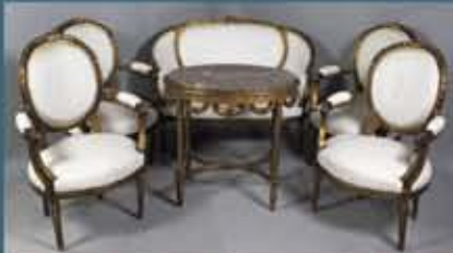
Louis XVI Style Giltwood Six Piece Salon Suite