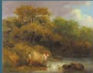
George Morland (British, 1763-1804) Couple Fishing Oil on canvas: 14 x 18 in.