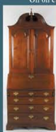
Connecticut Chippendale Cherrywood Secretary