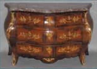
Louis XV Gilt Mounted Marble, Kingwood and Tulipwood Commode