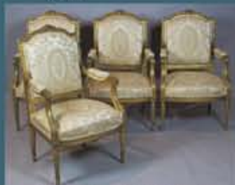
Suite of Louis XVI Style Giltwood Furniture