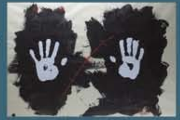
Antoni Tàpies (Spanish, 1923-2012) Manos , signed Acrylic and crayon on paper: 21 1/2 x 32 1/2 in.