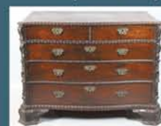
George III Style Carved Mahogany Chest of Drawers