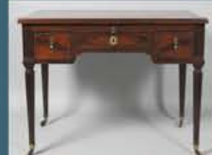
Louis XVI Mahogany Marble Inset Gentleman's Dressing Table