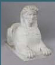
Pair of Large Egyptian Revival Carved Marble Sphinxes, 19th/20th C.