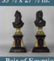
Pair of Egyptian Revival Patinated Bronze Busts