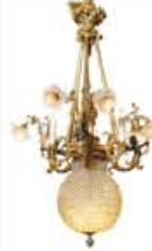
Belle Epoque Gilt and Patinated Bronze Basket Ten Light Chandelier