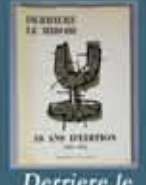
Derriere le miroir: 10 ans d'edition