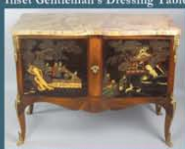
Louis XV Style Coromandel and Kingwood Meuble d'Appui