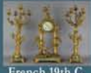
French 19th C. Ormolu and Onyx Figural Clock Garniture