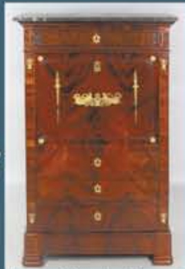
Empire Ormolu Mounted Mahogany Secretaire a Abattant