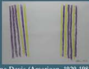
Gene Davis (American, 1920-1985) Four Untitled Works , signed Pastel on paper: 12 x 18 in.