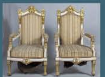
Pair of Russian Neoclassical Parcel Gilt and White Painted Open Arm Chairs