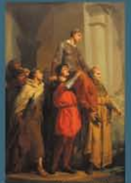
Lawrence Alma-Tadema (British, 1836-1912) Opus XII , 1860, signed Oil on canvas: 36 x 26 in.