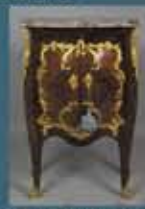
Louis XV Style Ormolu Mounted Kingwood and Mahogany Cabinet