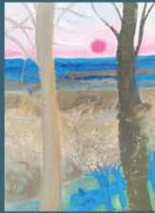
Andre Brasilier (French, 1929-) Le Soleil rose , signed Oil on canvas: 45 x 31 1/4 in.