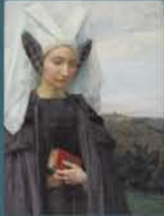
Edgar Maxence (French, 1871-1954) Lady in Medieval Costume , ca. 1913, signed Oil on panel: 13 1/4 x 10 1/2 in.