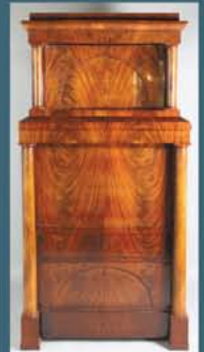
Biedermeier Mahogany Secretaire a Abattant