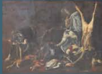
Jan Fyt (Flemish, 1611-1661) Dead Game , signed Oil on canvas: 68 x 95 in.