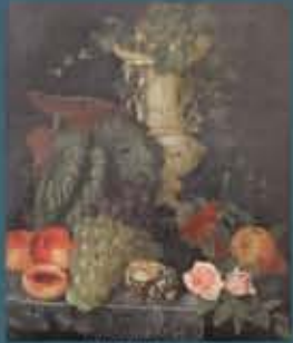
Wilhelm J. (Continental School, 19th C.) Still Life , signed Oil on canvas: 16 1/2 x 14 1/2 in.