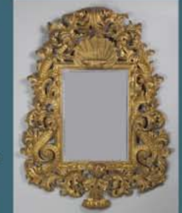
Magnificent Continental Baroque Style Finely Carved Gilt Mirror