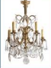
Continental Neoclassical Style Gilt Bronze and Rock Crystal and Crystal Five Light Chandelier