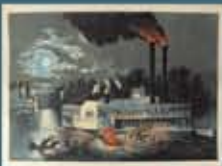
Currier & Ives (New York, 1863) "Wooding Up" on the Mississippi Hand-colored lithograph: 20 3/4 x 30 in.