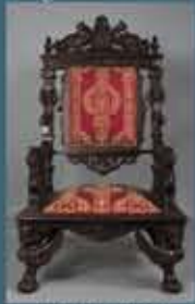
Fine Italian Renaissance Style Walnut Throne Chair