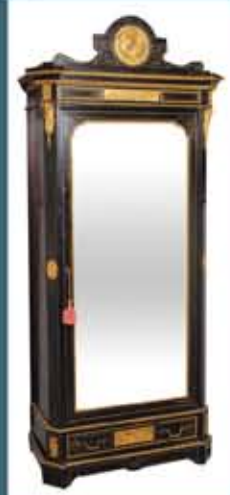
Continental Napoleon Ormolu Mounted Ebonized Armoire