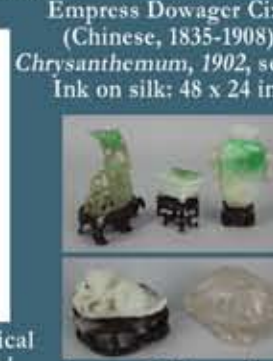
Group of Chinese Jade Carvings