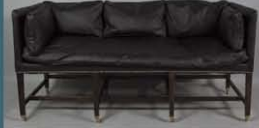
Federal Mahogany Box Sofa with Black Leather Upholstery