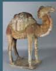
Chinese Polychrome Earthenware Pack Camel, Tang Dynasty, h: 20 1/4 in. TL Test Pending