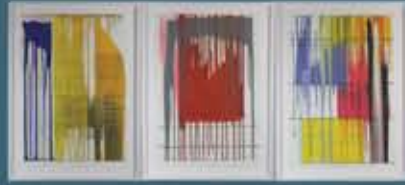
Jacqueline Humphries (American, 1960-), #10, #33, #69 Monotype on pulp paper: 32 x 22 in.