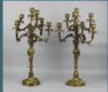
Pair of Louis XV Bronze Seven Light Candelabra