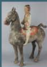
Chinese Painted Pottery Equestrian Group, Han Dynasty, h: 23 1/4 in.