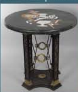
Continental Neoclassical Style Gilt and Patinated Bronze Center Table