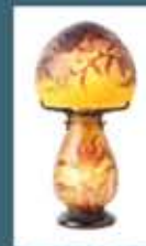
Emile Galle Cameo Glass Mushroom Style Table Lamp