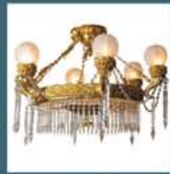
Neoclassical Style Gilt Bronze, Crystal and Frosted Glass Chandelier