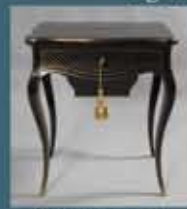
Napoleon III Charles Guillaume Diehl Brass Inlaid Ebonized Dressing Table