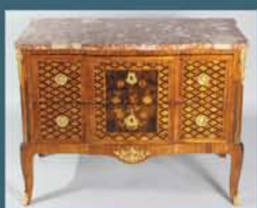
Louis XV/XVI Style Marquetry and Parquetry Tulipwood Commode