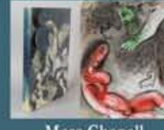
Marc Chagall, Dessins pour la Bible , Paris, 1960