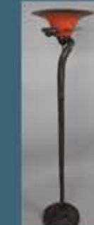
Edgar Brandt Style Art Glass and Brass Serpent Floor Lamp