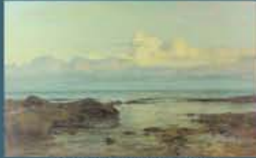
Howard Russell Butler (American, 1856-1934) Seascape , signed Oil on canvas: 15 x 25 in.