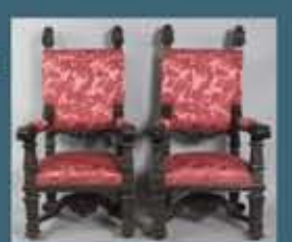
Pair of Continental Baroque Walnut Throne Chairs