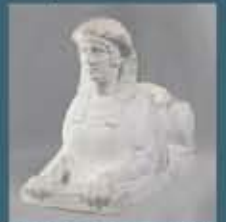
Pair of Large Egyptian Revival Carved Marble Sphinxes, 19th/20th C.