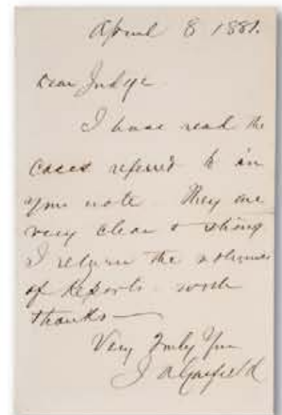
James A. Garfield Autograph Letter Signed as President. One page of a bifolium; April 8, 1881. A letter to an unnamed "Judge". Starting Bid: $9,000 From a collection of 30 presidential letters written while in office; including letters by Harry Truman and Lyndon Johnson.