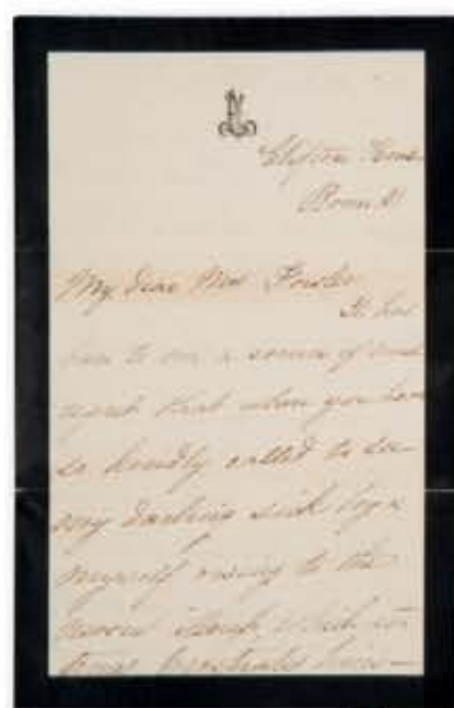
Mary Todd Lincoln Autograph Letter Signed. Three pages, [June 12, 1871]. Mary Todd writes from Clifton House in Chicago and describes the most recent visit from their doctor and expresses hope that Tad is improving. Tad died the following month. Starting Bid: $5,000