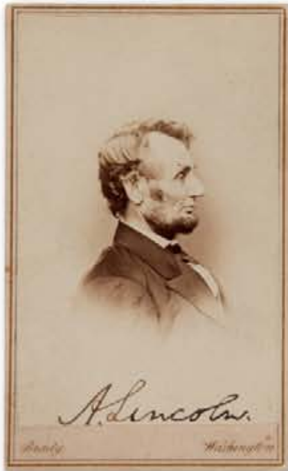
Abraham Lincoln Signed Brady Carte de Visite. Starting Bid: $25,000