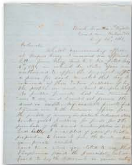
Thomas "Stonewall" Jackson Autograph Letter Signed. Two pages, Camp near Centreville; August 29, 1861. A letter discussing the challenges faced by Jackson in following Robert E. Lee's orders to procure arms at Harper's Ferry. Starting Bid: $9,000