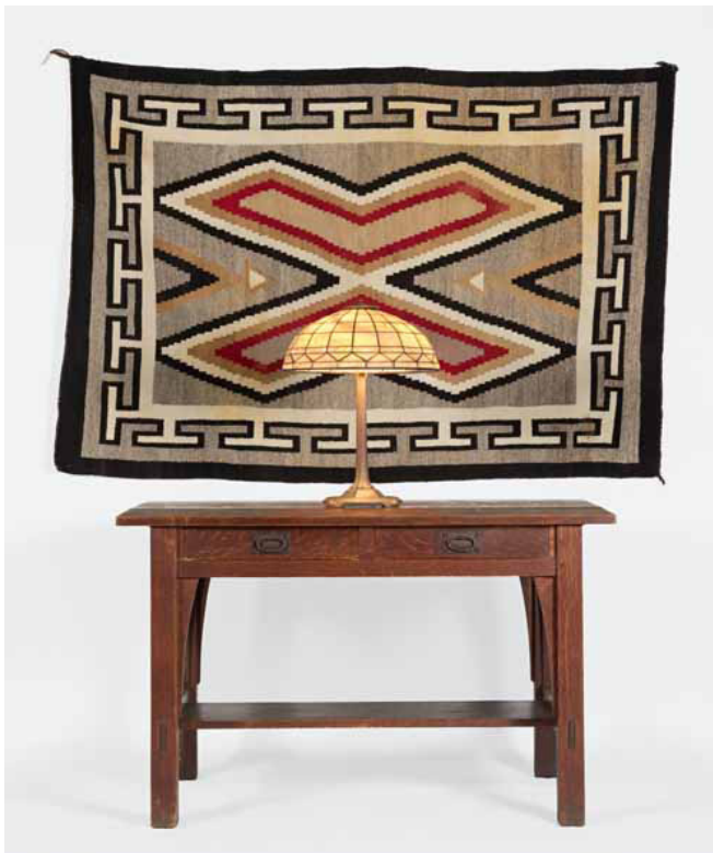
Tiffany Studios on Stickley No. 615