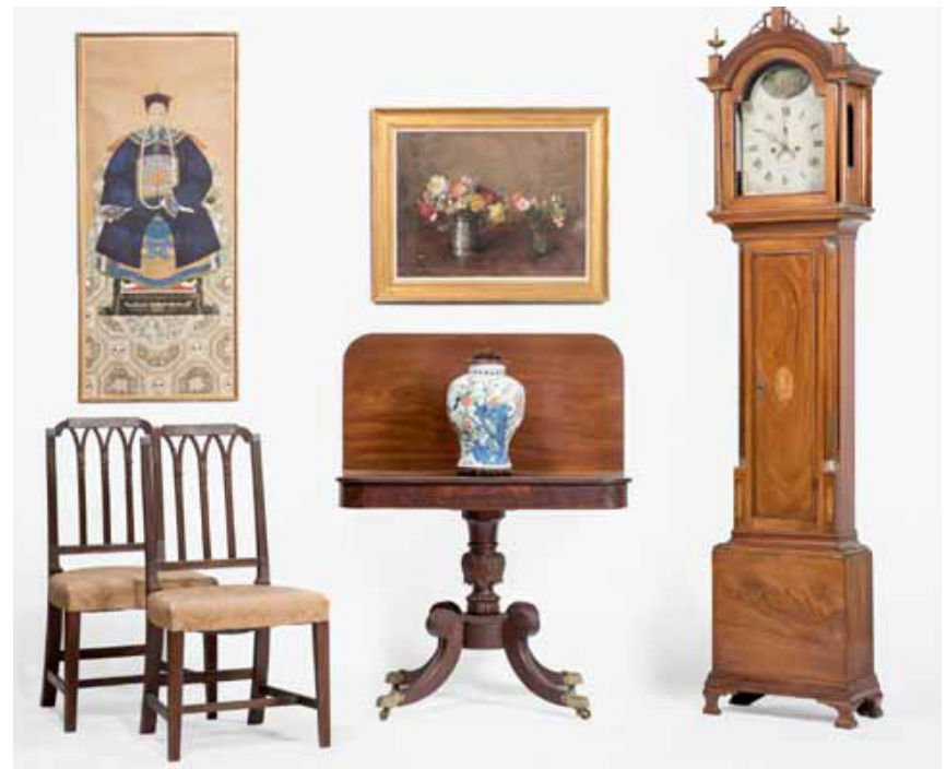
E. Willard Tall Clock