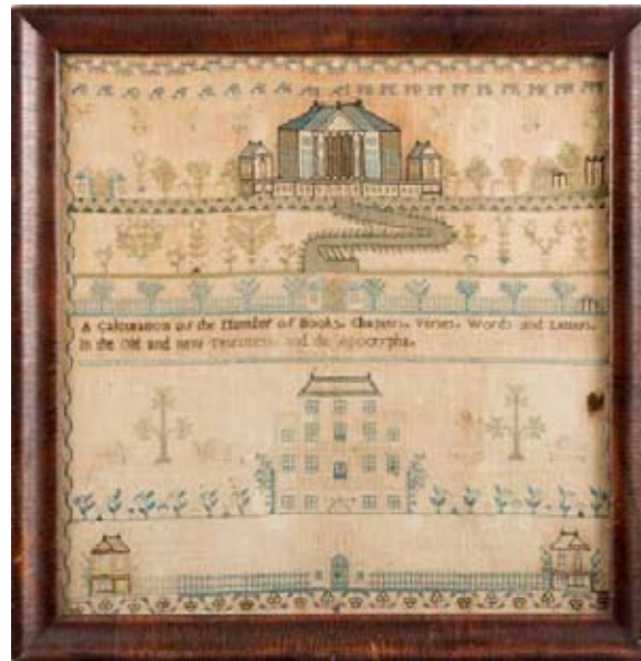
Early and Fine