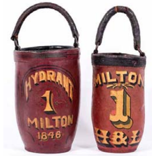
Milton Fire Buckets