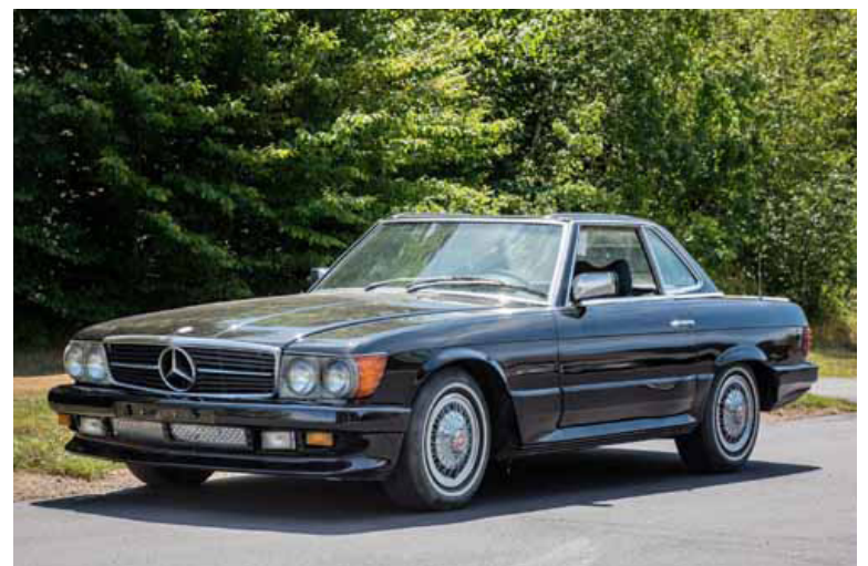
1978 Mercedes 280 SL