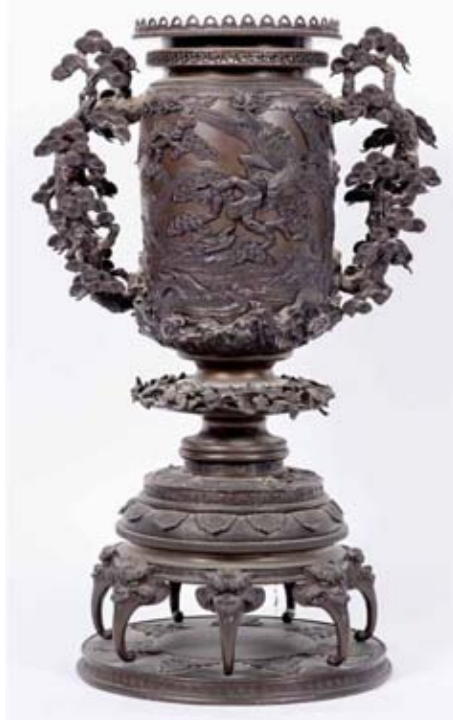
Asian Bronze Lamp