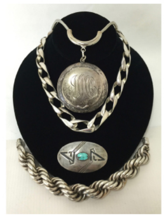
Assorted Antique, Vintage Sterling Jewelry