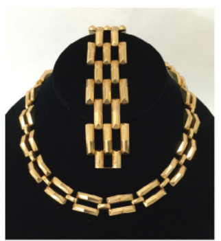
Solid 14kt Yellow Gold Retro Suite

Full Service for 8 -Ivy Pattern Sterling