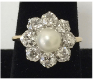
3.12 Carat Diamond Ring with Pearl