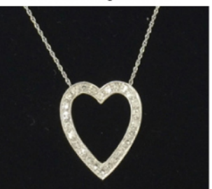
2 Carat Diamond Heart Necklace