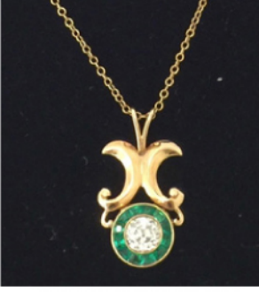
1 Carat Diamond Pendant with Emeralds