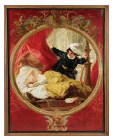
Monumental 19th c. Continental O/b depicting Prince Florimund discovering the Sleeping Beauty, 106"h x 86"w.