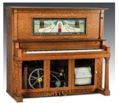
American oak and leaded stained glass Nickelodeon circa 1920, with 41 additional music rolls, 57"h x 53.5"w.