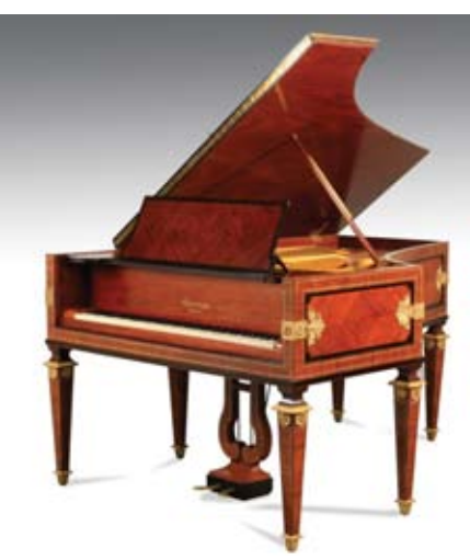
Circa 1920s, Gaveau of Paris grand piano, Modele 3, serial #72976, 76" long.