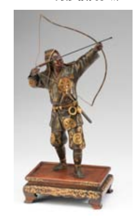
Meiji period Japanese bronze archer, signed Miyao, 13"h x 6.5"w