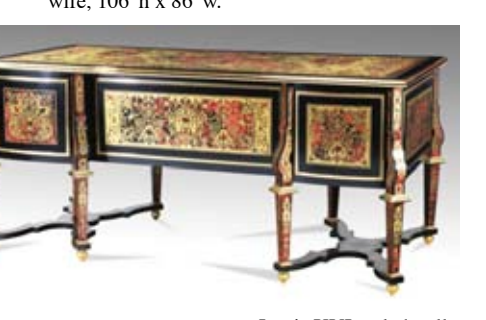
Louis XVI style boulle marquetry desk Mazarin, 34"h x 77"w x 38"d.