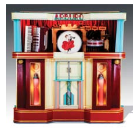
Fine Belgian 'Arburo' stationary beer hall dance organ circa 1935, with 65 additional cylinder tunes, 89.5"h x 93"w.