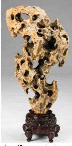
Large Chinese russet and cream scholar's stone, 35"h.