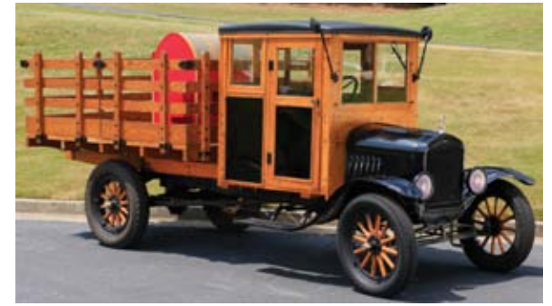
Fully restored 1926 Ford Model TT Farm Truck. Used by its owner for fair and parade presentation of the Tangley Calliope, shown left.