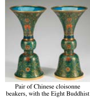
Symbols, 13.5"h x 7"w.