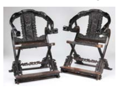
Pair of Chinese carved zitan dragon and cloud folding chairs, 44"h x 29.5"w