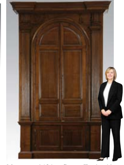
Monumental 18th c. George II oak cabinet, 112"h x 63"w.

Great Gatsby's Auction Gallery • 5180 Peachtree Blvd., Atlanta, GA 30341 • Phone: 770-457-1903 • E-mail: auction@greatgatsbys.com