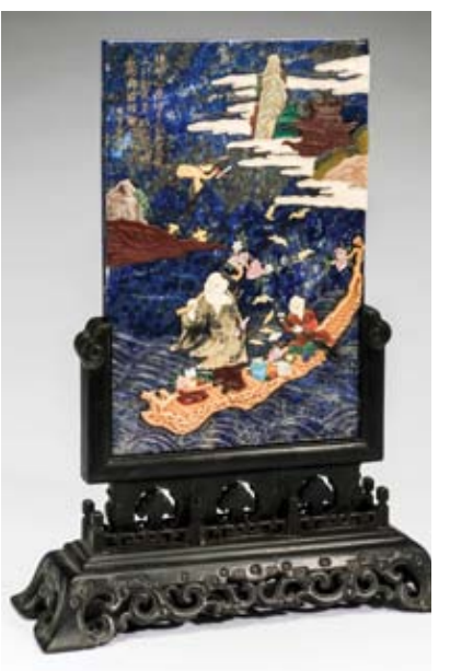
Chinese lapis lazuli and exotic hardstone table screen, depicting Li Tieguai, 13.5"h x 7.25"w.