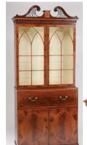
Sheraton mahogany secretary desk, circa 1800, 90"h x 40.75"w