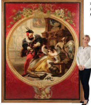
Monumental 19th c. Continental O/b depicting Bluebeard confronting his