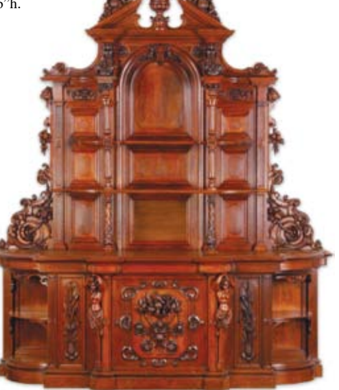
Large and impressive 19th c. Renaissance Revival style carved oak buffet, 115"h x 94"w.