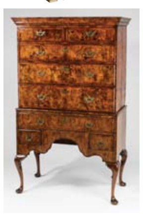
Queen Anne burl highboy, circa 1740, 87.5"h x 40"w