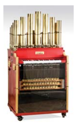
Tangley Electric Calliaphone calliope circa 1920, having brass cylindrical whistles and 20 additional music rolls, 63.5"h x 31.25"w.