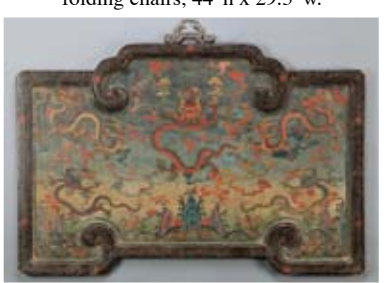
19th c. Chinese lacquered dragon panel on wood, 32"h x 43.5"w.