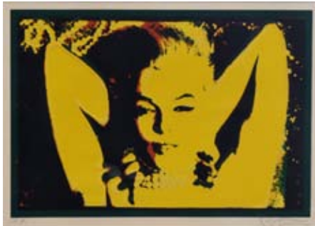
Bert Stern Screenprint Marilyn's Last Sitting