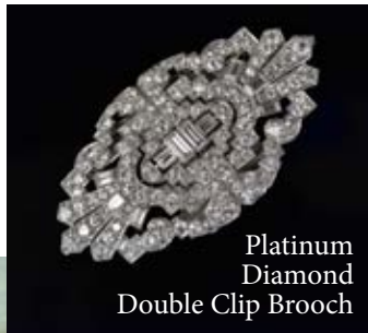
Platinum Diamond Double Clip Brooch