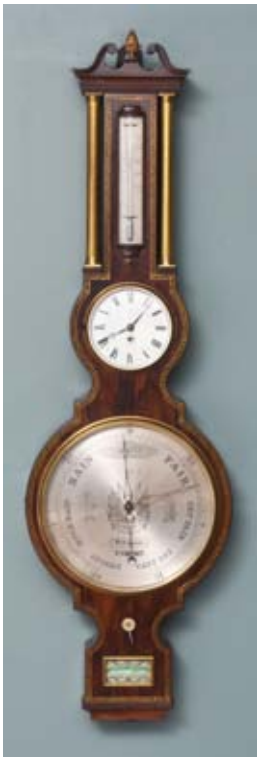
50" Regency Rosewood Barometer w/ Clock (right) Seth Thomas #9