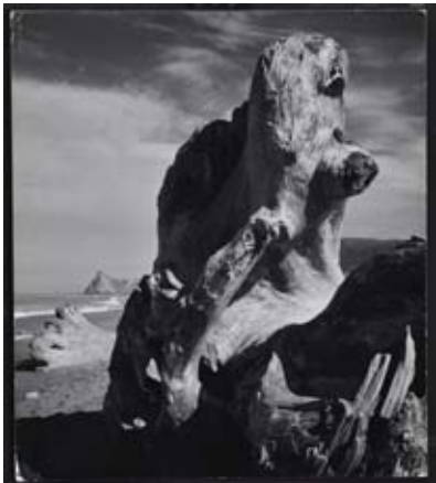
Ansel Adams (1 of 2)