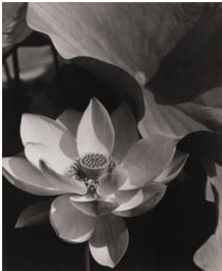
Edward Steichen, Mount Kisco Lotus