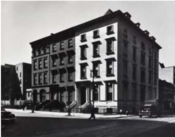
Berenice Abbott, Fifth Avenue