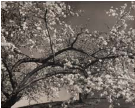
Edward Steichen, Crabapple