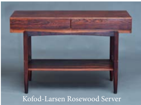
Kofod-Larsen Rosewood Server