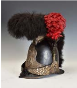
French Cuirassier Helmet