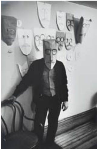
Inge Morath portfolio