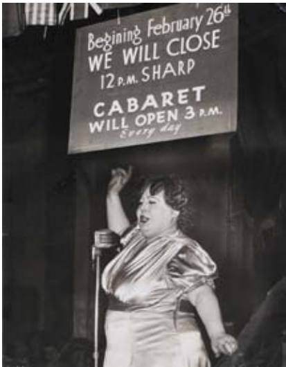
Weegee (Arthur Fellig)