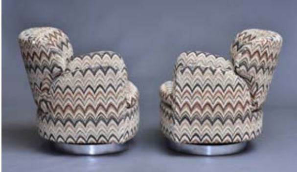
Milo Baughman for Thayer Coggin

FAIRFIELD AUCTION 707 Main Street Monroe, CT 06468 telephone (203) 880-5200 jack@fairfieldauction.com