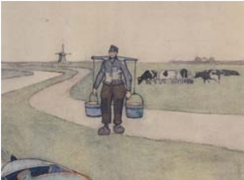
Edward Penfield (1 of 2)