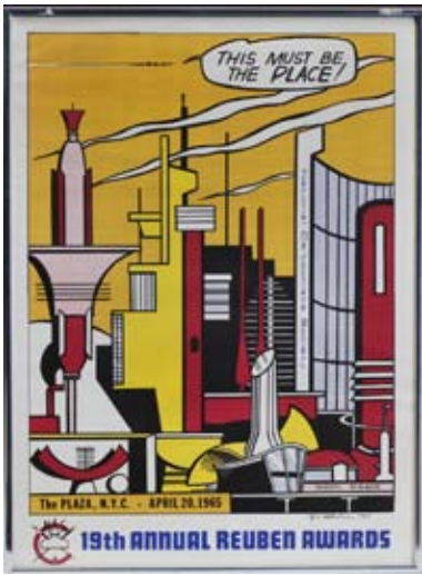
Roy Lichtenstein, 1965