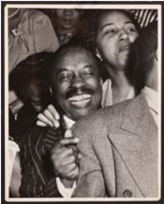
Weegee (Arthur Fellig)