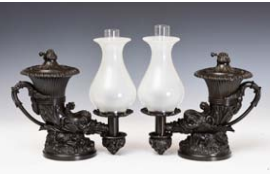
Collection of Early Lighting including Argand

FAIRFIELD AUCTION 707 Main Street Monroe, CT 06468 telephone (203) 880-5200 jack@fairfieldauction.com