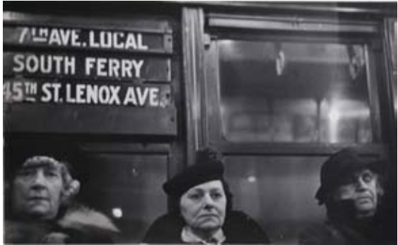
Walker Evans, 7th Avenue Local