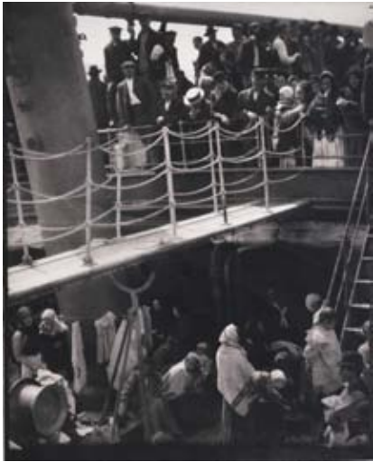
Alfred Stieglitz, The Steerage