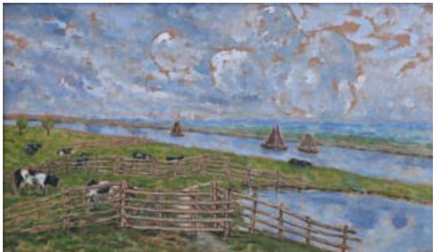
William Degouve Nuncques, 15"x25" oil on board