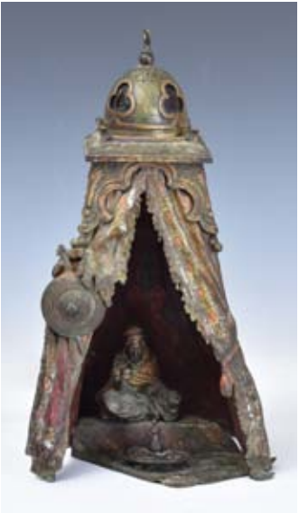
Franz Bergman Arab Lamp