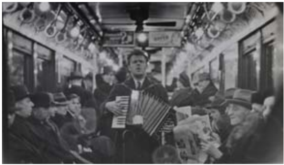
Walker Evans, Blind Accordion Player