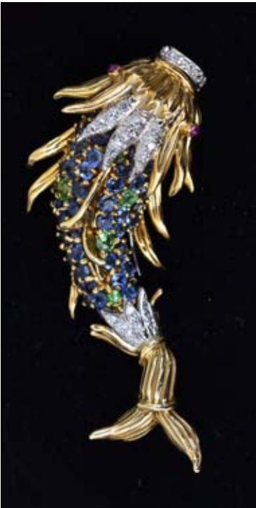
Schlumberger for Tiffany & Co