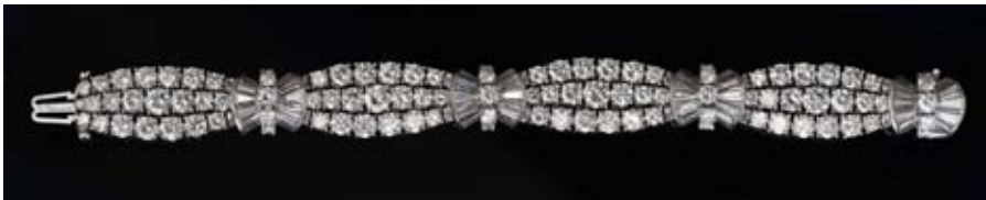
Platinum Diamond Swag Bracelet, 37 carats total weight