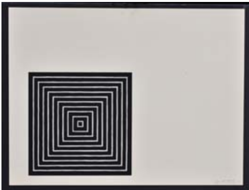
Conspiracy: The Artist as Witness, 1971 portfolio with 12 signed lithos incl. Stella, Calder, Bearden, Lewitt, Oldenburg

FAIRFIELD AUCTION 707 Main Street Monroe, CT 06468 telephone (203) 880-5200 jack@fairfielddauction.com