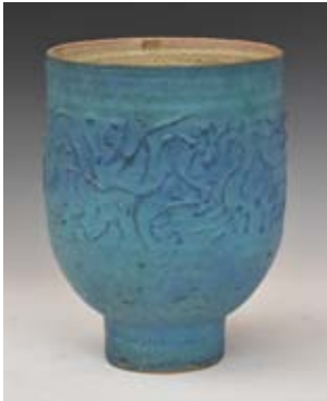
Scheier Pottery, 12 1/2"

Friday, September 16th, 5pm-7pm refreshments will be served