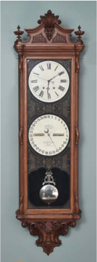
Ithaca Sweep Regulator