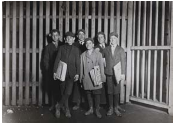
Lewis Hine (1 of 4)