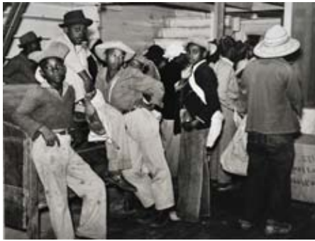
Marion Post Wolcott