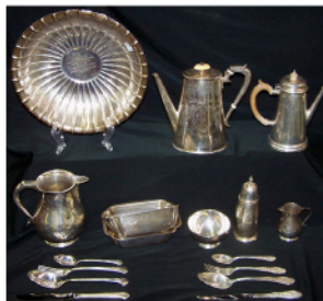
Sterling & Elkington Plate