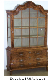
Burled Walnut Dutch Kast