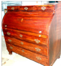
Cylinder Roll Top Secretary