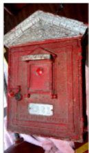
Gamewell Fire Alarm Box