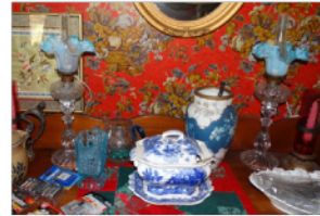
2 Peg Lamps