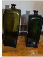
2 Early Bottles