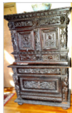
Early Bureau w/ Carved Head Handles