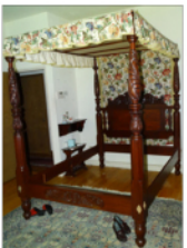
Heavily Carved 4-Post Bed