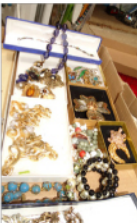
Brand Name Jewelry