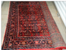
10' x 5' Oriental Rug