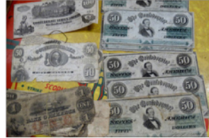
3 Lots of Confederate Money