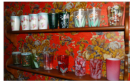
Lot of Opalescent Glasses