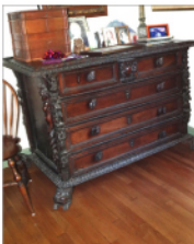
Heavily Carved Chest of Drawers