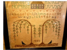
1889 Sampler w/ Birds and Trees