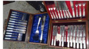
Mother of Pearl Handle Flatware