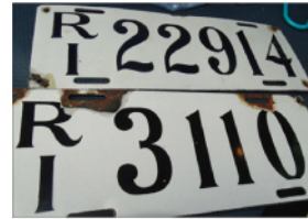
2 Early RI Porcelain License Plates