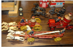
6 Cast Iron Horse Drawn Fire Engines

DIRECTIONS: FROM CT, take 95 north to exit 5A (102 S). follow 102 S, cross over Rt 3 and continue on 102 for approx 9 mi. Temple is on left. FROM MASS: take 95 south to exit 9 (Rt 4), follow Rt 4 to exit 5B (102 N). stay on 102 for ¼ mile. Temple is on right.