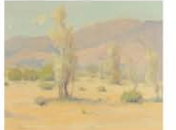
MB (American, 20th Century) Smoke Trees Near Palm Springs