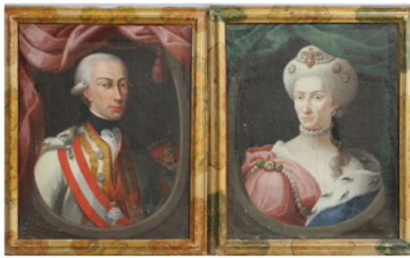
Pair 18th century portraits