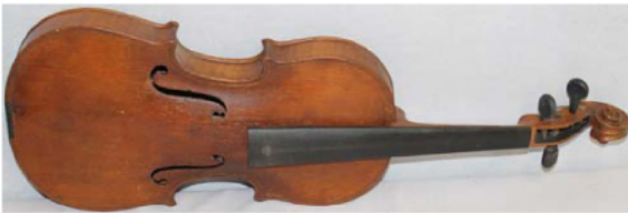
Violin labeled Andreas Guarnerius