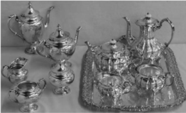
Gorham Sterling & Sheffield