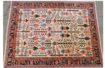
Oriental rug 11.8 x 9.2