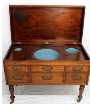
Mahogany Campaign Chest open