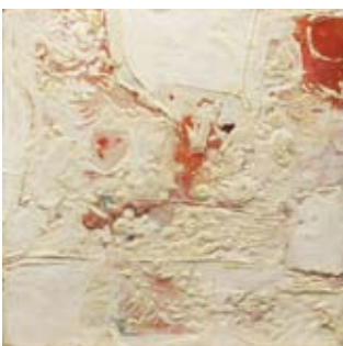
Bruce Guldner Conner (American, 1933-2008), Untitled (Abstract Over Orange), 1957, oil on canvas, 12" x 12"