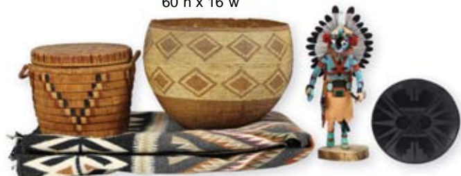
Selection of Native American baskets, pottery, kachina dolls, and rugs