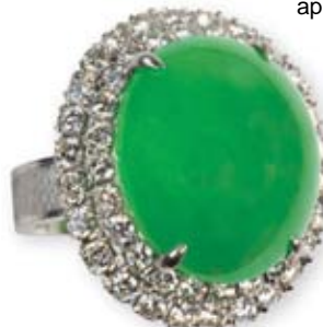
Jadeite diamond and platinum ring, jadeite measures 18.33 x 15.39 x 8.06 mm