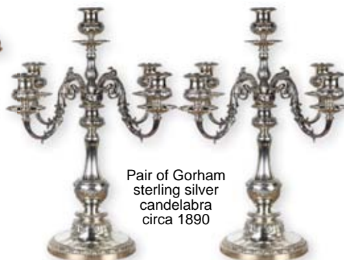
Pair of Gorham sterling silver candelabra circa 1890