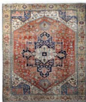
Antique Persian Serapi carpet, 12' x 15'9"