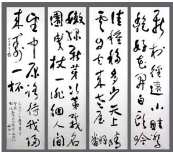
Set of four calligraphy by Yu Youren (Chinese, 1879-1964), ink on paper, dated Republic 40th year, each calligraphy: 60"h x 16"w