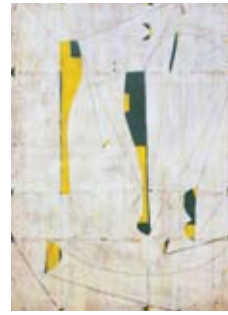
Caio Fonseca (American, b. 1959), "Tenth Street Painting (C96.13)," 1996, acrylic on canvas, 72" x 52" (1 of 2)