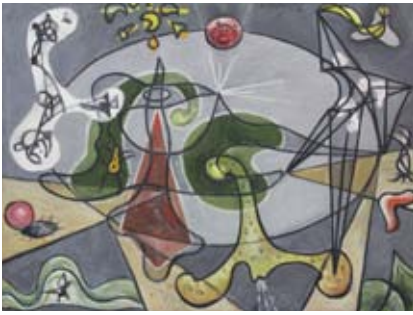
Gordon Onslow Ford (American, 1912-2003), "Escape," 1939, oil on canvas, 30" x 40" (1 of 3)