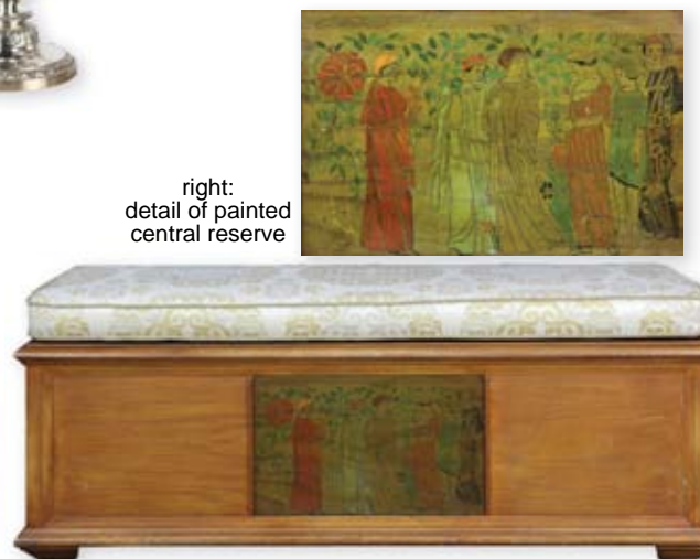
Arthur and Lucia Mathews blanket chest, the case having a hand painted central reserve