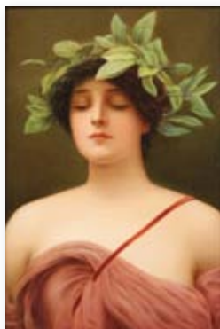
Selection of Continental porcelain including a KPM plaque signed Wagner