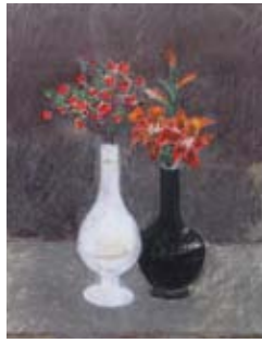
Morris Graves (American, 1910-2003), "Summer Bouquet," 1997, pastel on paper, 19.5" x 14.5"