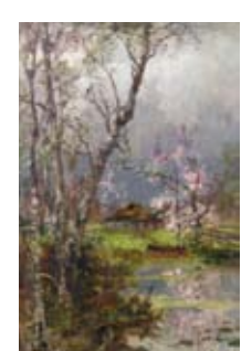
Honig Krebepz (German, 19th/20th century), Spring Cottage, 1911, oil on canvas, 20.5" x 13.75"