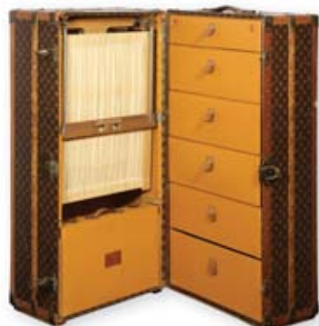
Louis Vuitton monogram trunks, early 20th century, including a wardrobe