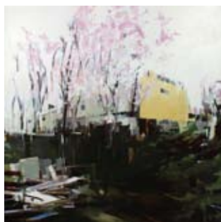
Alex Kanevsky (American/Russian, b. 1963), "Backyard," 2008, oil on canvas, 66" x 66"