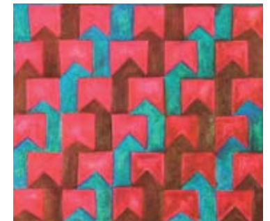
Alfredo Volpi (Brazilian, 1896-1988), "Bandeirinhas," 1978, oil/mixed media on cardboard, 16" x 20"