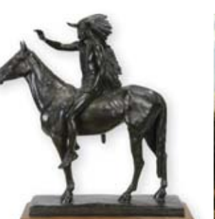
Cyrus Edwin Dallin (American/French, 1861-1944), "Medicine Man," 1899, bronze sculpture, 31" h