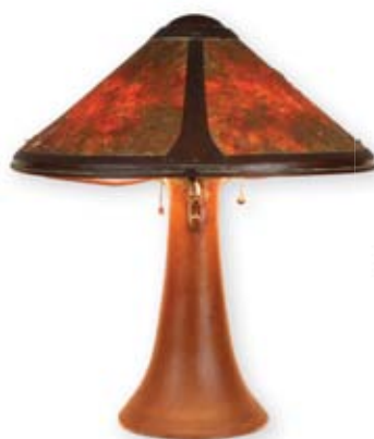
Dirk Van Erp hammered copper and mica table lamp