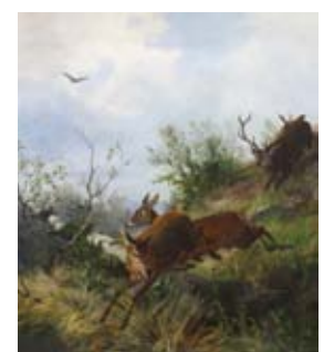
Arthur Fitzwilliam Tait (American, 1819-1905), Running Deer, 23" h x 20"