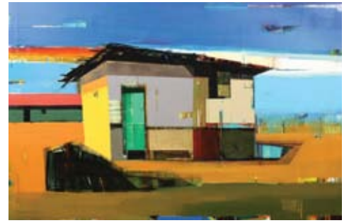
Siddharth Parasnis (American/Indian, b. 1977), "California Baja 13," circa 2008, oil on canvas, 50" x 70" (1 of 2)