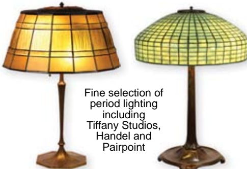
Fine selection of period lighting including Tiffany Studios, Handel and Pairpoint