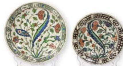
Turkish Iznik pottery chargers, mid-17th century