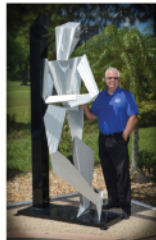
Lot 1101 Abstract Aluminum Sculpture of a Man: 95”h x 51w x 23”