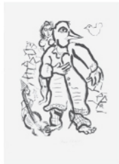
Lot 1035 One of 2 Chagall Lithographs in the Sale