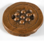
Lot 1022 Marcel Duchamp Bronze Sink Stop

1054 Gorgeous 14K Yellow Gold and Diamond Ring; Platinum Emerald Cut Emerald Ring with 22 European Cut Diamonds