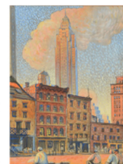
Lot 1195 WPA Era Gouache of NYC, Empire State Building by Francisco Cornejo