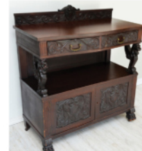
Lot 1051 Horner Quality Carved Hunt Board