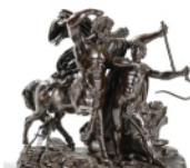
Lot 1015 Education of Achilles Bronze after Rude