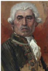
Lot 1018 Jean Paul Laurens Oil, Portrait of an Officer