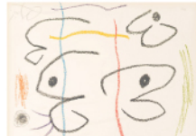
Lot 1033 One of 2 Miro Prints in the Sale