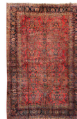
Lot 1159 Palatial Persian Isfahan Carpet