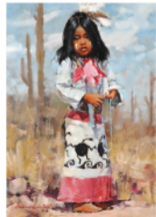
Lot 1324 Stanislaus Sowinski Oil, “Elena”