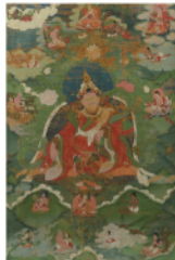
Lot 1027 One of 4 Estate Fresh Thangkas in the sale