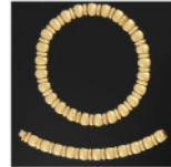
Lot 1120 18K High End Italian 18k Gold Necklace & Bracelet: Hallmarked, 150 grams tw