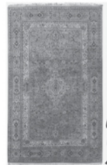
Lot 1151 Palatial Persian Sarouk Carpet