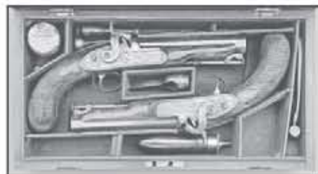
Cased Pair of Percussion Pistols by Westley Richards of London