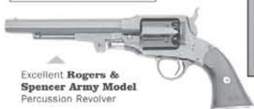
Excellent Rogers & Spencer Army Model Percussion Revolver