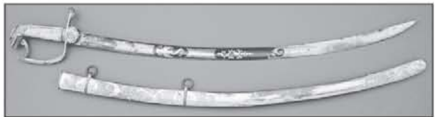
Fine High Grade American Eaglehead Officer's Sword

CATALOGS: $35 Ground to be mailed on August 12th