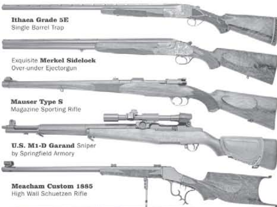
Ithaca Grade 5E Single Barrel Trap