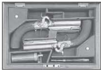
Cased Pair of Identified London Boxlock Percussion Pistols by James Wilkinson & Son