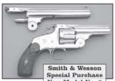
Smith & Wesson Special Purchase New Model No. 3 Target Revolver Two Barrel Set