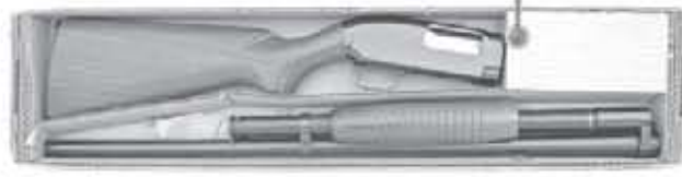
Winchester Model 12 Slide Action Shotgun in Original Factory Box