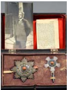
Chinese double dragon medals, Fowler Prov.