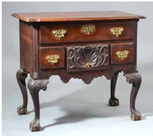
Philadelphia Chippendale shell and vine carved lowboy