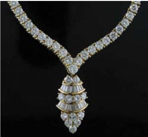
21 ct. diamond necklace