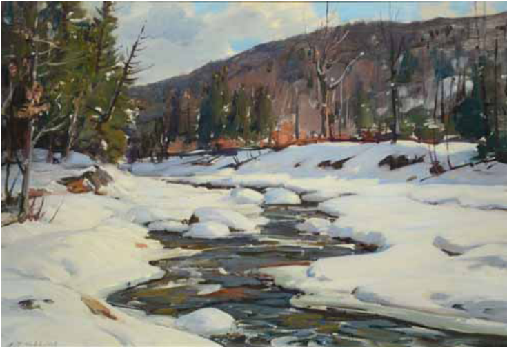
1 of 3 oils, A. Hibbard

Smith's is proud to offer these estate collections from prominent New England families, 99% of these items will be sold without reserve. Labor Day represents the best quality material found throughout the summer and we here at Smith's believe in the traditional auction process, in house, phone and absentee bids gladly accepted, however internet bidding is not offered, (items can be viewed online at www.wsmithauction.com ) Come visit Northern New England for the weekend, East Coast deliveries offered.