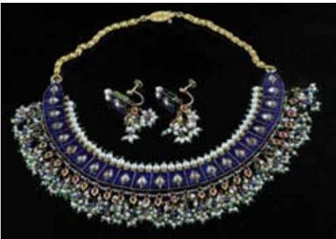
Moghul high karat gold necklace