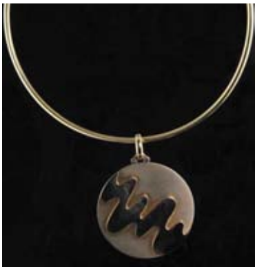
18K Bulgari necklace