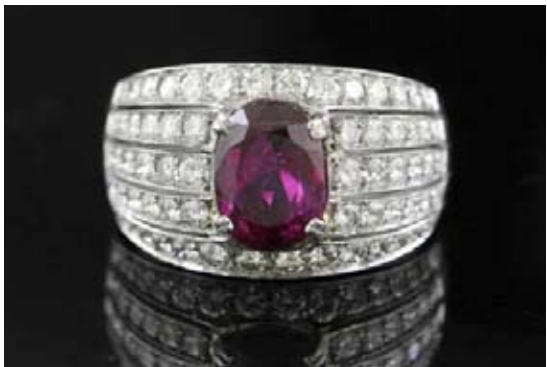
Burmese Ruby & Diamond ring