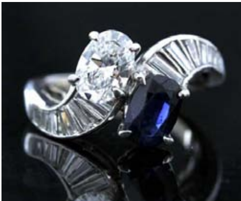
Diamond & Sapphire ring