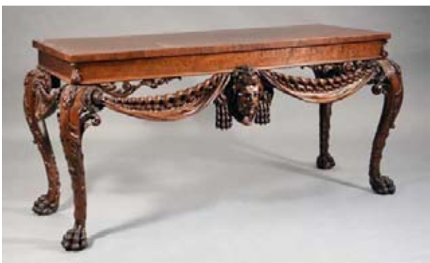
Exhibited Flagler museum