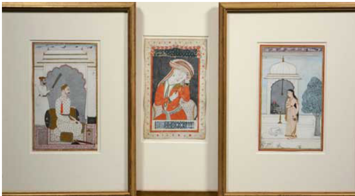
Early Indian paintings