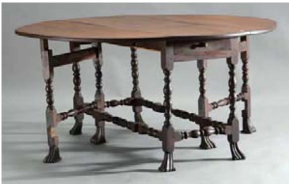
NH Queen Anne