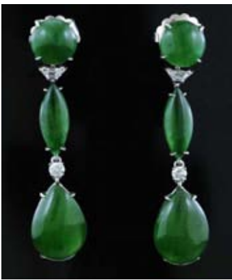
Jade, diamond and platinum