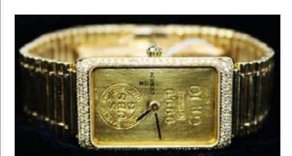
18k yg lady's Corum UBS wristwatch w ingot face, diamond surround and 18k band