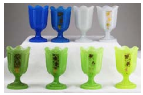
Colored and gilt cable pressed glass spooners