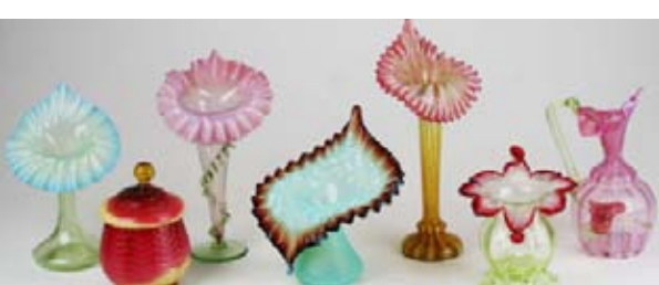
Collection of rare colored Victorian glass