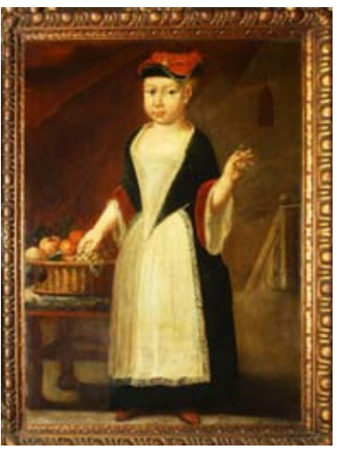
Early 18th c Flemish o c full length portrait of girl and fruit basket 36 x 29"