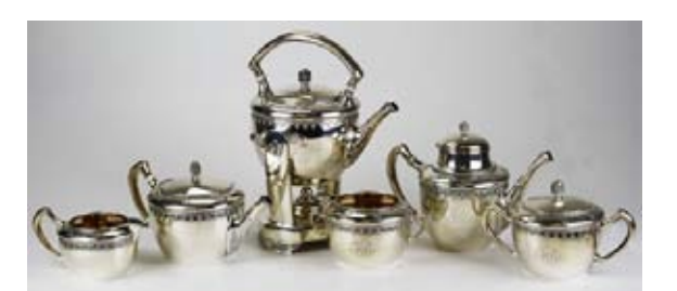
6pc Gorham sterling and gold wash tea set