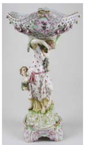
17" high KPM porcelain figural basket group