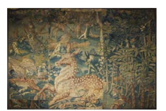
17th c Flemish tapestry pieced and stitched together