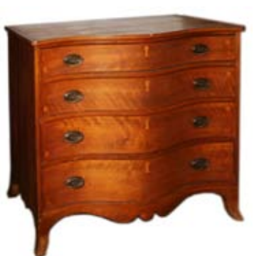
Southern Hepplewhite serpentine mahogany fan inlaid French foot chest