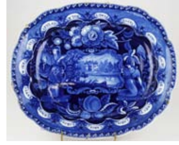
Large collection historical blue Staffordshire