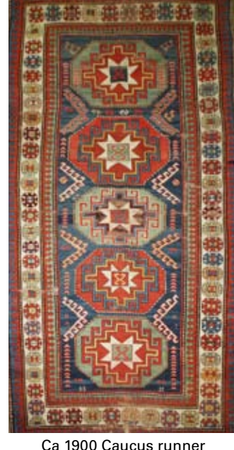
10 x 4.5 ft