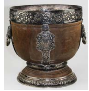
1676 Sir Robert Clayton silver mounted lignum vitae wassail bowl