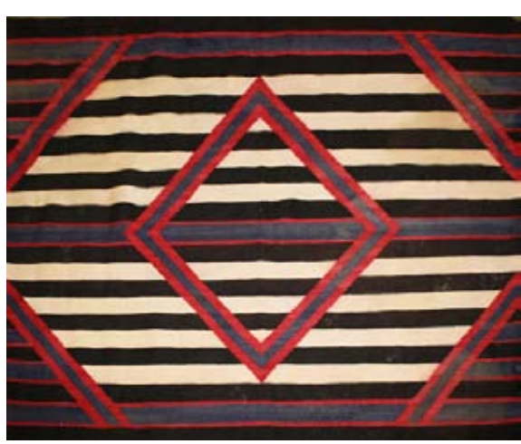
Second Phase Navajo chief's blanket