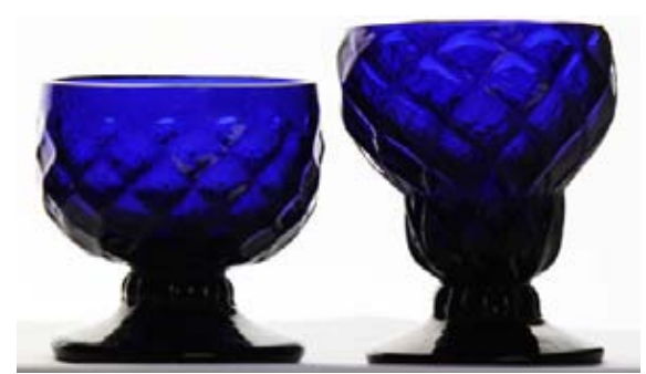
2 diamond pattern cobalt blue salts