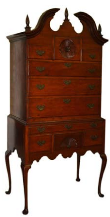
18th c New England Queen Anne cherry bonnet top highboy