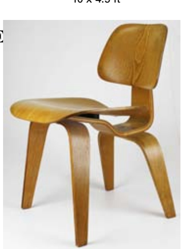
Set of 3 Eames potato chip chairs with tags and original receipt