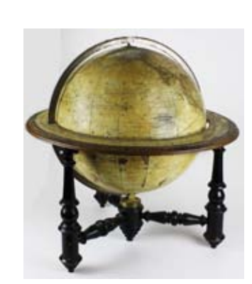
20 in Schedler's Terrestrial Library Globe