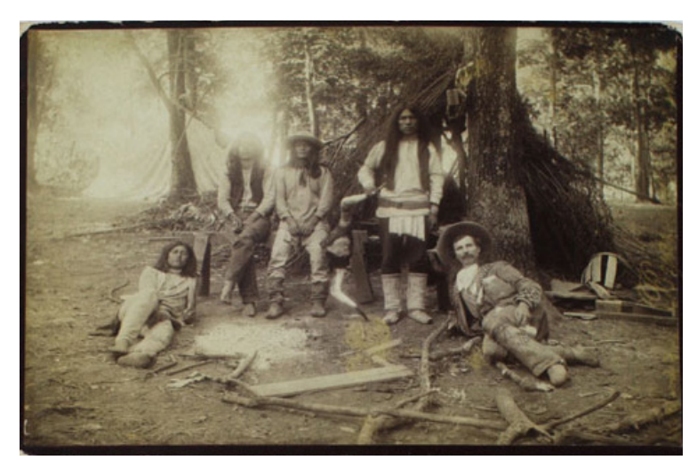
Large cabinet photo of Buck Taylor of Buffalo Bills Wild West Show with