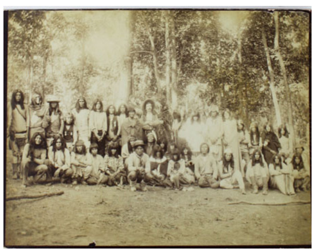
Large cabinet photo of BuckTaylor of Buffalo Bills Wild West Show with Native American tribe