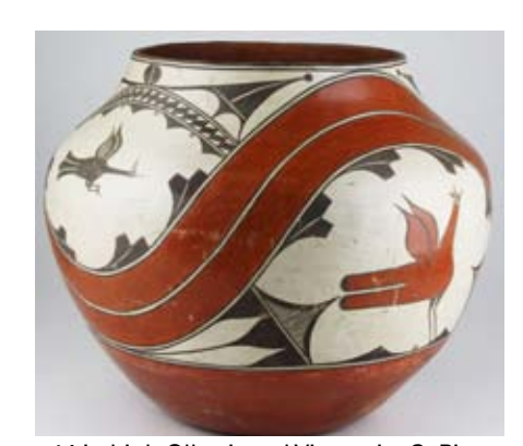
14 in high Olla signed Vincentita S. Pino