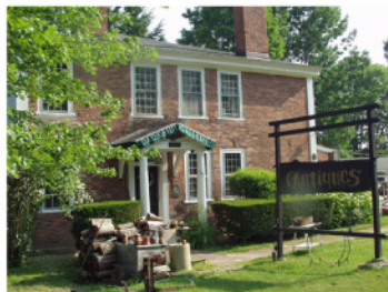
Old Antique Shop at North Branch