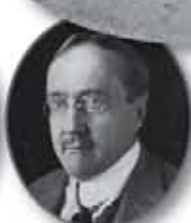
James W. Gerard