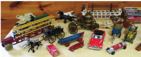
Iron and tin toys