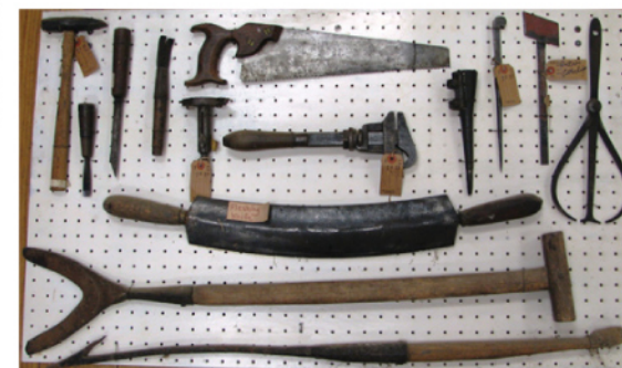
Early unique hand forged tools