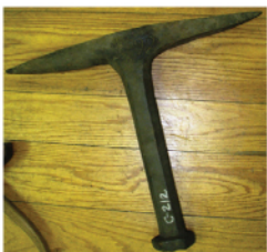
Tenon anvil dated 1697