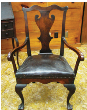
18th C. Pennsylvania armchair