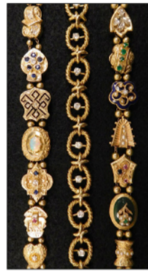
14K & Assorted Stones