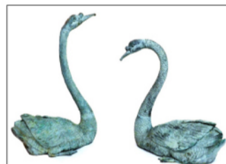
Bronze Garden Sculpture, 36" h.