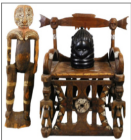
25+ African Lots