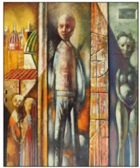
Noel Rockmore, oil, 30" x 25"