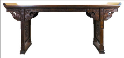
Late 19th C. Chinese Huanghuali