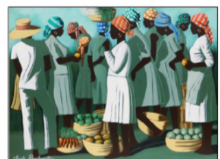
Dambreville, oil, 29" x 39"