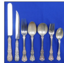
T. & Co. "Eng. King" (100 pcs)