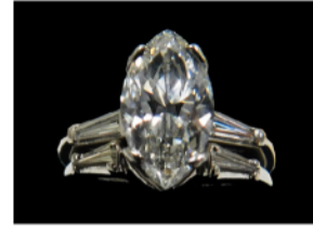
Plat. & Diam. (2 cts.)