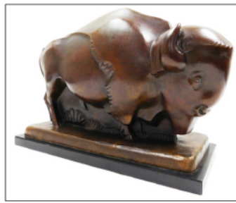
Laci de Gerenday Bronze, 11" h.