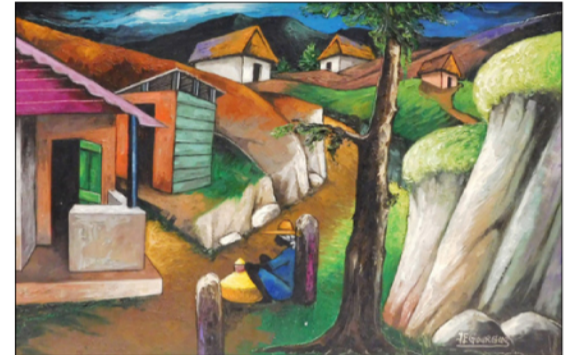
Jacques Gourgue, acrylic, 15" x 23"