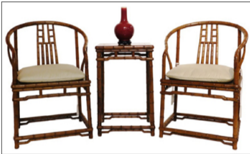
19th/20th C. Chinese