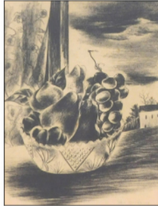
Kuniyoshi, litho., 15" x 12"