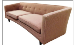
Edward Wormley for Dunbar