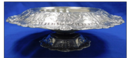
Gorham, 15" dia.