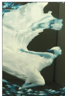
Howard Schatz, "Atlantis #1"