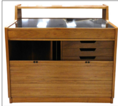
Edward Wormley for Dunbar