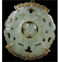
18K & Jade