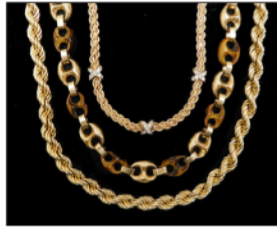
14-18K, Tiger's Eye, Diam.