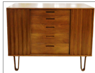
Dunbar "Mr. & Mrs." Chest