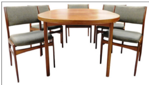
Dux & Other Scandinavian