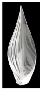
C. Ries, 12" h.

View catalog online at www.AuctionsAppraisers.com