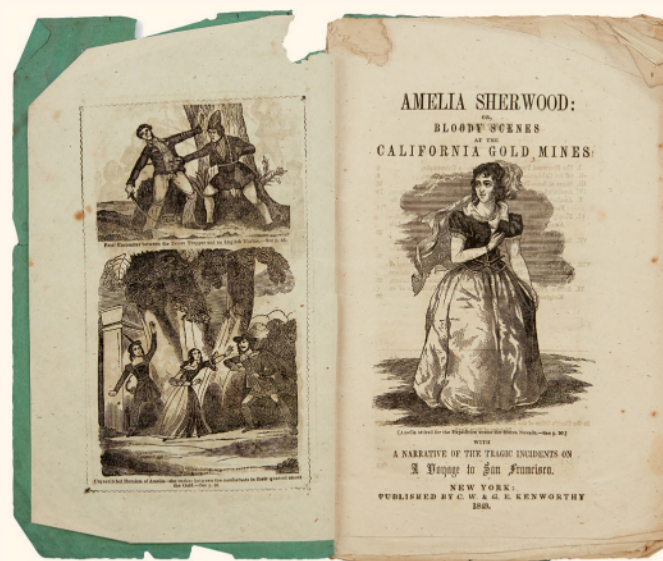
Amelia Sherwood; or, Bloody Scenes at the California Gold Mines , first edition, New York, 1849. Estimate $5,000 to $7,500.