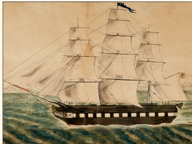
Ed Cushion, pair of watercolors from an American merchant ship, circa 1830s. Estimate $3,000 to $4,000.