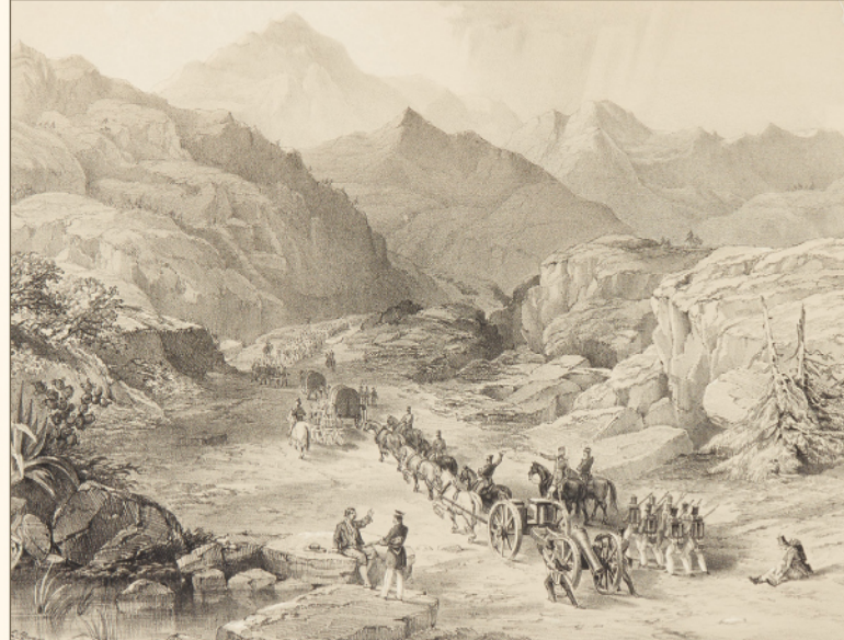
John Phillips & A. Rider, Mexico Illustrated in Twenty-Six Drawings , first edition, London, 1848. Estimate $20,000 to $30,000.