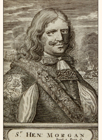
Alexandre Olivier Exquemelin, Bucaniers of America , London, 1684-85. Estimate $2,500 to $3,500.