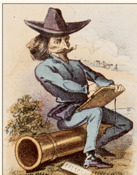
Winslow Homer, self-portrait from a set of 12 cards, the artist's Life in Camp, Part 2 , depicting scenes of the Civil War, 1864. Estimate $4,000 to $6,000.