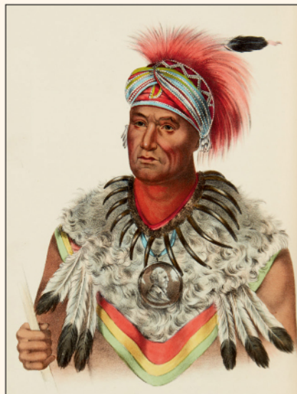
McKenney & Hall, History of the Indian Tribes of North America , with hand-colored lithographed plates, 1855. Estimate $7,000 to $10,000.