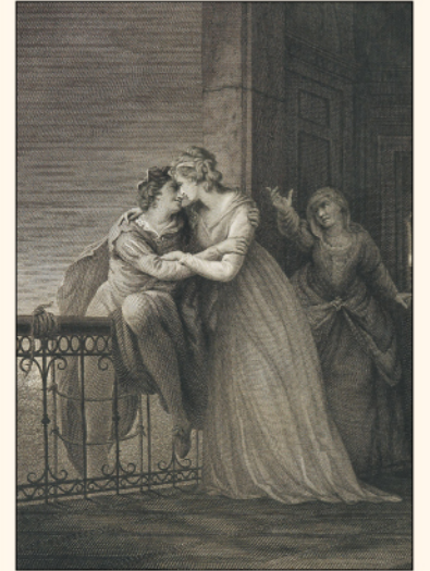
William Shakespeare, The Dramatic Works , nine volumes, with 96 copper engravings, London: Boydell, 1802. Estimate $5,000 to $7,500.