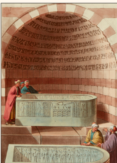
Luigi Mayer, Views in Egypt , with 48 color aquatint plates, London, 1801. Estimate $2,500 to $3,500.