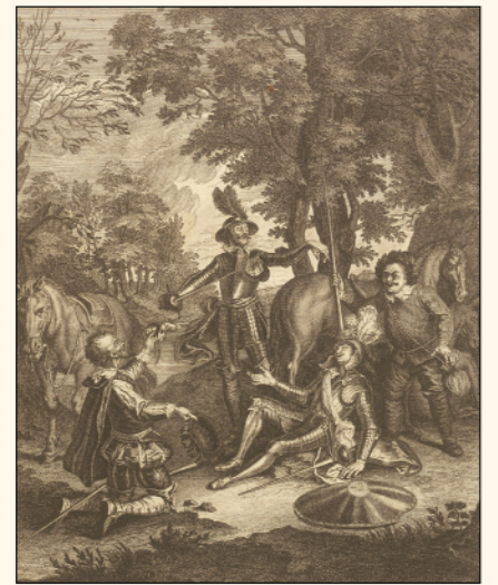
Cervantes, Don Quichotte , with 25 engravings by Bernard Picart after Charles Coypel, Paris, 1746. Estimate $3,000 to $4,000.