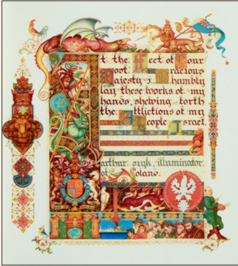
Arthur Szyk, The Szyk Haggadah , first limited edition, with 14 full page plates, signed by Szyk, London, 1939. Estimate $15,000 to $25,000.