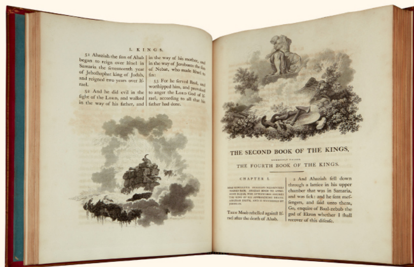
The Old Testament [&] New Testament, Embellished with Engravings, ... by the Most Eminent English Artists , seven volumes, with 70 copper plates, London, 1800. Estimate $3,000 to $4,000.