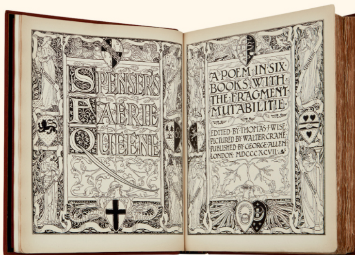
Edmund Spenser, The Faerie Queene , illustrated by Walter Crane, six volumes bound in three, London, 1897. Estimate $3,500 to $5,000.