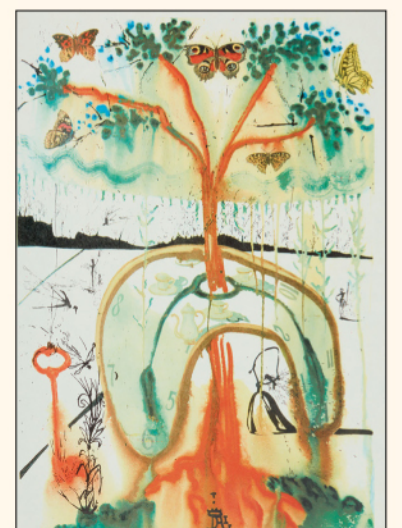
Alice's Adventures in Wonderland , deluxe edition, illustrated & signed by Dalí, NY, 1969. Estimate $12,000 to $18,000.