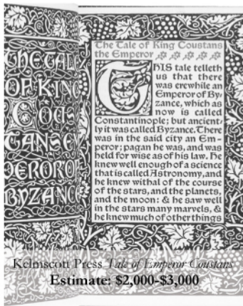
Kelmscott Press Tale of Emperor Constantine Estimate: $2,000-$3,000

1233 Sutter Street : San Francisco, CA 94109 415.989.2665 pba@pbagalleries.com www.pbagalleries.com