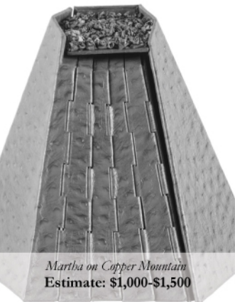
Martha on Copper Mountain Estimate: $1,000-$1,500

Doves Press The English Bible Estimate: $6,000-$9,000