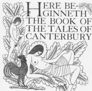
Golden Cockerel Press The Canterbury Tales Estimate: $7,000-$10,000