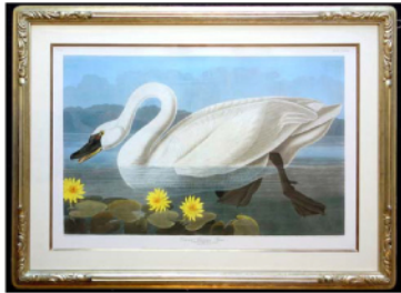
Oppenheimer Field Museum Audubons

Bid Online at: www.liveauctioneers.com ● liveauctioneers