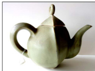
Sample of Art Pottery