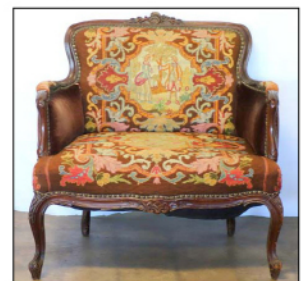
French Settee 19th c.