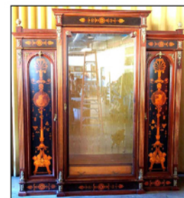
Sample Victorian Furniture