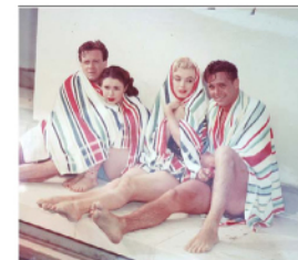
Grouping Marilyn Monroe Photos