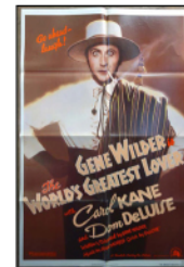
Sample of Paper Goods