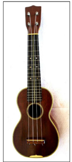
Martin Soprano Style 3 Uke