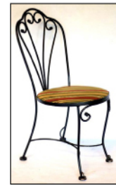
46 Meadowcraft Patio Chairs (sold in sets)