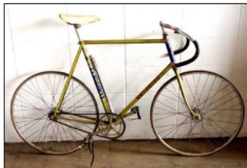
Three Racing Bikes