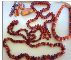
Balkin Amber Jewelry