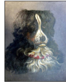
Sample of Country Artwork - 19th c.