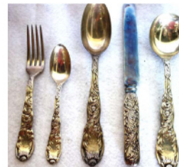
Tiffany Chrysanthemum Pattern