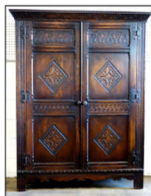
Fine 11 Piece Jacobean style DR Set