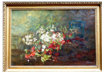
O/C Signed Vernon Ward