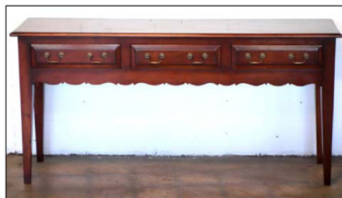
Sample of Quality Custom Furniture