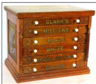
Large Spool Cabinet