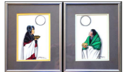
W/C's Signed Yellowman