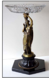
Sample of Bronzes