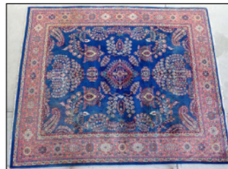
Room Size Carpets