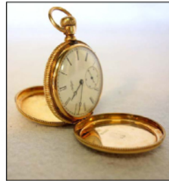
14K Gold Watch