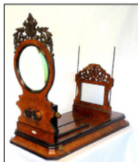
Ziegler Stereo Viewer