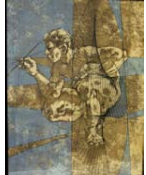
Hans Erni; 20thC. Swiss color lithograph. Figure of a Crouched Man. Pencil signed and inscribed(Inscribed to Emile Mathieu); 29.75in. X 22.5in.(1