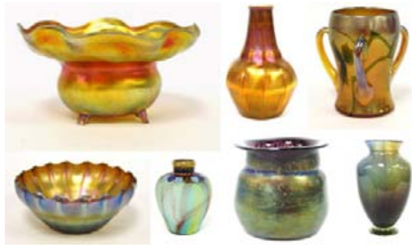
Selection of Estate Art Glass including: Tiffany, Loetz, etc.