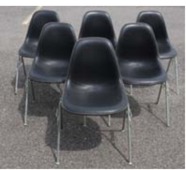
Set of Six(6) Herman Miller Eames Shell Chairs. Labels at the underside; 31.5in.H. x 18.5in.W.