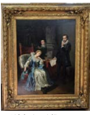
19thC. Continental; Oil on canvas (mounted on masonite), The Proposal. Signed I.r. indiscernibly: 43.25in. X 33.5in. in. X 32in. Very ornate frame measures: 44.25in. X 34.75in.(opening), 59.25in. X 49.75in.(frame overall)