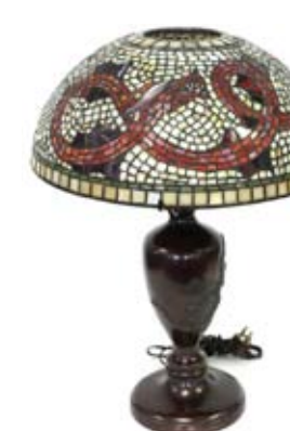
Rare Oscar Bach mosaic leaded glass table lamp. Bronze base with raised dragon decoration. Signed; 19.5in.H. x 14in.D. shade