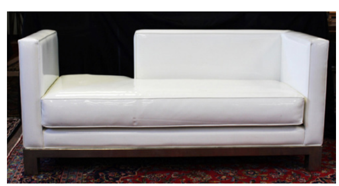
Milo Baughman Style Vinyl Upholstered and Chrome Settee;