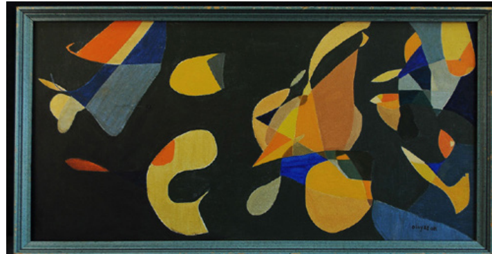
Pierre Olofsson; 20thC. Swedish Modernist oil on canvas, Abstract Composition. Signed I.r.; 12in. X 24in.