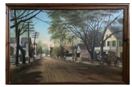
Veronica Nemethy; American oil on canvas, Main Street Cornwall, NY 1912. Signed I.I. and inscribed; 22.5in. X 35in.

Online Catalogues Available at: www.liveauctioneers.com