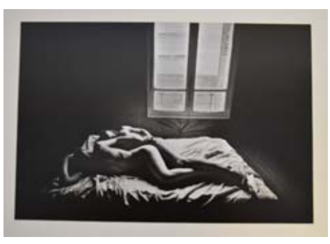
Leon Herschtritt: Boxed Set of Ten(10) Vintage Photographs. Le Couple. Cover piece signed and numbered 58/300.