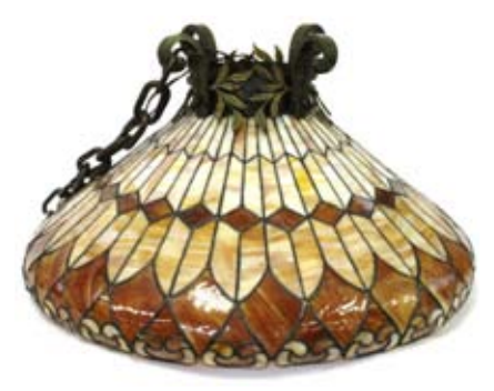
Duffner and Kimberly leaded glass hanging fixture. Tuck under border. Original hardware and chains; 13in.H. x