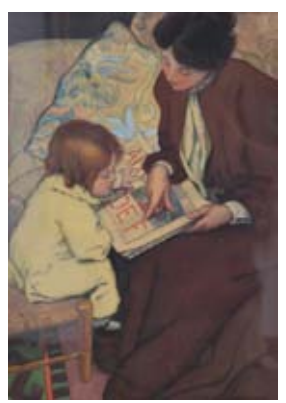
Byron C. Dreifoos: American Illustration mixed media on board. Learning the Alphabet. Signed and dated 1917 l.r.; 16.5in. X 11.5in.(image size)