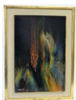
Leonardo Nierman; 20thC. Modernist epoxy and acrylic on masonite, Abstract Composition. Signed; 24in. X 16in. (1 of 2 works)