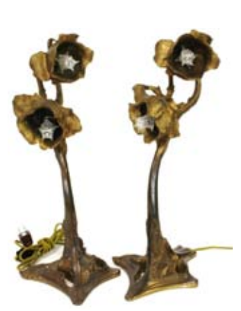
Raoul François Larche: Pair of Art Nouveau bronze double light lamps. Signed and impressed with foundry mark: 18.5in.H. x 9.5in.D.base