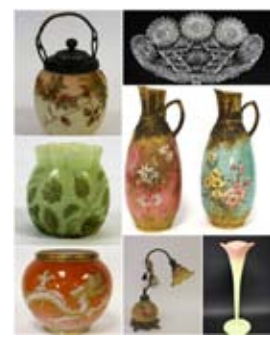
Collection of Fine Victorian Decorations and American Brilliant Cut Glass