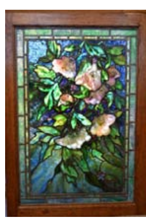
Steven Stelz: Magnificent 20thC. Leaded and Pate D'Verre Glass Window Signed; 38.5in. X 28.25in.(1 of 4 works)