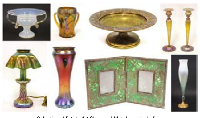
Selection of Estate Art Glass and Metalware including: Tiffany, Czech, etc.