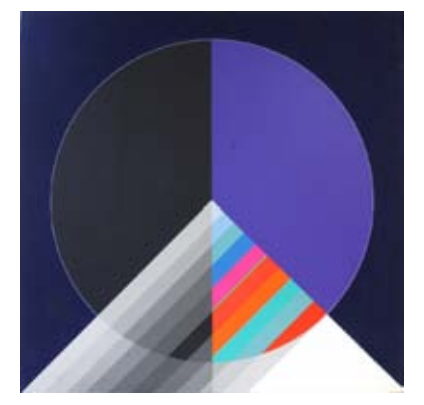
Eugenio Carmi; 20thC. Italian Modernist Oil Geometric Composition. Signed I.r. and dated 1972. Inscribed on reverse; 47.5in. x 47.5in.