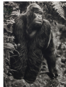
Nick Brandt (British, b. 1966), "Gorilla on Rock," Parc des Volcans, 2008, gelatin silver print, 37.5" x 27.75"