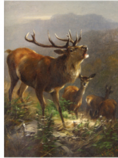
Arthur Fitzwilliam Tait (American, 1819-1905), Stag Calling with Does, oil on canvas, 12.5" x 9.5"