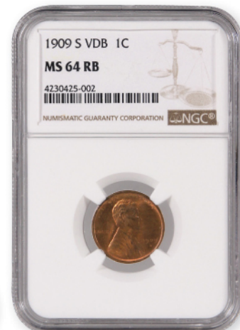
Large collection of U.S. coins comprising N.G.C. graded and gold examples including a 1909 S VDB 1C penny