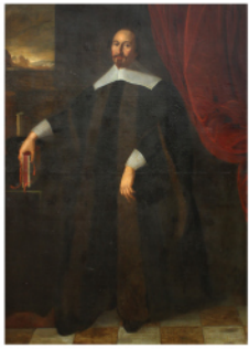
French School (17th century), Portrait of a Gentleman, oil on canvas (laid down on board), 75.5" h x 54"