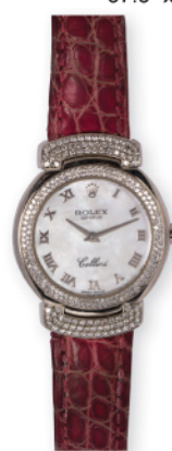
Lady Rolex Cellini diamond and 18k white gold wristwatch