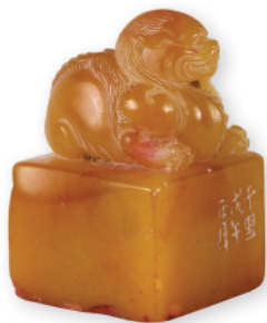
Chinese soapstone seal of Yu Youren (Chinese, 1879-1964), 1.5" h