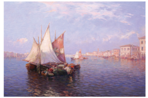
Colin Campbell Cooper (American, 1856-1937), View of Venice, oil on canvas, 20" x 30"