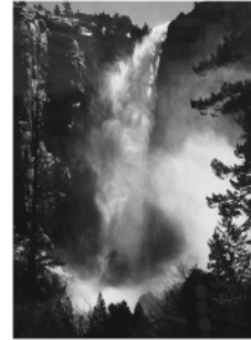
Ansel Adams (American, 1902-1984), Bridalveil Falls, Yosemite National Park, 1927, gelatin silver print, 9.25" x 7.25"