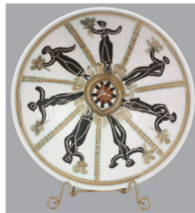
Pablo Picasso (Spanish, 1881-1973), Personnages, 1956, terre de faience bowl, partially glazed and painted red, brown, and black, 10.6" x 10.6"