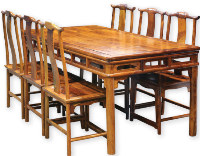
Selection of Chinese huanghuali furniture