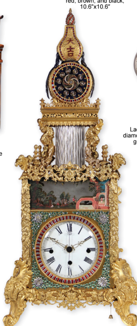
Rare and important jeweled Chinese automaton bracket clock, 36" h