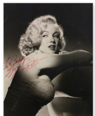
Single owner collection of rare Hollywood autographs, including Marilyn Monroe, James Dean, and Jean Harlow