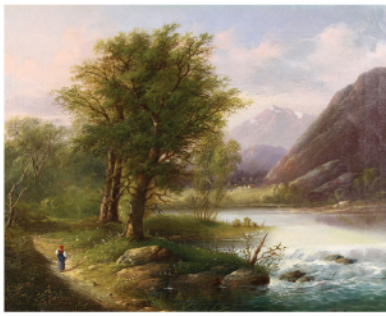
Michail Konstantinovich Klodt (Russian, 1823/33-1902), Lake Zirknitzer, Austria, 1872, oil on canvas, 16.75" x 20.75"