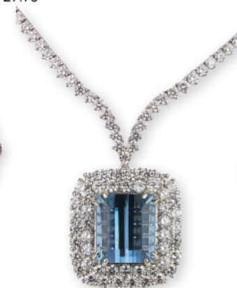
Aquamarine, diamond and white gold necklace, aquamarine weighs 16.10 cts., diamonds weigh 10.85 cts.