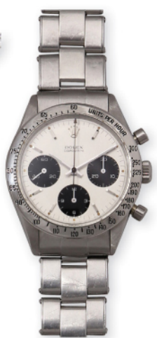
Rare and fine Rolex Cosmograph stainless steel wristwatch, ref. 6239, circa 1965, original papers