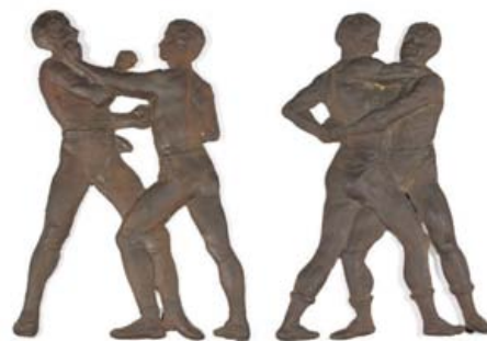
Pair of late 19th-century cast-iron boxer and wrestler figures, 24 1/4" overall height (each), from the Police Gazette building in New York City.