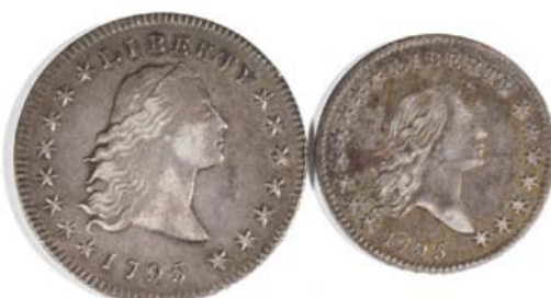
Rare 1795 Liberty Flowing Hair silver dollar and half dollar, from a fine estate collection of early American coinage/currency.