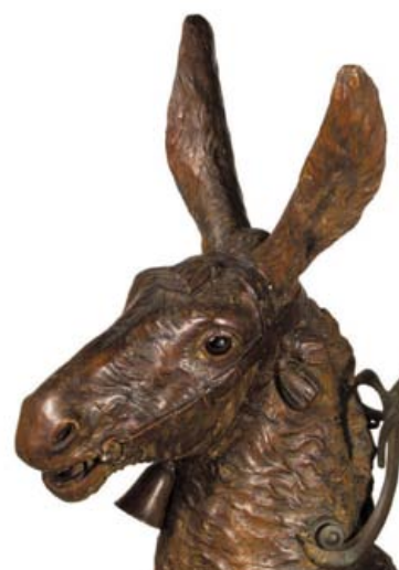
19th-century carved hollow-body carousel mule/donkey.