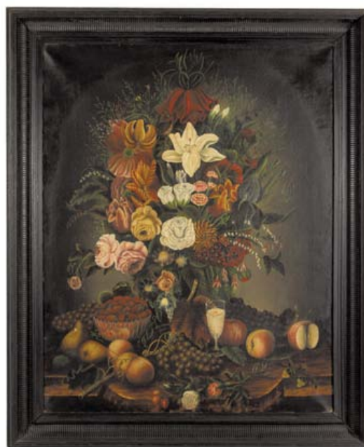
American School (19th century) folk art oil on canvas still-life painting, 37 3/4" x 29 3/4" sight size.