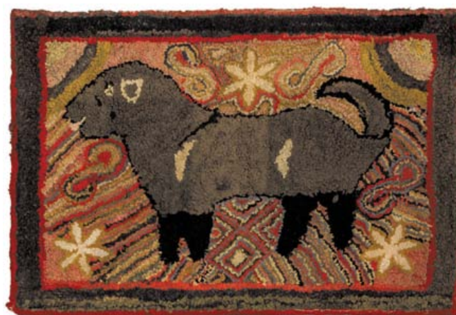
19th-century folk art figural hooked rug, 33" x 48", from a collection of hooked rugs.