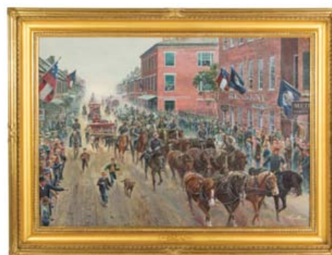
Original Mort Kunstler (American, b.1931) oil on canvas Civil War historical painting, titled "Iron Horses / Men of Steel / Winchester, VA / June 1864", 27 5/8" x 39 1/2" sight size.