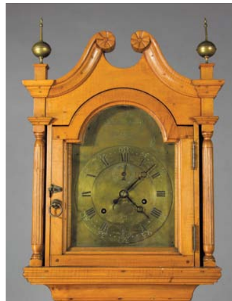
Ezekiel Reed (Bridgewater, MA, late 18th century) carved tiger maple tall-case clock.