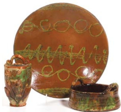
Fine 19th-century polychrome-decorated earthenware, including a Strasburg, VA figural wall pocket; a rare signed S. Bell & Son, Strasburg, VA butter tub with rope-twist handles, illustrated in Rice and Stoudt – The Shenandoah Pottery , fig. 146, p. 116; and an impressive slip-decorated charger, probably New York, possibly Long Island; each in outstanding original condition, from a good selection of folk pottery.