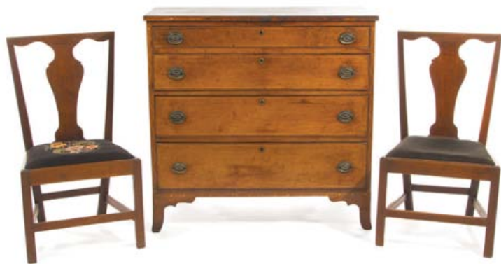
Kentucky Federal inlaid cherry chest of drawers (40 1/2" H, 41 1/2" W, 19 1/2" D), descended directly in the Adams and Duncan families, founding settlers of Hawesville, situated in Hancock County on the banks of the Ohio River, and a pair of 18th-century walnut side chairs, Virginia or Maryland, from a good selection of Southern furniture.