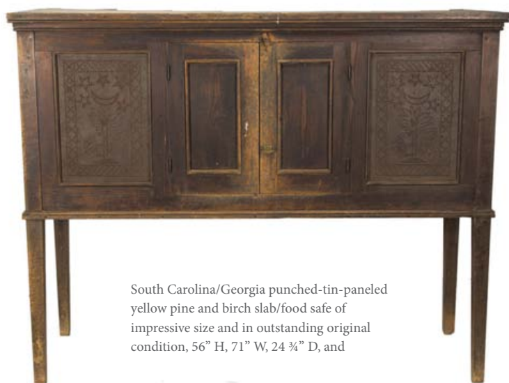
South Carolina/Georgia punched-tin-paneled yellow pine and birch slab/food safe of impressive size and in outstanding original condition, 56" H, 71" W, 24 3/4" D, and