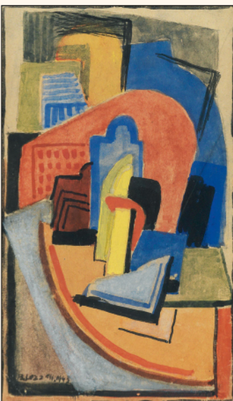
Blanche Lazzell, Abstract Composition , watercolor, 1943. Estimate $6,000 to $9,000.