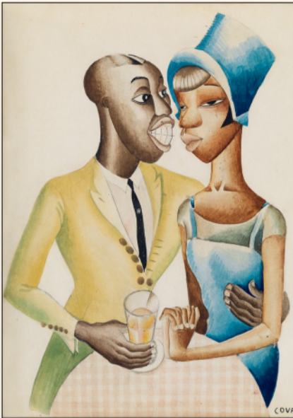
Miguel Covarrubias, At Leroy's , watercolor, pen and ink, circa 1924. Estimate $30,000 to $50,000.