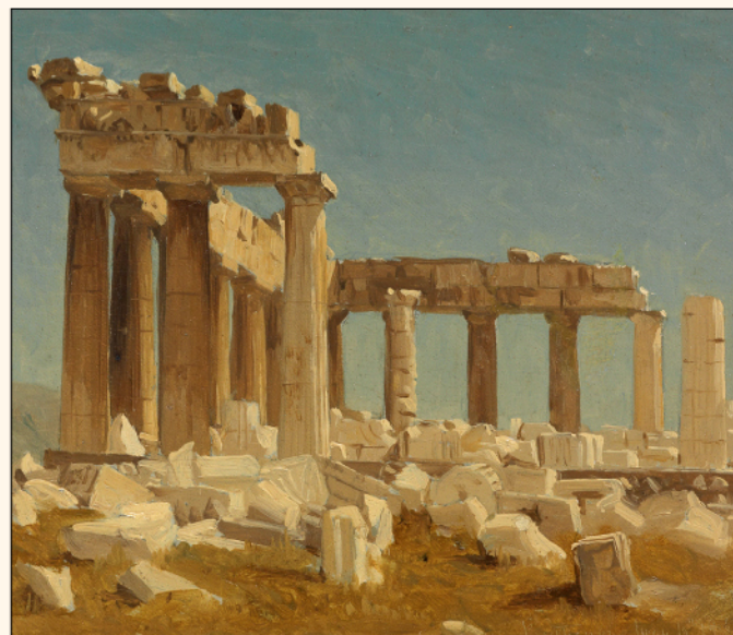
Sanford Robinson Gifford, Study of the Parthenon , oil on canvas, 1869. Estimate $20,000 to $30,000.