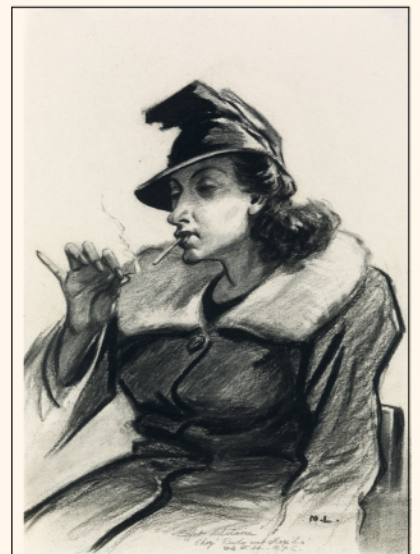
Martin Lewis, Effet Militaire , charcoal, 1938. Estimate $5,000 to $8,000.