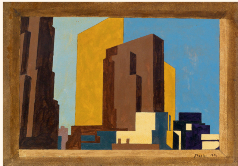
Charles Sheeler, New York #3 - Study , gouache, 1950. Estimate $100,000 to $150,000.