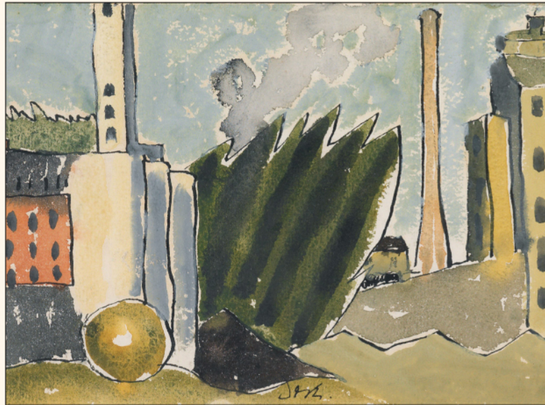
Arthur Dove, Patent Cereals Company, Geneva, New York , watercolor, circa 1938. Estimate $30,000 to $50,000.