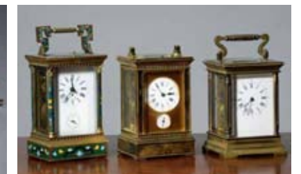
Three good 19th C. carriage clocks