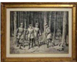
Choice w/c, by Frederic Remington with provenance