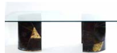
Signed designer steel table, Paul Evans