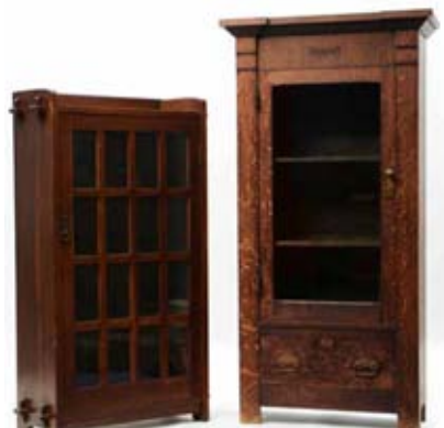
Mission bookcases by Roycroft and Stickley