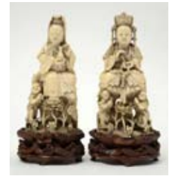
Fine 19th C. ivory carvings