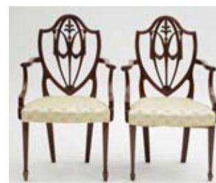
Fine pair of Charleston, SC Federal armchairs