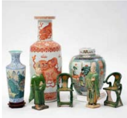
Chinese porcelains and ceramics