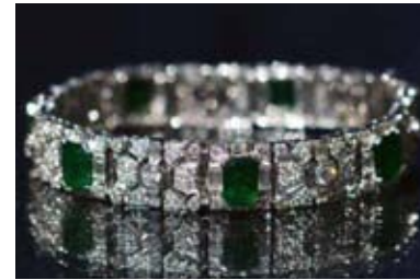
Emerald & diamond bracelet