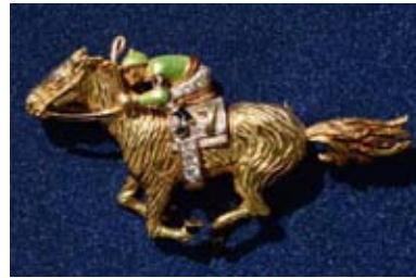
Fine Cartier pin