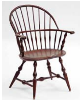
Great Windsor armchair in old red paint