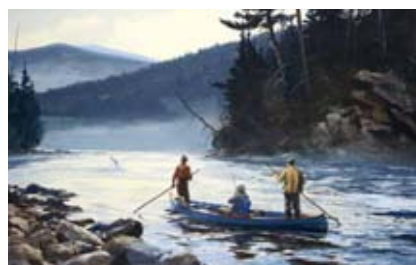
Fine watercolor, "The Evening Fishing" signed Ogden Pleissner