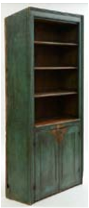
Good 18th C. green painted open top floor cupboard