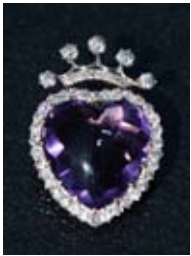
Amethyst & diamond