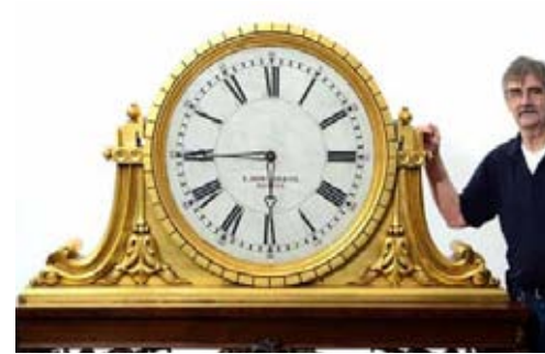
Great large E. Howard & Co. shelf clock with marble dial, prov. from Utah Bank, Baltimore M.D.