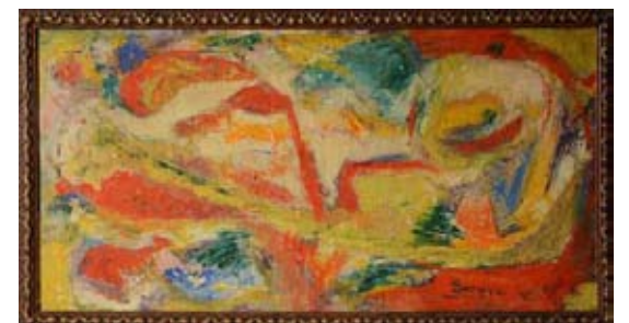
Oil, signed Souza 1951