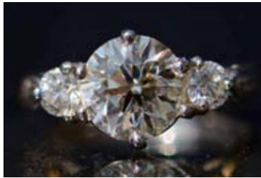
3.01 Ct center diamond