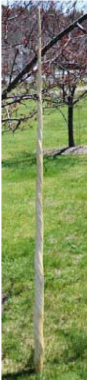
Early 92" Narwhal tusk