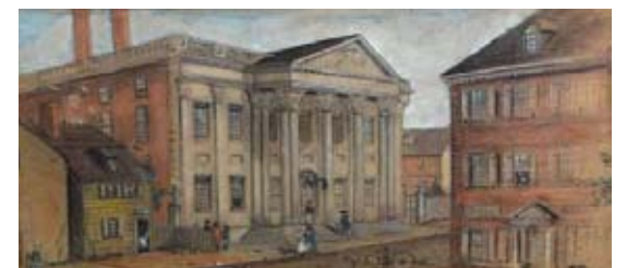
Early watercolor, Phila. Bank