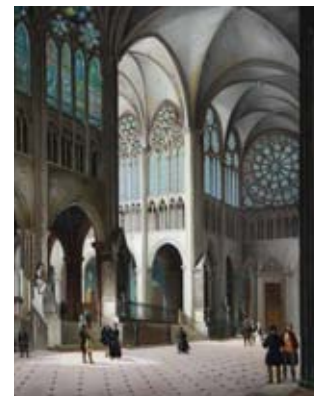
Oil on copper by Nicholas Chapuy