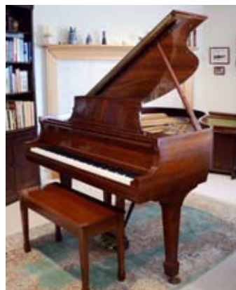
Steinway Model S baby grand piano