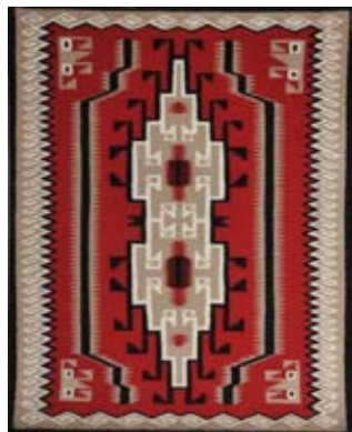
Collection of Yei rugs