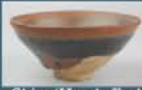
Chin. 'Hare's Fur' (Iron-Glazed) Tea Bowl, Song Dynasty