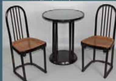
Josef Hoffmann Salon Suite of Bentwood Furniture, ca. 1905