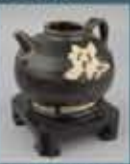
Chin. Jizhou Carved Brown Glazed Teapot, Song Dynasty