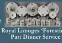
Royal Limoges 'Forestiere' Part Dinner Service