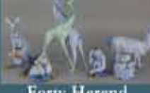
Forty Herend Animal Figures