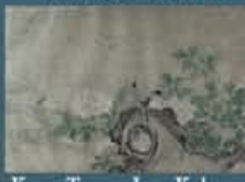
Kano Tanyu Jap. Kakemono (Painting) Blue Birds on Flowering Peony , signed and sealed