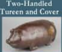
Anna Pottery Pig-Form Flask