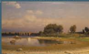
Joseph McGurl (Amer., 1958-) Landscape , 1997, signed, oil on board: 24 x 40 in.