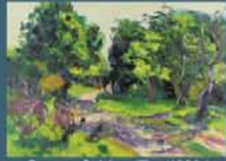
Gaston Sebire (Fr., 1920-) Le Chemin le Soir , signed Oil on canvas: 14 1/2 x 21 in.