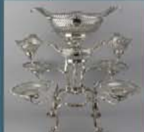
George III Silver Epergne by Thomas Pitts, London, 1773