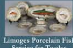
Limoges Porcelain Fish Service for Twelve