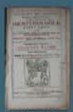
Willughby, Ornithologiae Libri Tres , 1st Ed.