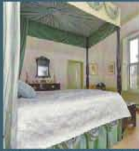
Charleston Period Rice Bed