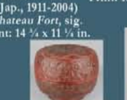
Chin. Red Lacquer Circular Box, Qianlong Mark and Period