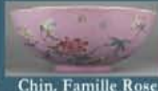
Chin. Famille Rose Bowl, Jiaqing Mark in Underglaze Blue