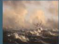
Brit. School (19th C.) Ship in Heavy Seas Oil on canvas: 23 x 29 in.