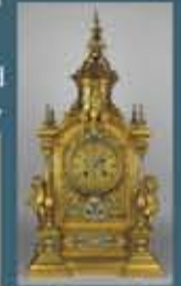
Fr. Champleve Mantel Clock