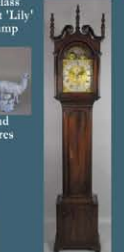
Chip. Walnut Tall Case Clock, Hilltown, Bucks Co., PA, Benjamin Morris, ca. 1780, Israel Sack Pro