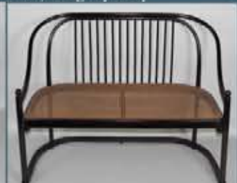
Assembled Set of Four Josef Hoffmann Bentwood 'Fledermaus' Side Chairs Model 728, ca. 1905