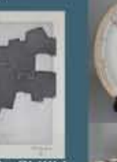
Eduardo Chillida (Span., 1924-2002) Gezna III , 1969, sig. Print: 10 1/4 x 8 in.