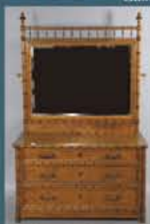
Amer. Aesthetic Movement Birdseye Maple and Faux Bamboo Mirrored Dresser