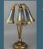
Tiffany Studios Gilt Bronze and Favrile Glass Three-Light 'Lily' Table Lamp