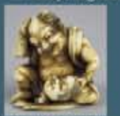
Ivory Netsuke of Oni Seated on a Fan