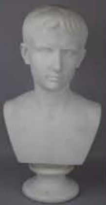
Ital. Marble Bust of Caesar Augustus, 19th C.