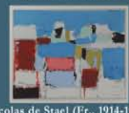
Nicolas de Stael (Fr., 1914-1955) Mediterranee , 1952, sig. Silkscreen: 18 1/2 x 22 in.