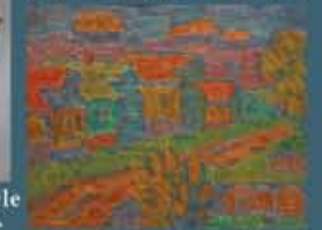
Yuri Ershov (Russ., 20th C.) Russian Village , sig. Oil on canvas: 19 x 24 in.