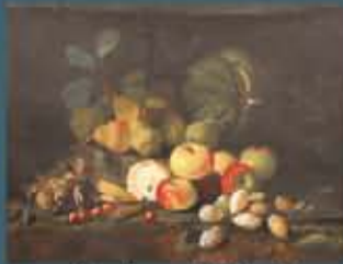
Continental School (18th/19th C.) Still Life of Autumn Fruit Oil on canvas: 28 x 34 in.