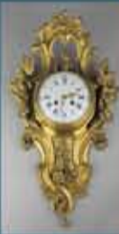
Louis XV Style Gilt Bronze Cartel Clock