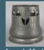
Joseph Maria Olbrich Designed Pewter Vase Holder