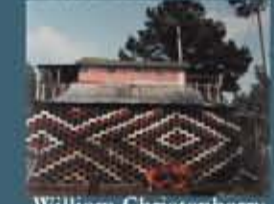
William Christenberry (Amer., 1936-) Rev. B.F. Perkins House , 1988 Print: 17 1/2 x 22 in.