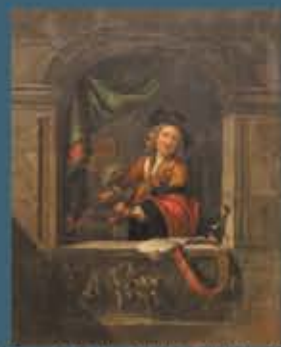
Dutch School (18th/19th C.) The Violin Player Oil on canvas: 18 x 14 1/4 in.