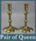
Pair of Queen Anne Brass Candlesticks, ca. 1740