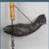
Mingei Bamboo and Cast Iron Jizai (Hook), Meiji Period