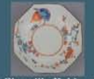
Chantilly Kakiemon Octagonal Dish