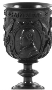
Carved Mulberry Wood Goblet with Bust of Shakespeare from Tree he Planted Estimate: $10,000-$15,000

SPECIALISTS IN EXCEPTIONAL BOOKS & PRIVATE LIBRARIES AT AUCTION BOOKS - MANUSCRIPTS - MAPS - PHOTOGRAPHS - WORKS ON PAPER