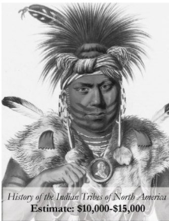
History of the Indian Tribes of North America Estimate: $10,000-$15,000

His ask of me & I was good once to his yfthmth parts of his earth for read him with a rod of iron & did him B. Bul 2. He is called the account of god to in his Personal laws instilled in Moses, and of god & to be a Bless for ever after by simply that he is the person spoken of in the Word of god with a two edged sword con- quity that he is the person spoken of in make of a quick understanding in his fear nor with righteousness, & who shall finally according to his words, will be good of all of his life shall stay his words, & the from beginning now yet to come in the a promise to the end of his life, & the sent to by whom god the father made all upon his promises to the Patriarchs. So these names of Christ, we are to have re- sent to be divine of vain Philosophy, they noble teach His way, & in Philoso- phy, & to be of the same, but to teach the Autograph Statement by Sir Isaac Newton Declaring his Religious Beliefs, to god Estimate: $80,000-$120,000 16. written at Hembury 12. 1. in may 1727