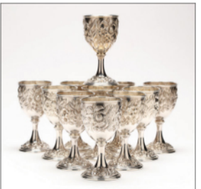
Set of (11) S. Kirk & Son "Repousse" Sterling Silver Goblets