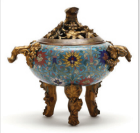
Chinese Covered Cloisonné Tripod Censer