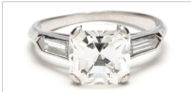
Vintage Platinum Diamond Ring, 2.21 carats (D color, VS1 clarity)