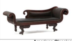
American Classical Carved Recamier, circa 1820