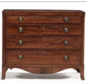
Virginia Federal Inlaid Chest of Drawers, circa 1800