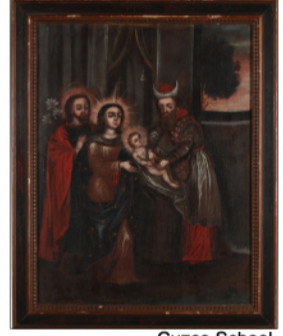
Cuzco School, The Circumcision