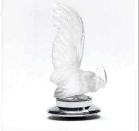
Rene Lalique "Coq Nain" Hood Ornament