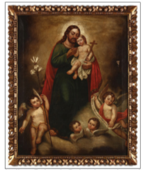
Italian School, Saint Joseph and the Christ Child