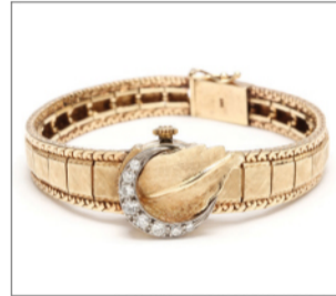
14KT Gold and Diamond Dress Watch, Omega