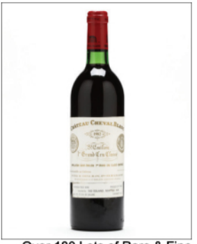
Over 180 Lots of Rare & Fine Wine, Thursday, June 16