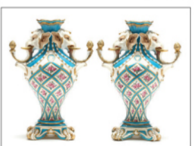
Pair of Mintons Vases à têtes d'éléphant