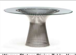
Warren Platner Dining Table, Knoll