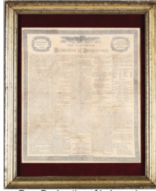
Rare Declaration of Independence Imprint on Linen, late 1830s