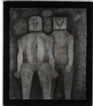
A Single-Owner Collection of (26) prints by Rufino Tamayo (Mexican, 1889-1991)