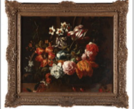
18th Century Dutch Still Life with Variegated Tulips, Daffodils, Forget-Me-Nots and Other Flowers