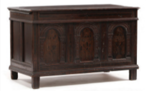
Rare Jacobean Inlaid Coffin, circa 1700