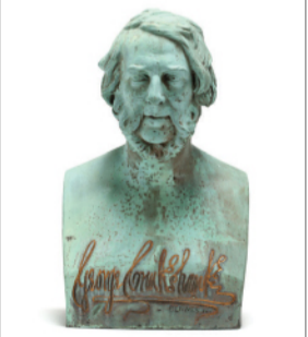
William Behnes (English, 1795-1864), Bust of George Cruikshank