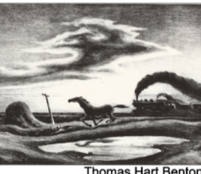
Thomas Hart Benton (Am., 1889-1975), The Race