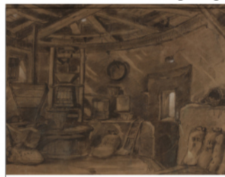
N. C. Wyeth (PA, 1882-1945), The Old Mill Interior