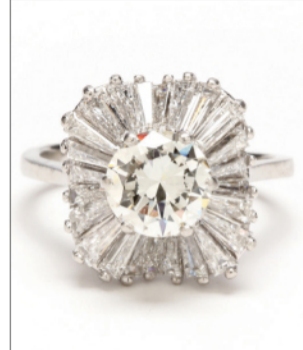
Platinum and Diamond Ballerina Ring, Kaspar & Esh