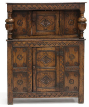
Jacobean Style Child's Court Cupboard, early 19th century or 18th century