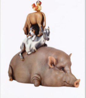
Jeff Koons (Am., b. 1955), Stacked