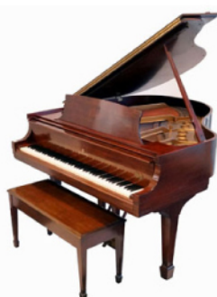
Steinway Baby Grand, S-Model #342231, 1953. 5'1"