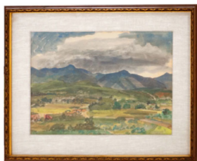
W/C, Morris Blackburn, Rural Pennsylvania. Sight 21x29 1/2"