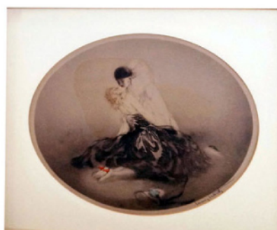
Etching/Aquatint, Louis Icart "L'Etrente" #151/350, 1926. 14 1/4 x 17 1/4"