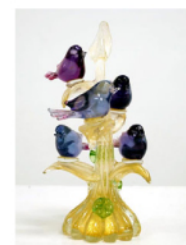
Murano Amethyst Glass Birds on Tree Branch