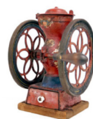
Vintage Enterprise Coffee Grinder. H.12 1/2"

TERMS: 15% Buyer's Premium to In-House Bidders; Cash & Approved Checks; Visa, MasterCard, Discover • Absentee & Phone Bids Accepted (BUYER'S PREMIUM IS 18%) – MUST be registered 4 pm, day prior to sale. • In association with LiveAuctioneers & Invaluable, William Jenack Auctioneers offers live on-line bidding. • On-line bidding buyer's premiums: LiveAuctioneers @ 21% – Invaluable @ 28%. • Prospective bidders must pre-register on LiveAuctioneers & Invaluable in order to participate.