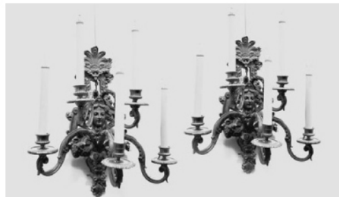
Pr. Renaissance Revival Gilt Bronze Sconces. H.22"