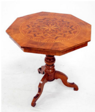
Cont'l Inlaid, 19thc. H.31"; D.32"