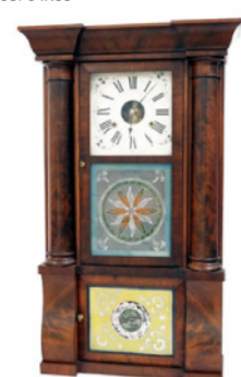
Birge & Fuller Mahogany. H.32 1/2"