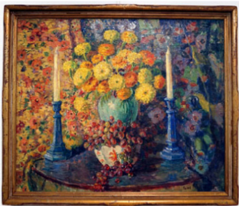
O/C, Ethel H. Warwick. 30x36"