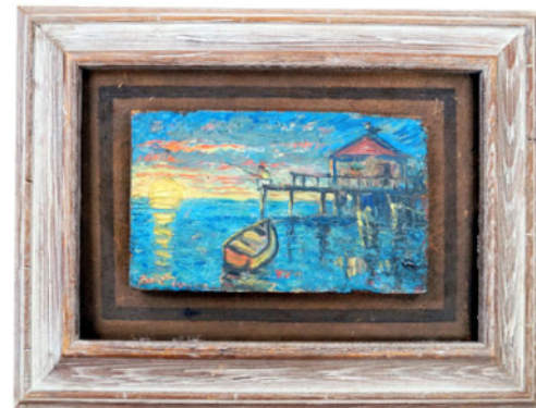
O/Wood Panel, David Burliuk. 6x9 1/2"