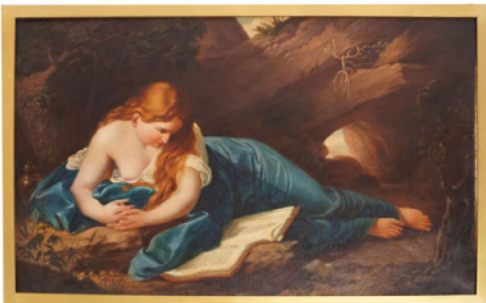
O/C, Continental School, 19 th c. 22x34"