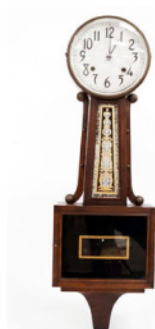
Vintage Ingraham Walnut. H.36"