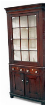
Pennsylvania Cherry Corner Cupbd. H.90"; W.43"