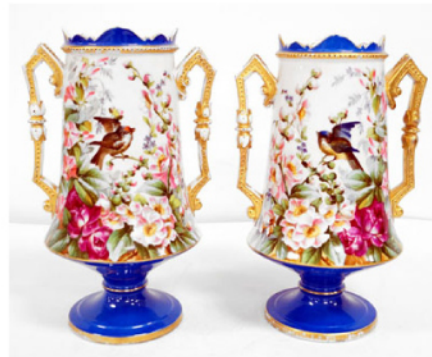
Pair Cont'l Hand Painted Porcelains. H.14 1/2"