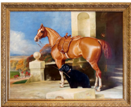
O/C, R.T. Bott, 1871. 34x44"