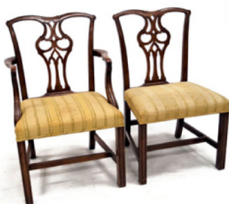
Set (8) Chippendale Style Walnut Chairs—2/arms; 6/sides