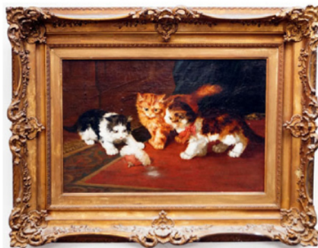
O/C, Alfred Arthur Brunel de Neuville, Unsigned. 16x25 1/2"