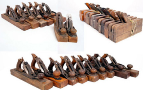
Estate Collection - 19thc Woodworking Tools (100+ sold in 35 lots)

www.jenack.com, www.Liveauctioneers.com, www.invaluable.com or www.auctionzip.com (ID#2455)