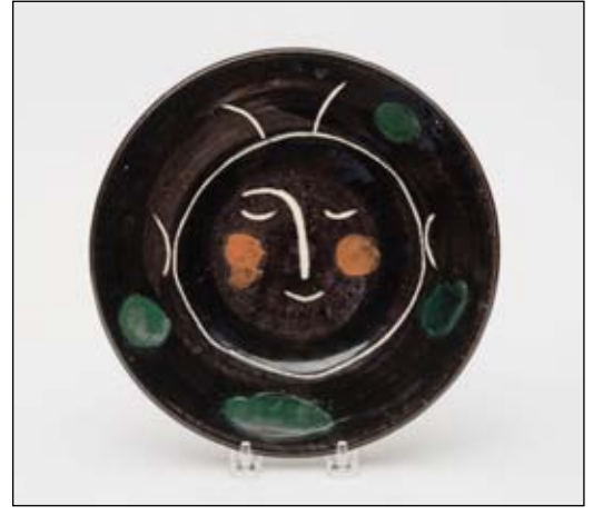
371 : PABLO PICASSO, Visage Noir, Assiette G , ceramic, diameter: 9<sup>1/2</sup> in., $1,500 - 2,500