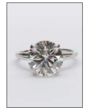
161 : Platinum and Diamond Ring, 3.7 cts., $15,000 - 25,000