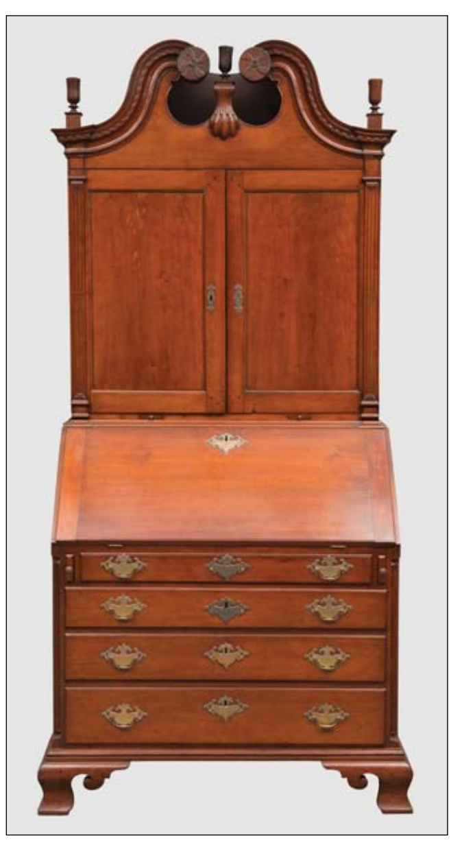
25 : RARE CHIPPENDALE CARVED CHERRYWOOD DESK AND BOOKCASE, attributed to Calvin Willey, probably Lenox, MA, ca. 1790, h: 90 in., $15,000 - 25,000

Thursday, June 2: 12 noon - 7 pm Friday, June 3: 12 noon - 7 pm Saturday, June 4: 10 am - 5 pm