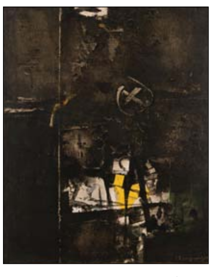
322 : Jannis Spyropoulos, Dipylon VI , oil, 25<sup>3/4</sup> x 21 in., $2,000 – 4,000