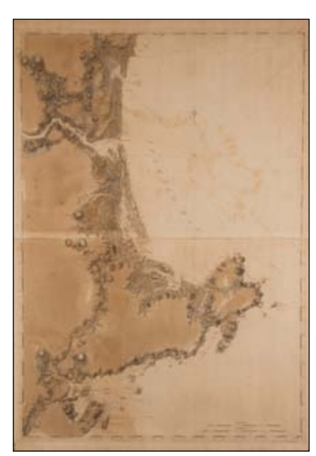
48 : JOSEPH F.W. DES BARRES, Cape Ann and Ipswich Bay, 1781, engraving, 42 \times 29^{1/2} in., $2,000 - 3,000