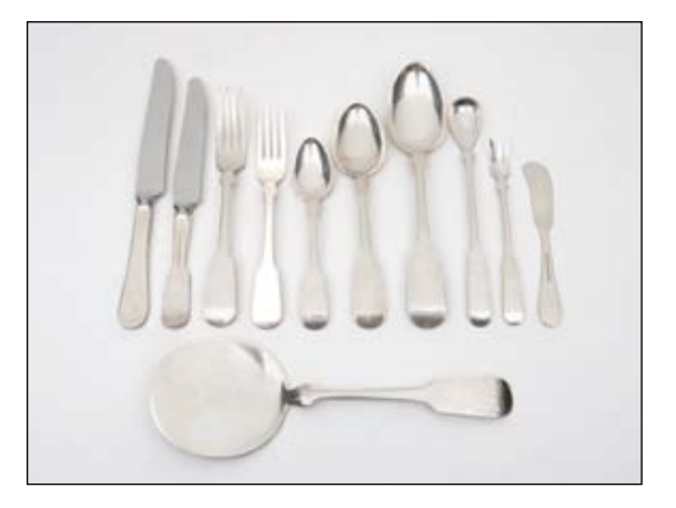
278 : AMERICAN SILVER FLATWARE SERVICE, Porter Blanchard, $2,000 - 3,000