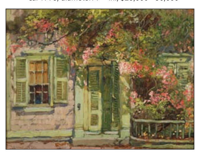
12 : Anthony Thieme, The Green Door , oil, 12 x 16 in., $2,000 - 4,000