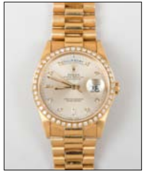
112 : ROLEX OYSTER PERPETUAL DAY-DATE, $6,000 - 8,000