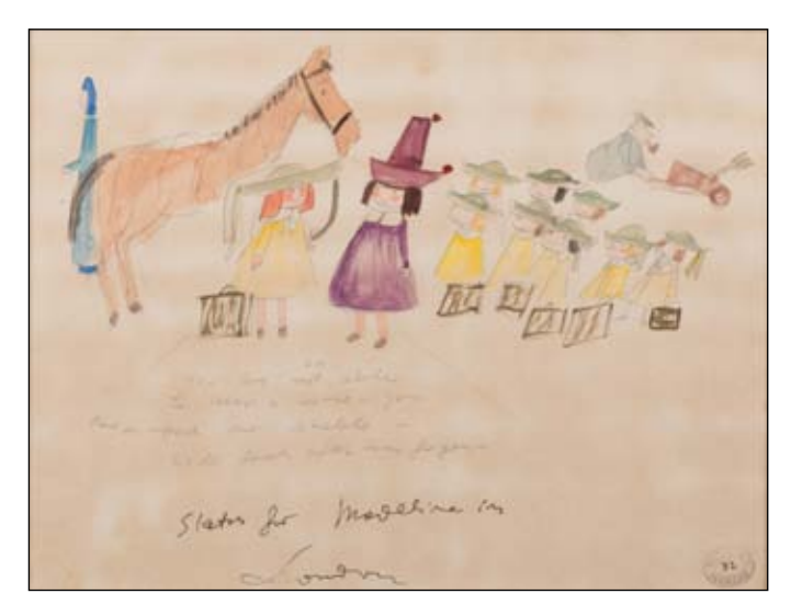
311 : LUDWIG BEMELMANS, Sketches for Madeline in London , wc, 14<sup>3/4</sup> x 19<sup>3/4</sup> in., $800 – 1,200