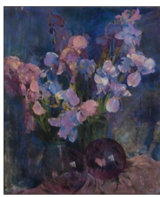
308 : Laura Coombs Hills, Purple Iris , pastel, 28 x 23 in., $3,000 - 5,000