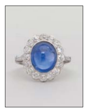
180 : Platinum, Ceylon Sapphire, and Diamond Ring, $5,000 - 10,000