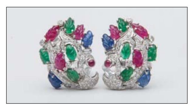
177 : DIAMOND AND GEMSET "TUTTI FRUTTI" EARRINGS, Cartier, France, $15,000 - 25,000