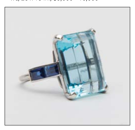
137 : Platinum, Aquamarine, and Sapphire Ring, Cartier, $2,000 - 3,000