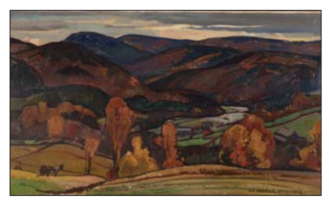
354 : WILLIAM LESTER STEVENS, Mountain Landscape , oil, 20 x 30 in., $4,000 - 6,000