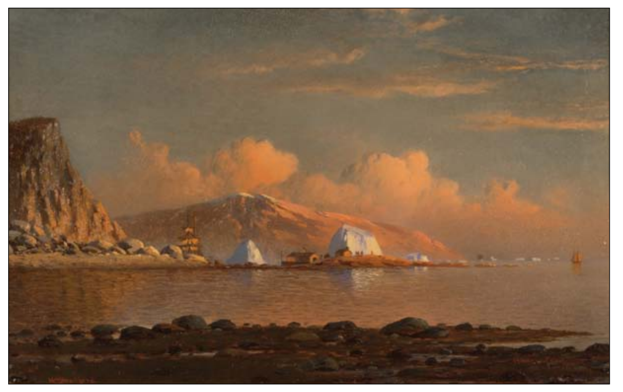
356 : WILLIAM BRADFORD, Arctic Sunset off Labrador, 1872, oil, 9 x 14 in., $40,000 - 60,000