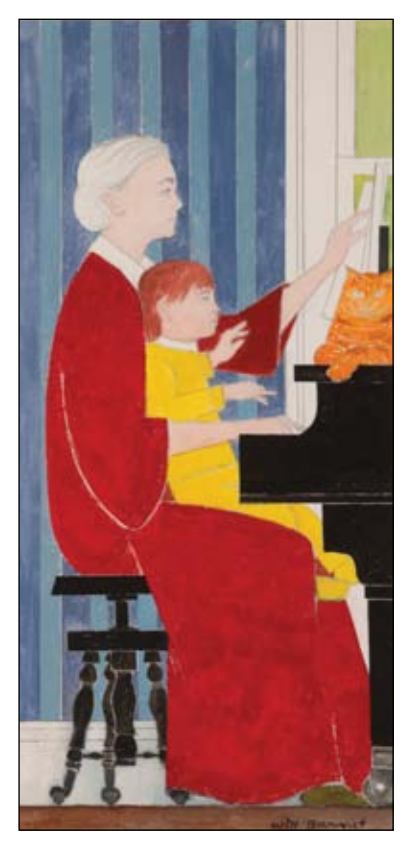
299 : WILL BARNET, The Lesson II , wc, 28 x 13 in., $5,000 - 10,000

Thursday, June 2: 12 noon - 7 pm Friday, June 3: 12 noon - 7 pm Saturday, June 4: 10 am - 5 pm