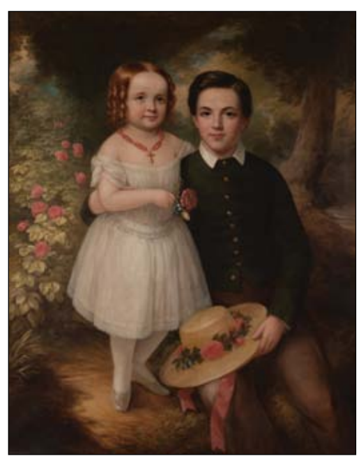
335 : Henry Cheevers Pratt, Portrait of a Boy and a Girl , oil, 46<sup>3/8</sup> x 36<sup>5/4</sup> in., $3,000 - 5,000

Thursday, June 2: 12 noon - 7 pm Friday, June 3: 12 noon - 7 pm Saturday, June 4: 10 am - 5 pm