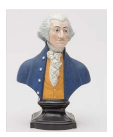
1: ENOCH WOOD BUST OF GEORGE WASHINGTON, England, 1818, h: 8<sup>1/2</sup> in., $1,000 - 1,500