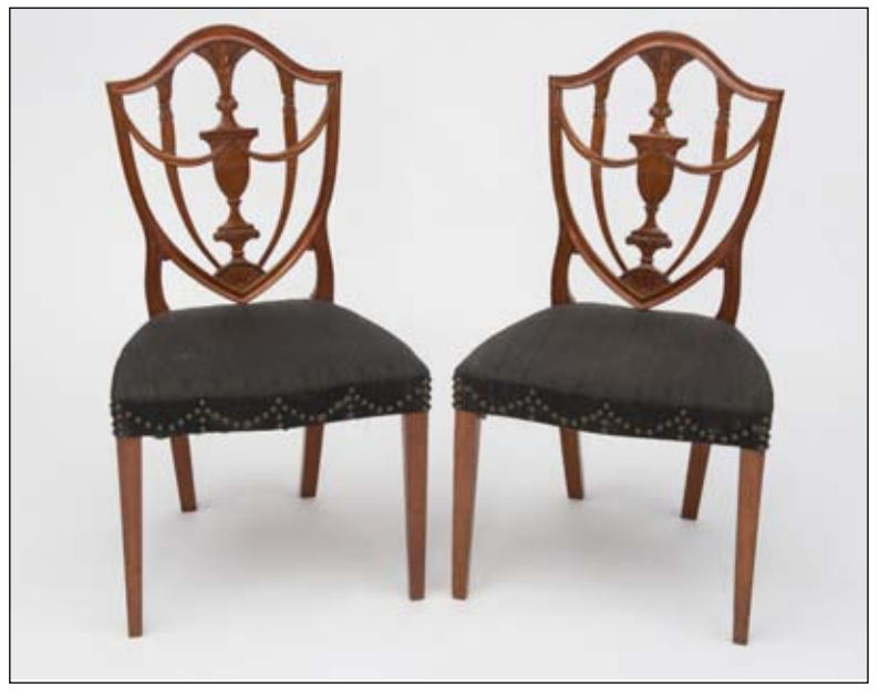
13 : RARE PAIR OF FEDERAL CARVED MAHOGANY SIDE CHAIRS, attributed to Samuel McIntire, Salem MA, ca. 1800, h: 38 in., $5,000 - 10,000