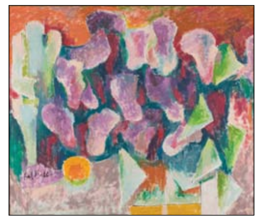
318 : Karl Knaths, Still Life , oil, 36 x 42 in., $20,000 - 30,000