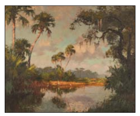
353 : Albert Backus, Florida Landscape , oil, 20 x 24 in., $8,000 - 12,000