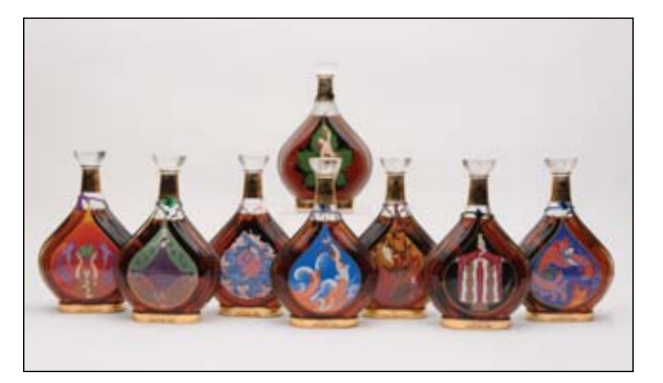
394 : COMPLETE EIGHT BOTTLE ERTE COLLECTION BY COURVOISIER, in ebonized display case, $3,000 - 5,000