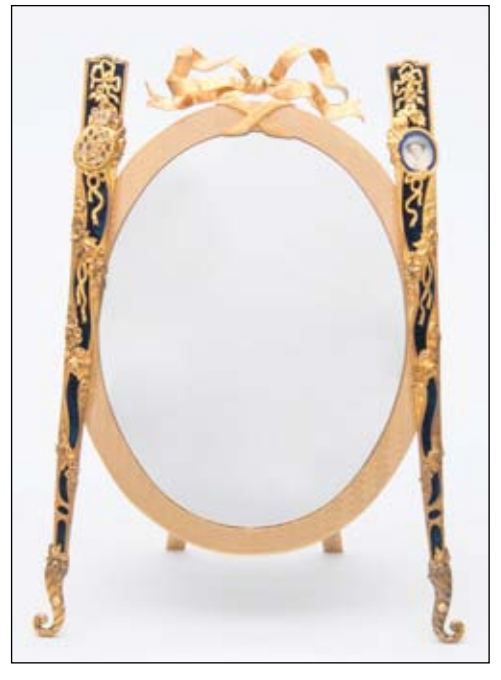
44 : Cartier Mounted Pair of Continental Gold, Diamond, and Velvet Fan Guard Sticks, $20,000 - 30,000

Thursday, June 2: 12 noon - 7 pm Friday, June 3: 12 noon - 7 pm Saturday, June 4: 10 am - 5 pm