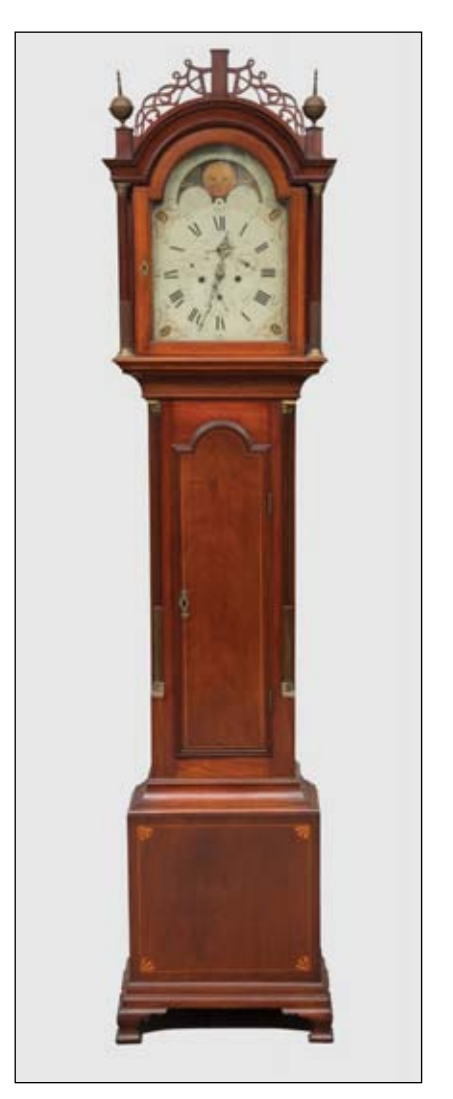
14 : The Thomas Jefferson Burt Federal Inlaid and Figured Mahogany Tall Case Clock, works by Joseph Gooding, Dighton, MA, ca. 1815, h: 88 in., $20,000 - 30,000