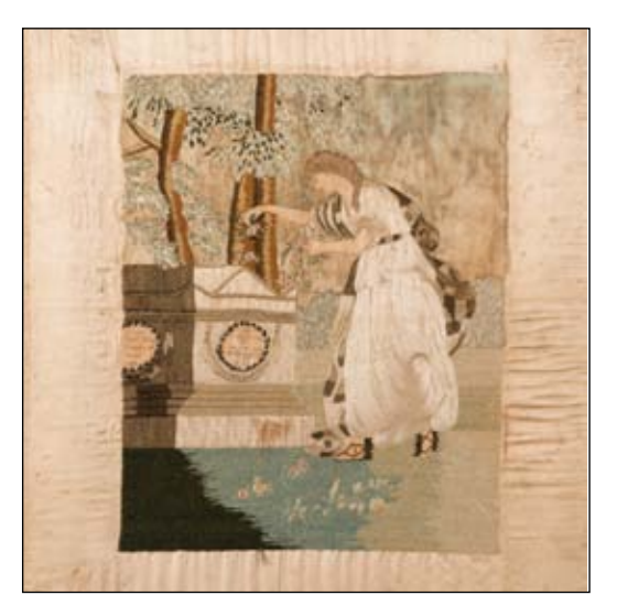
16 : Needlework Memorial, wrought by Miss E. Thoreau, 1803, $2,000 -3,000