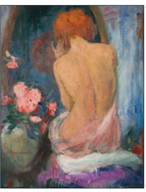
329 : Charles Webster Hawthorne, Seated Nude , oil, 20 x 16 in., $6,000 - 10,000