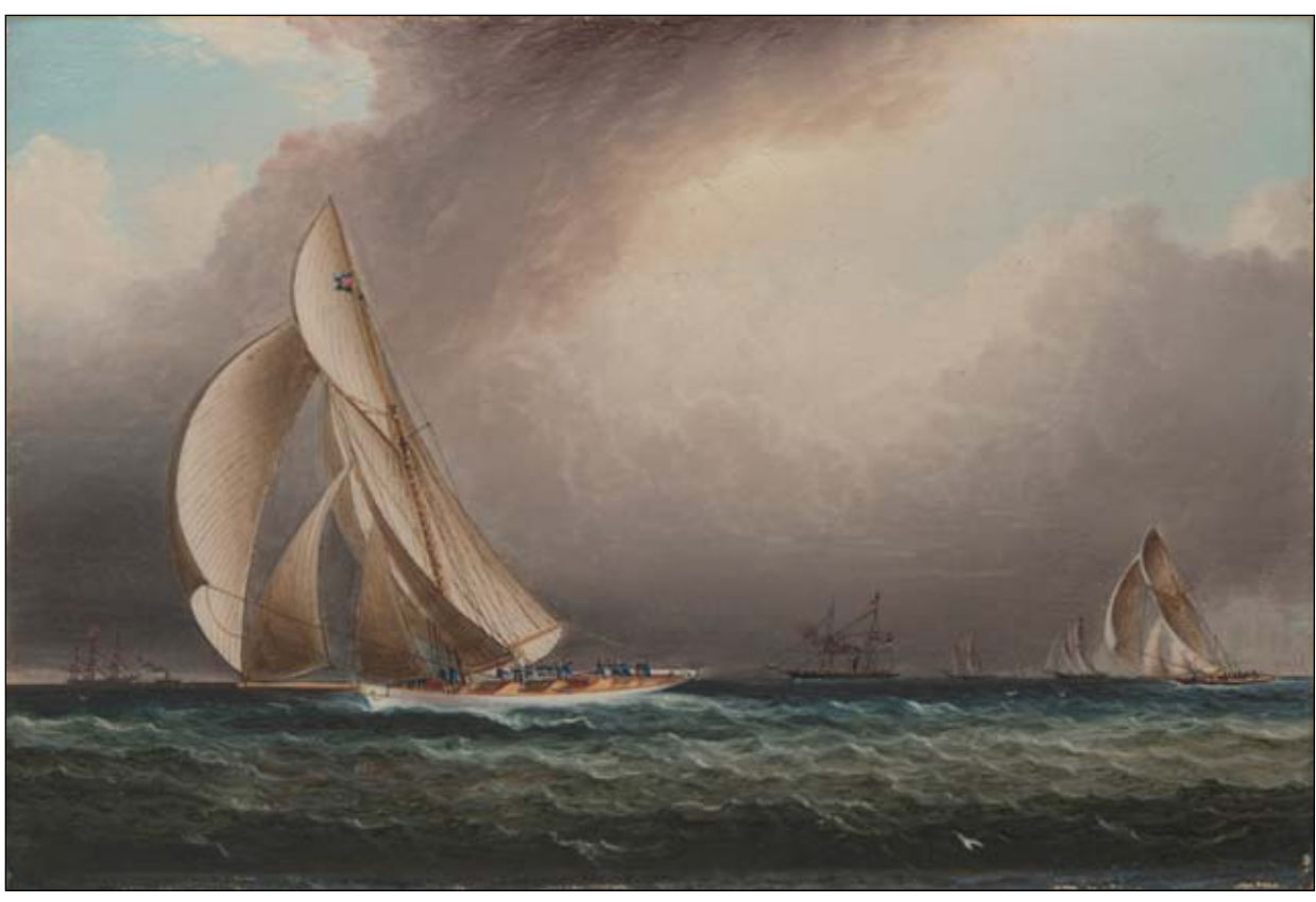
361 : James Edward Buttersworth, Volunteer & Thistle with All Sails Full, oil, 8 x 12 in., $20,000 - 40,000