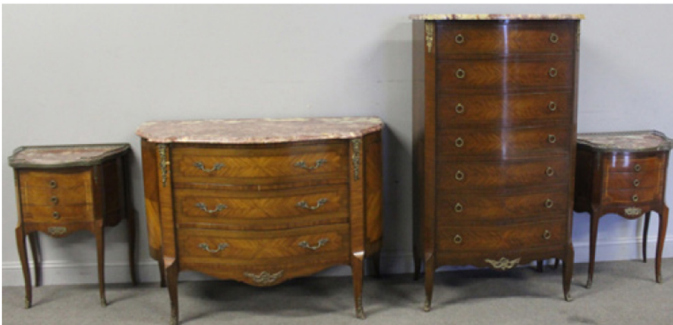
Satinwood marble top