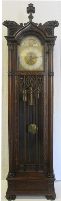
Tiffany & Co