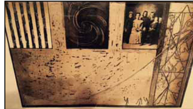
Jasper Johns #2

Jasper Johns Untitled 1999 Intaglio on paper 29 1/2 x 17 3/4 inches; 75 x 45 cm Edition 27/45 Signed, dated and numbered in graphite (verso): 27/46, J. Johns '99. JOHJ.PR.20186