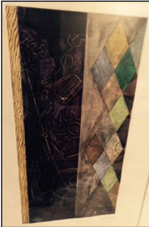
Jasper Johns #1

http://www.auctionzip.com/NJ-Auctioneers/1127.html (# 2037)