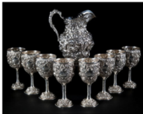
Stieff "Rose" repousse sterling pitcher and set of 8 goblets