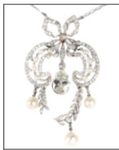
Platinum, diamond and pearl necklace; pear-shaped center diamond, approx 2 cts, 16 in L, 13 grams tw