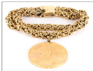
18K yellow gold double Byzantine link bracelet and Mexican 50 Pesos 1821-1930 gold coin charm with heavy box clasp and safety chain, 8 in L, 138 grams