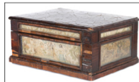
William & Mary oyster and stump work sewing box, circa 1690,

VISIT OUR WEBSITE FOR TERMS AND ADDITIONAL DETAILS.