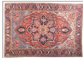
Antique Persia Heriz, circa 1925, 8.2 x 11.3