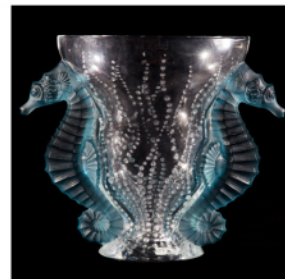
Lalique crystal Poseidon vase