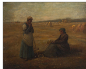
Manner of J.F. Millet (French, 1814-1875), "Peasant Women in Field," oil on canvas, signed