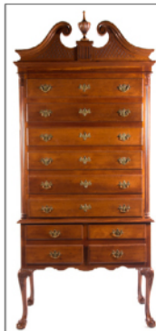
Federal cherry wood highboy, Frederick County, VA, label on back states: "Belongs to Constance" (daughter of Robert E. Lee)