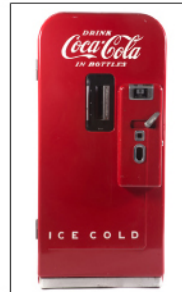
Vendo 39 Coca-Cola machine, 1949-54, Model F3BK5, 58 in H