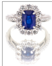
3.27 ct Kashmir sapphire and diamond ring with AGL report