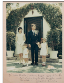
Photograph of Pres John Kennedy and family inscribed and signed by Jacqueline Kennedy, 14x7 in, framed