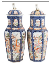
Pair of Chinese export Mandarin palette panel jars, circa 1775