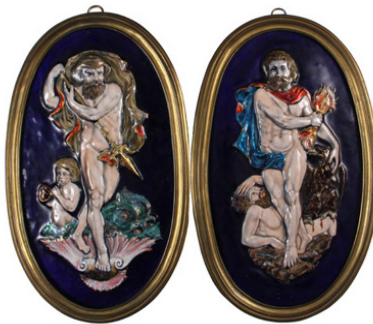
Lot 381 - 19th c. Oval Enameled Repoussed Copper 15 1/2" x 9 3/4". est. $1200 - $1500