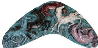
Lot 860 - Italian Art Pottery Table/Wall hanging, "Cinque Cavalli" by Otello Rosa (Italy, 1920-?), for San Paolo, circa 1955, 17 1/2" x 64" x 30" est. $1000 - $1500