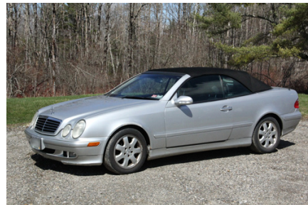
Lot 804 - 2003 Mercedes Benz CLK320A 2-dr Cabriolet, vin # WDBLK65G23T131822, 105,467 miles. est. $6000 - $8000