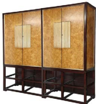
Lot 851 - Custom Design Cabinet/Shelving Unit, from the Therien Studio, Los Angeles, CA. 90" tall, 48" wide, 26" deep. est. $2000 - $4000