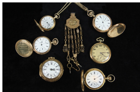
Pocket Watches, including 1749 English watch with Chatelaine, Waltham, & Vacheron & Constantin