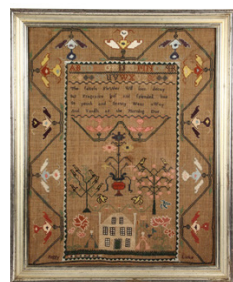
Lot 35 - Circa 1790 Silk on Linen Alphabet and Poetry Sampler by Margaret Locke of Arlington, Mass. 1 of 5 being offered. est. $3,000 - $4,000