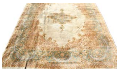
Lot 56 - 11'9" x 14'9" Kerman Carpet, Southeast Persia, mid 20th c., 1 of 35 carpets being offered. est. $2000 - $3000