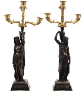
Lot 871 - Pr. French Egyptian Revival Figural Three-Stem Candelabrum, 21 1/2" tall. est. $2000 - $3000