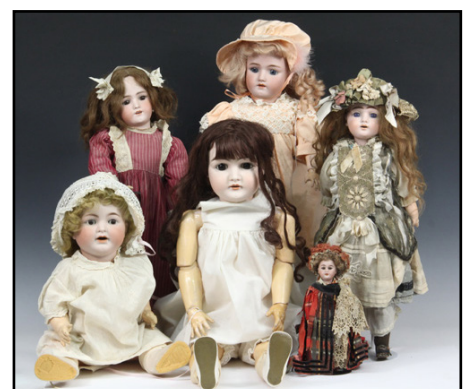
Six of the 17 Bisque Dolls being offered

Thomaston Place Auction Galleries, Inc. U.S. Route 1, P.O. Box 300, Thomaston, Maine 04861 Phone (207) 354-8141 • Fax (207) 354-9523