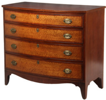
Lot 355 - Hepplewhite Period, Portsmouth NH, Mahogany Chest of Drawers, 37" x 42" x 22" est. $1,000 - $1,500