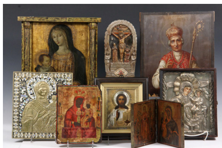
Selection of 17th - 20th c. Russian, Greek and Italian Icons