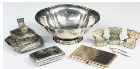
19th c. Russian Silver Pieces plus Art Deco Cigarette Case

Thomaston Place Auction Galleries, Inc. U.S. Route 1, P.O. Box 300, Thomaston, Maine 04861 Phone (207) 354-8141 Fax (207) 354-9523 www.thomastonauction.com