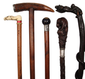
Lot 952 - Five Fine 19th c. Walking Sticks. est. $800 - $1200