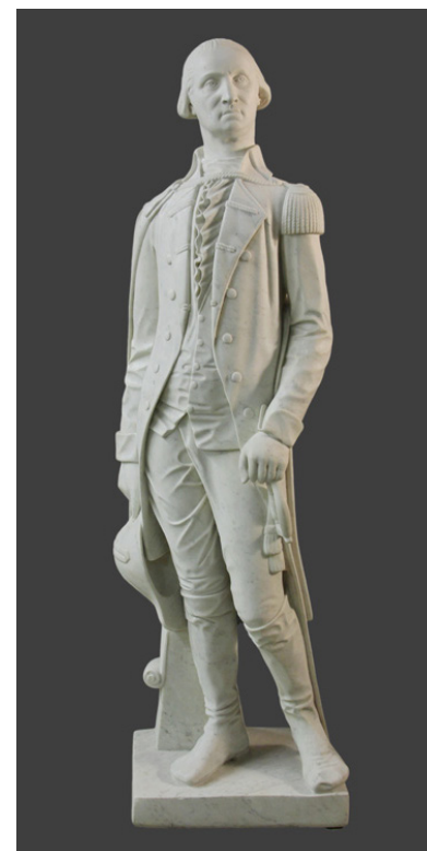
Lot 75 - 19th c. Carrara Marble 3/4 Scale Standing Figure of Washington in Continental Army Uniform. est. $10,000 - $15,000