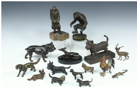
A portion of the bronze sculpture being offered, 18 lots in all