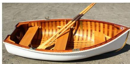
Lot 808 - 7 1/2' Canvas Covered Mahogany and Cedar Yacht Tender by the Old Town Canoe Company. est. $2,500 - $3,500