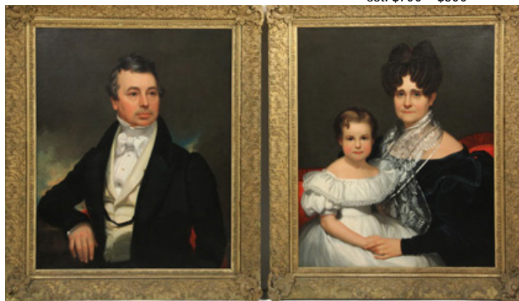
Lots 52 & 53 - Cray Family Portraits by William Sidney Mount (NY, 1807-1868, Est. $6,000 - $8,000 each