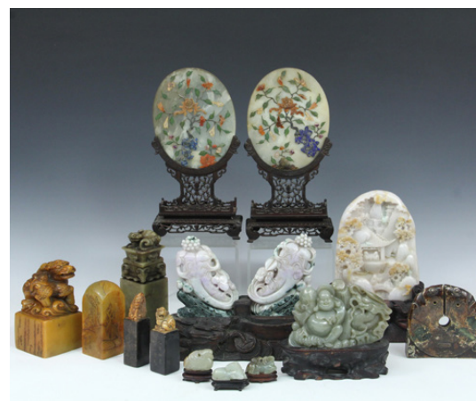
Fine Selection of Chinese Jade Carvings, 16 lots being offered