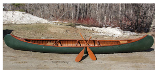
Lot 813 - 17' Old Town Canoe, s/n 154974, AA (or top) grade, Otca model, built between December 1950 and April 1951. est. $1,200 - $1,600