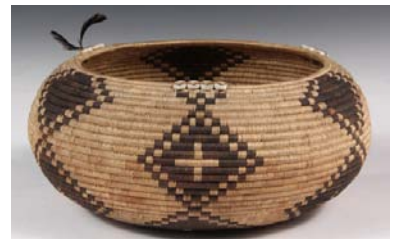
Lot 1108 - Large Yokuts 'Friendship' Coiled Basketry Bowl, central California, circa 1900, 6" x 11 1/2" diam. est. $1000 - $2000