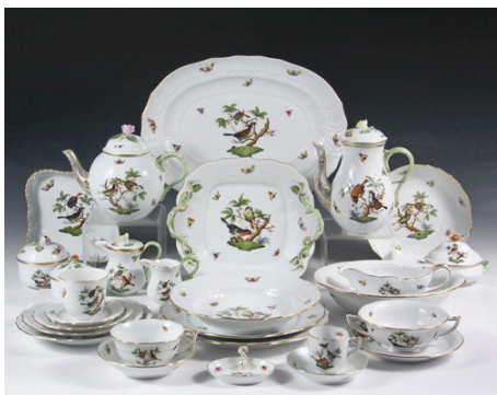
Lot 771 - (256) Piece Set of Herend Porcelain in the Rothschild Bird Pattern. est. $3000 - $5000