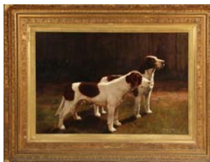
Lot 144 - HARRY CAREY (19th/20th c. American) - "The Promising Youngsters", oil on canvas, signed and dated 1880, 25" x 36" est. $3000 - $4000