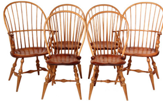
Lot 891 - Set of 6 Windsor Chairs, from the D.R. Dimes Co. of Northwood, NH. est. $2,000 - $3,000