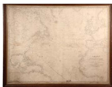
Lot 107 - E. & G.W. Blunt New York Nautical Chart, North Atlantic Ocean, 1844, updated to 1851, 37 1/2" x 49" est. $1,000 - $1,500