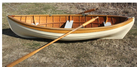
Lot 807 - 10 Foot Peapod Rowing Boat built by the Apprenticeship, Rockland, Maine. est. $4,000 - $6,000