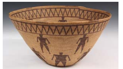
Lot 1109 - Pomo Indian Coil Built Bowl, north central California, circa 1900, 3 1/4" x 7 3/4" diam. est. $800 - $1200