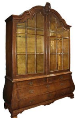
Lot 270 - Provincial Walnut Glass Front Hutch, Louis XV period, 91 1/2" tall, 68 1/2" x 25" est. $2000 - $3000