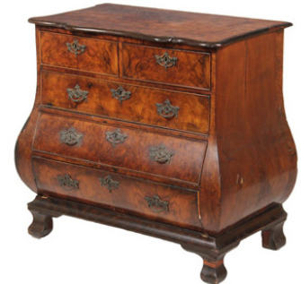
Lot 190 - Diminutive 19th c. Dutch Bombe Chest, in figured exotic fruitwood veneer, 32" x 34" x 19 1/2" est. $1000 - $2000