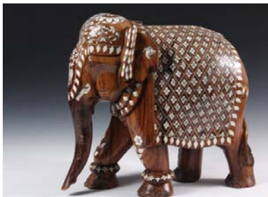
Lot 531 - Anglo-Indian Solid Teakwood Elephant with extensive floral inlay of Mughal "Parchin Kari", 15 3/4" x 16 1/2" x 7 1/4" est. $1000 - $1500