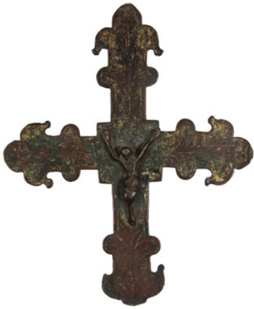
Lot 224 - Medieval French Processional Bronze Cross, with engraved decoration and applied Corpus Christ, 6 1/2" x 5 1/2" est. $1000 - $1500