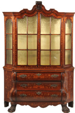
Lot 200 - Two-part marquetry Dutch display cabinet with bookcase top over 3-drawer base, 81" x 55" x 17 1/2" est. $2500 - $3500