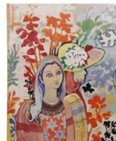
Lot 856 - JOE BRAINARD (NY/VT/AR, 1942-1994) - Portraits of Two Women, gouache on paper, signed & dated '63, 24" x 19 1/2" est. $3000 - $4000