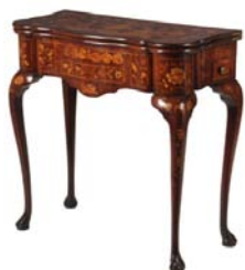
Lot 195 - 18th c. Dutch Gaming Table with ornate overall floral marquetry, 29 1/2" x 29" x 14" est. $2500 - $3500