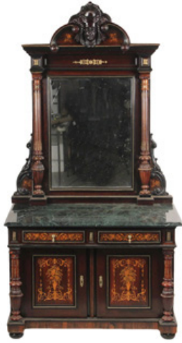
Lot 845 - French Belle Epoch Marble Top Dresser with Mirror, 53 3/4" tall overall, 43" x 25 1/4" est. $1000 - $1500