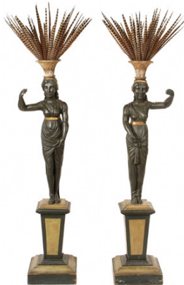
Lot 159 - 19th c Greek Revival Figural Entry Torchieres, 57 1/2" tall. est. $3000 - $4000