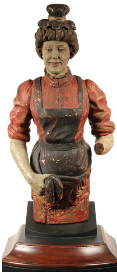
Lot 95 - Circa 1850 English Trade Figurehead in carved and polychromed pine, 41" tall. est. $10,000 - $15,000