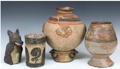
Pre-Columbian Pottery, including Myan and Chancaay Cultures