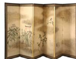
Lot 1129 - Late 19th / 20th c. Japanese Six-Panel Painted Screen, each panel is 66" x 23" est. $1500 - $2500