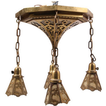
Lot 731 - Circa 1920 Gilt Brass and Caramel Slag Glass Chandelier, 18" ceiling plate, 9 1/3" deep, drops about 20" long. est. $1500 - $1800