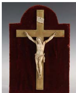
Lot 222 - 18th c. French Ivory Carving of Corpus Christi on a gilt cross 8" x 4 1/2" est. $800 - $1200