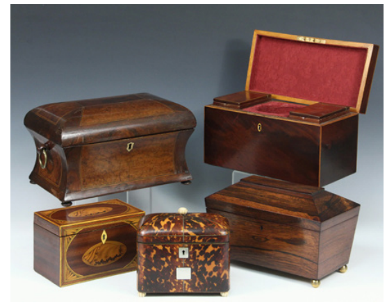
19th c. English Tea Caddies in Tortoise Shell, Mahogany & Rosewood