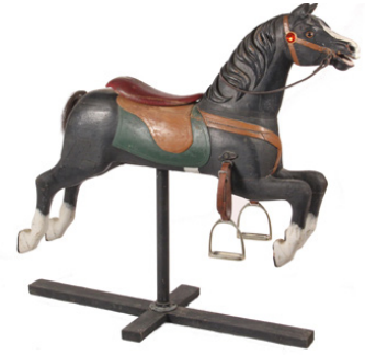
Lot 10 - 19th c. Carved and Painted Carousel Horse, attr. to C.W. Parker. est. $3,000 - $4,000