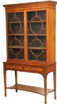
Lot 150 - 19th c. English Two-Part Satinwood Adams Style Bookcase, 78" x 41 1/2" x 18" est. $2500 - $3500