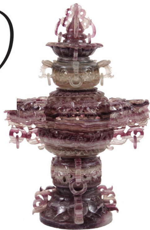
Lot 480 - Magnificent Chinese Three-Part Highly Carved and Reticulated Amethyst Incense Burner, 18" x 12" x 7 1/2" est. $3000 - $5000