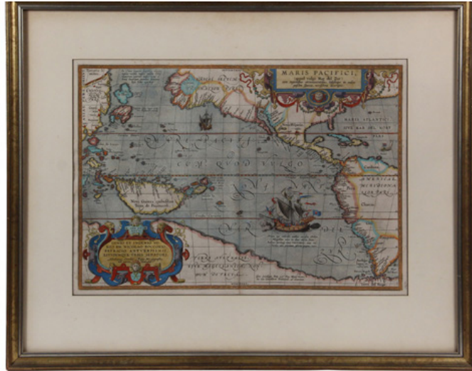
Lot 201 - First Map of the Pacific by ABRAHAM ORTELIUS (Flemish, 1527-1598). Full sheet size is 17 1/4" x 21 1/4" 1 of 10 rare maps being offered. est. $6000 - $8000