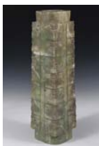
Lot 489 - Chinese Jade Cong Burial Fetish, Neolithic style, in the manner of the Liangzhi culture, 3000-2000 BC, 16" tall est. $2000 - $3000