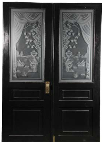
Lot 755 - Paneled Wooden Doors in Black Enamel Paint with Etched Glass Windows, 82" x 29 1/2" est. $1,000 - $2,000