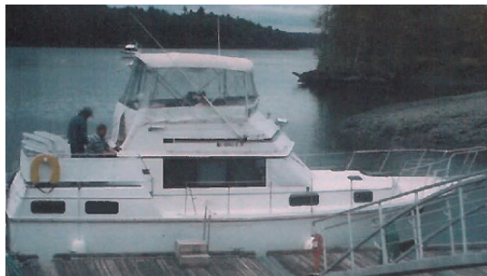
Lot 805 - Carver 36 "Irene Zoe" 1984 Fiberglass Twin-Screw Trawler Cruiser, hull # CDRT0046L485, 31'4" LWL. est. $20,000 - $30,000