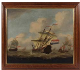
Lot 182 - Early 18th c. Oil Painting depicting a Dutch Sea Battle with the British, 23 1/2" x 28 1/2" est. $2000 - $3000