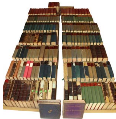
Lot 1277 - Punch Magazine Collection, complete from inception through 1970, in various bindings. est. $2000 - $3000