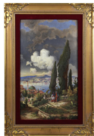
Lot 743 - Circa 1880 "Turkischer Garten am Bosphorus" hand painted porcelain, KPM plaque, 18 3/4" x 11 1/4" est. $1000 - $1500