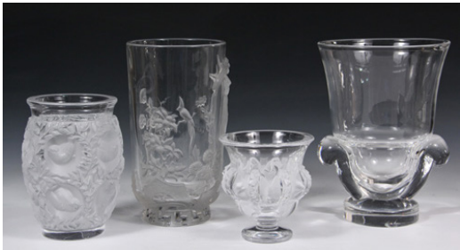
Lot 914 - Group of (4) French and American Art Glass Vases, by Lalique, Verly & Steuben. est. $500 - $700