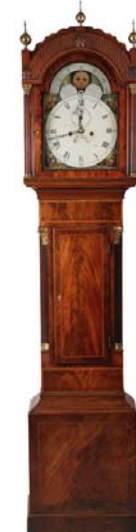
Lot 180 - 19th c. English Mahogany Tall Clock cased with arched bonnet 86" x 19" x 9" Good condition, one small edge crack to glass, french polished, minor veneer loss. est. $2000 - $3000