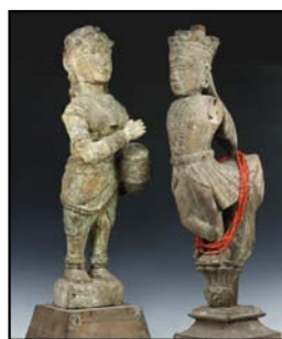
Two 18th c. Continental Indian Figural Carvings. 32" tall