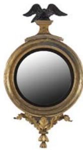
Lot 352 - Circa 1800 American Federal Period Bull's Eye Mirror with spreadwing eagle, 39" x 22" est. $1000 - $1500