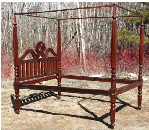
Lot 400 - Plantation Four Poster Canopy Bed in Mahogany, 84" tall, 88 1/2" x 67" est. $1000 - $1500