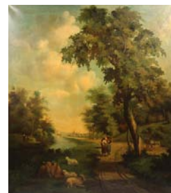
Lot 168 - Architectural Scale 19th c. Pastoral Scene Mural, oil on canvas, unsigned, 71" x 67" 1 of 3 being offered. est. $1000 - $2000