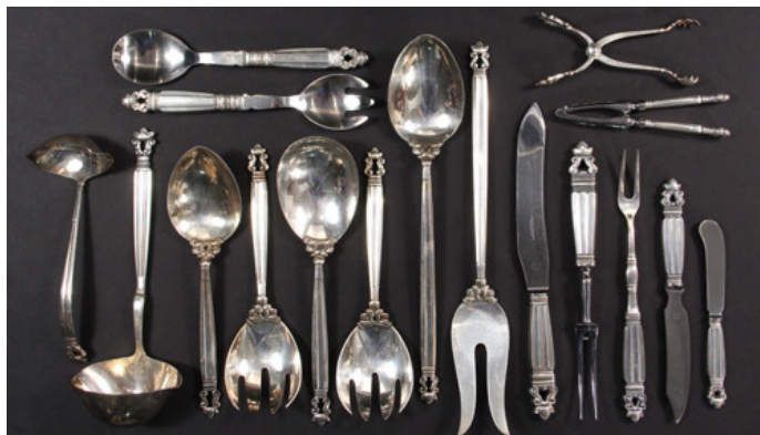
Lot 786 - (177) Pcs of Georg Jensen Acorn Pattern Sterling Silver Flatware in felt lined wooden case. est. $12000 - $14000