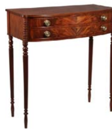
Lot 60 - Circa 1800-1815 Fine Mass. Mahogany Bowfront Server, 39 1/2" tall, 37 1/2" x 17" est. $3000 - $5000