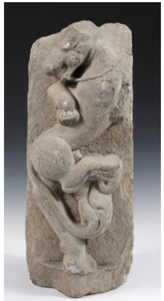
Lot 229 - Circa 300 B.C. carved basalt architectural entablature fragment depicting a lioness, 20" x 8" x 5 1/2" est. $4000 - $6000

liveauctioneers THOMASTON Live invaluable