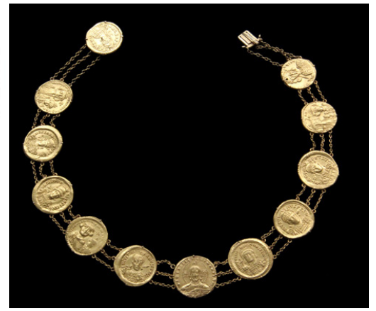
Lot 211 - 1920's Necklace made from A rare group of (12) solid gold period Byzantine Coins. est. $10000 - $15000

P.S.: If you will be visiting from away, Thomaston's Hampton Inn is offering a special 'auction goer' room rate. Please call the hotel (207-594-6644) and request the 'Thomaston Place Auction Galleries Rate'.