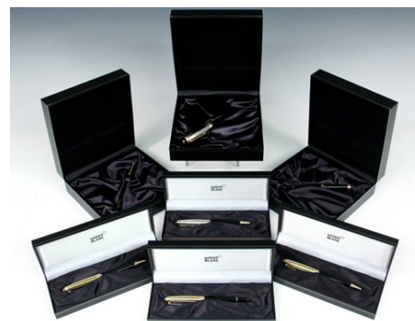
7 of the 12 Mont Blanc Pens/Pencils being offered