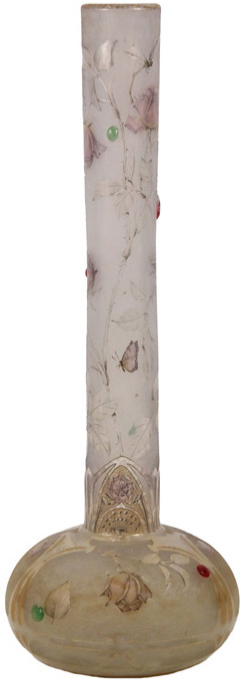
Lot 716 - Monumental Cameo Glass Stalk Vase by Daum Nancy, Lorraine, France, circa 1900, signed, 24 3/4" tall, 8 1/2" diam. est. $5000 - $7000