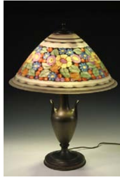
Lot 926 - 1920's Pairpoint Art Deco Floral Painted Frosted Glass Shade, on a bronze finished base, 23" tall, 18" diam. shade. est. $2000 - $3000