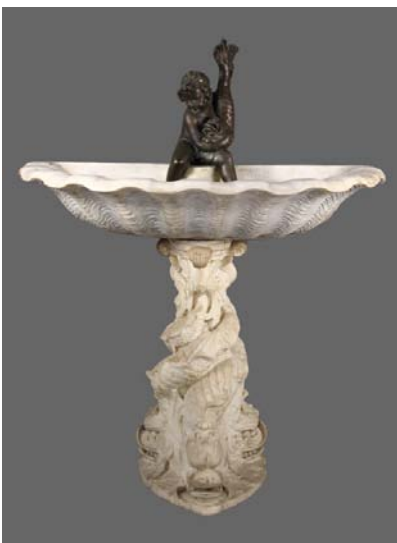
Lot 735 - 19th c. Carrara Marble Renaissance Style Wall Fountain with half-shell form basin, 38" x 19" x 7" basin, 27 1/2" x 16" base. est. $2000 - $3000