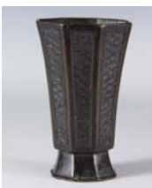
Lot 488 - Rare Chinese Octagonal Footed Form Bronze Cup, Yuan Dynasty, (1279-1368), 4 7/8" x 2 7/8" est. $2000 - $3000