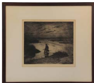
Lot 746 - FRANK WESTON BENSON (MA, 1862-1951) - "Dusk", etching on paper, pencil signed and numbered 8/50, 9 1/4" x 10 3/4" est. $3000 - $4000