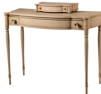
Lot 20 - Painted Sheraton Dressing Table, Portsmouth, NH, circa 1815-1825, 39 1/2" x 17 1/2" est. $1,000 - $2,000