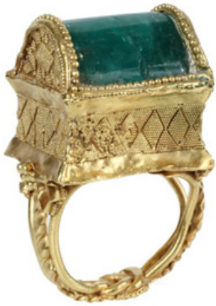
Lot 210 - Rare Greek, circa 1st Century BC, 22K or 24K Yellow Gold and Emerald Ring. est. $20000 - $30000