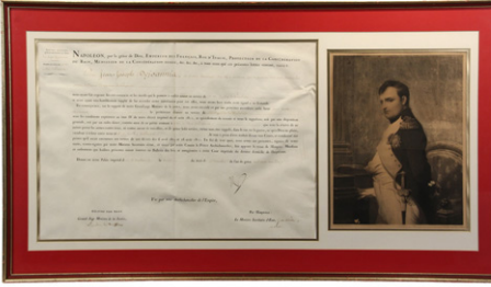
Lot 268 - Military appointment signed by Napoleon Bonaparte (1769-1821), ink on parchment, signed on December 30, 1812. est. $3000 - $5000