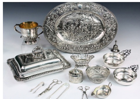
Selection of Early American and Continental Silver