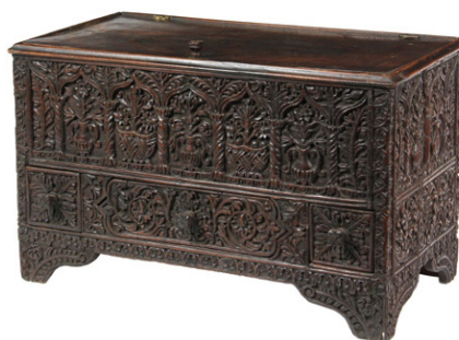
Lot 478 - 18th c. Goanese Small Valuables Hardwood Cabinet made for the Spanish market, 14" x 22 1/2" x 13" est. $600 - $900