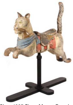
Lot 15 - Circa 1905 Floor Mount Running Cat Carousel Figure in polychromed carved wood. est. $3,000 - $4,000