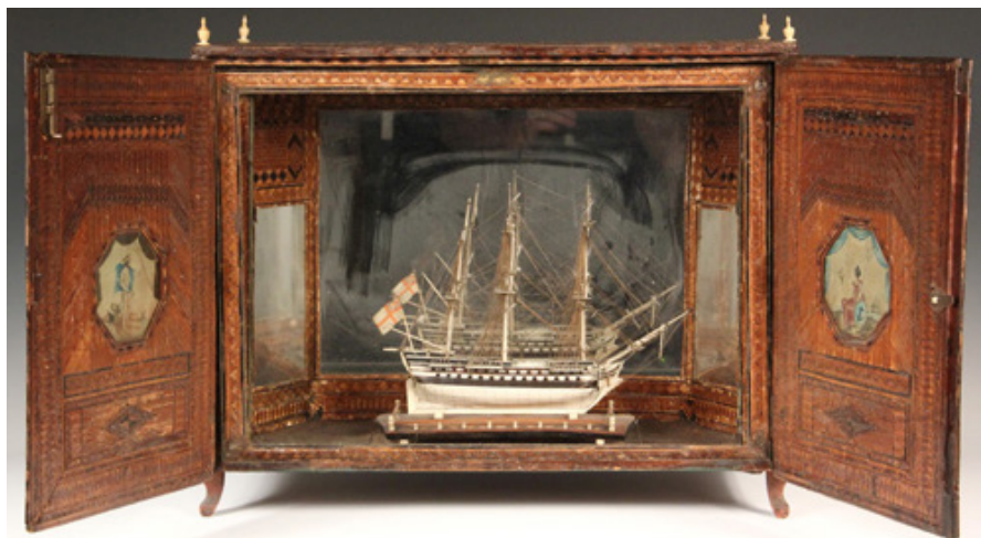
Lot 125 - Circa 1805 Bone and Baleen Miniature Model of a British Man-o-War, 17" x 20" x 9 1/2" est. $8,000 - $12,000