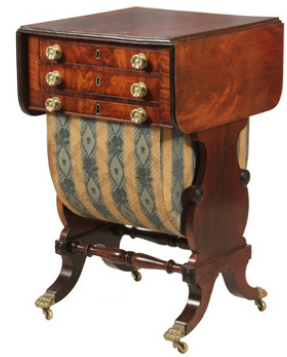
Lot 385 - American Federal Period Three-Drawer Sewing/Writing Stand in figured mahogany, 29" x 18 1/2" square, 8 1/2" leaves. est. $1000 - $1500