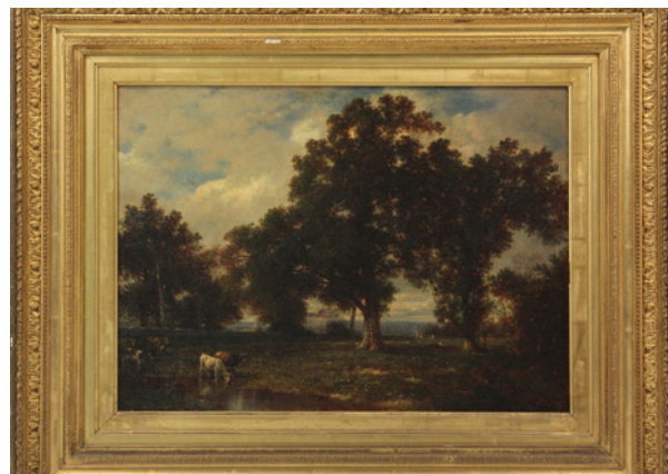
Lot 306 - DAVID JOHNSON (NY, 1827-1908) - "A Brookside", oil on panel, dated 1880, signed and titled verso, 12 1/2" x 17 1/4" est. $4000 - $6000