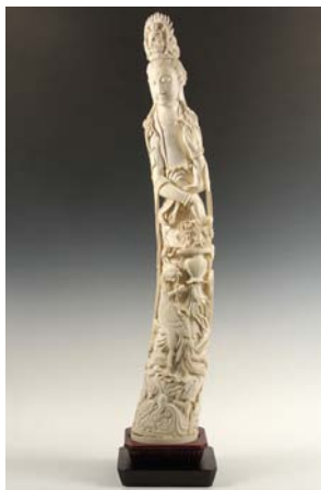
Lot 479 - 19th c Chinese Guan Yin carved from a full length tusk, 41" tall est. $25000 - $35000