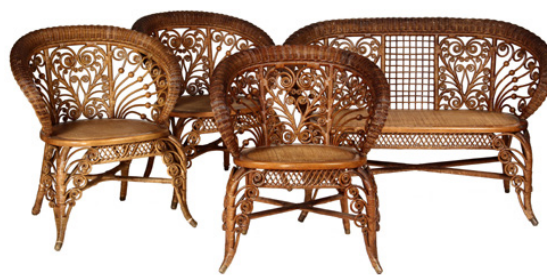
Lot 830 - Circa 1875 (4 PC) Wakefield Brothers Wicker Natural Finish Settee and Three Armchairs. est. $3000 - $4000