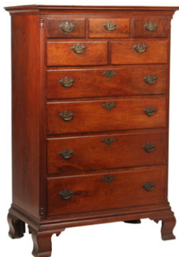
Lot 315 - 18th c. Chippendale Walnut Nine Drawer Tall Chest, 63 1/2" x 42" x 24" est. $2000 - $3000