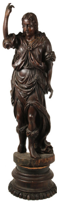
Lot 217 - Late 16th c. Carved Harwood Statue of an Angel, 60" tall. est. $7000 - $10000