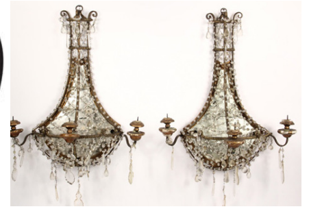
Lot 872 - Rare Empire Period French Crystal Candle Sconces with gold painted iron and wood armatures, 28" x 21" x 11" est. $1000 - $1500