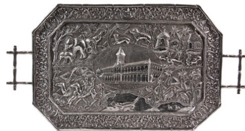
Lot 1065 - Sindh Madrasa Commemorative Silver Tray, Anglo-Indian, in heavy repousse, 10" x 19" est. $2000 - $3000