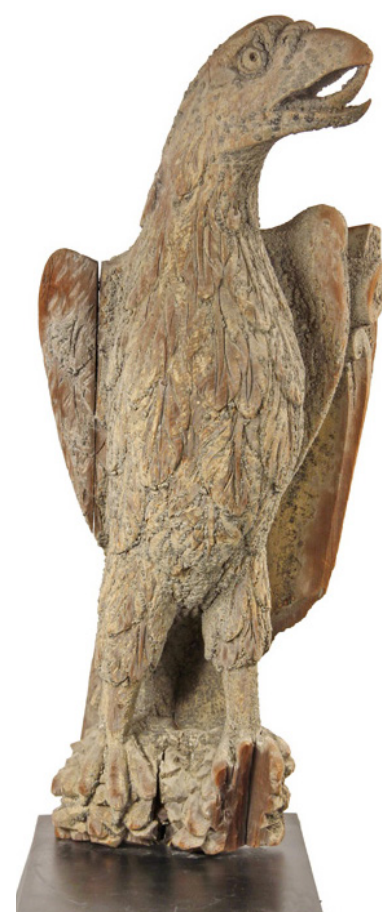
Lot 100 - American Federal Period Eagle Figurehead in carved white pine, circa 1810, 40 3/4" tall. est. $20,000 - $25,000