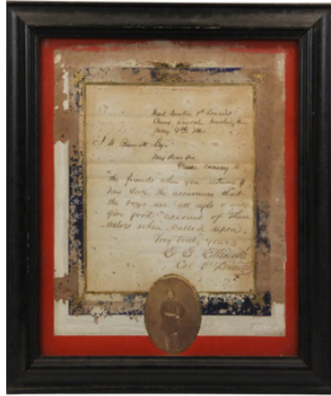
Lot 1201 - May 9th, 1861 Letter from the first Union Officer killed in the Civil War, Col. Elmer Ellsworth. est. $3000 - $5000