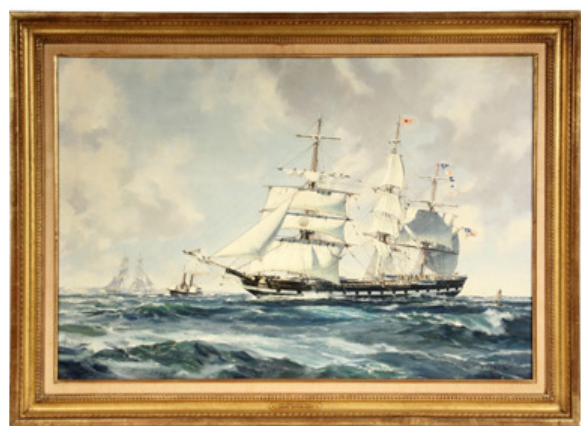
Lot 110 - JOHN STOBART (MA/FL, 1929 - ) - "The Black Ball Line 'Great Western' in the Approaches to New York", oil on canvas, 25 1/2" x 37 1/2" est. $15000 - $25000