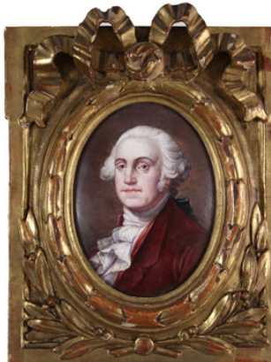
Lot 77 - 19th c. Oval Porcelain Plaque with Hand Painted Portrait of Washington, 4 3/4" x 3 1/2" est. $800 - $1200