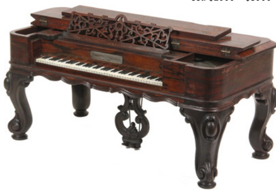
Lot 1019 - Civil War Era Rosewood Piano Salesman's Sample / Music Box from the George M. Guild Piano Co. of Boston, 9 1/2" x 19 1/2" x 10" est. $3000 - $5000