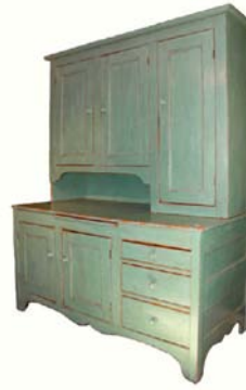
Lot 50 - Kitchen Cabinet in soft green painted pine, 82" tall x 63 1/2" wide x 31" deep. est. $2,000 - $3,000