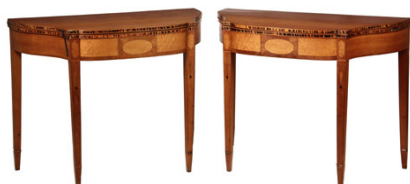
Lot 307 - Hepplewhite Stepped Serpentine Gaming Tables in cherry and bird's-eye maple, circa 1790-1800. est. $2,500 - $3,500