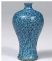
Lot 563 - Miniature Chinese Robin's Egg Blue Glazed Vase, Meiping form, Yongzheng period (1723-1735), 2 7/8" tall. est. $800 - $1200