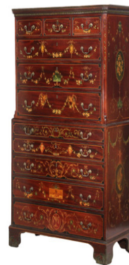
Lot 145 - Period Mahogany Butler's Chest with Delicate Edwardian Paint Decoration, 76 1/4" tall, 46" x 23" est. $3000 - $5000

Thomaston Place Auction Galleries, Inc. U.S. Route 1, P.O. Box 300, Thomaston, Maine 04861 Phone (207) 354-8141 • Fax (207) 354-9523