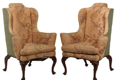
Lot 165 - Circa 1800 Georgian Mahogany Framed Wing Chairs with tall narrow backs, 45 1/2" x 34" x 31" est. $3000 - $4500