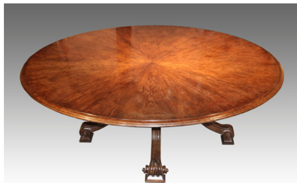
Lot 850 - Volute Walnut Dining Table from the Therien Studio, Los Angeles, CA. 80" diam w/o leaves, 90" diam with leaves. est. $5000 - $7500