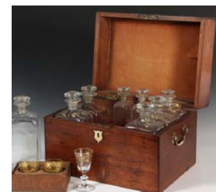
Lot 96 - 18th - 19th c. Ship's Officer's Liquor Chest, in mahogany with conch shell inlay, 10 1/2" x 14 3/4" x 10 3/4" est. $1,200 - $1,800