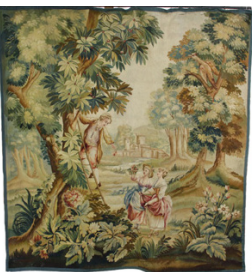
Lot 252 - 19th c. Aubusson Style French Tapestry, 78" square. est. $1000 - $1500