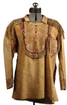
Lot 1100 - Circa 1875 Fine Metis Cree Embroidered Shirt, in buttery deerskin. est. $3,000 - $4,500