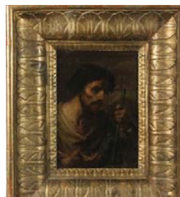
Lot 248 - 16th-17th c. Spanish Old Master Portrait of a Saint, possibly St. Santiago, 10" x 7" est. $2000 - $3000