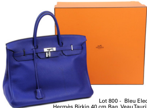
Lot 800 - Bleu Electric Hermès Birkin 40 cm Bag, Veau Taurillon Clemence leather, Palladium plated hardware. est. $10000 - $15000