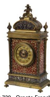
Lot 729 - Ornate French Gilt Enameled Bronze Garniture Clock, brass works stamped "Etienne Maxant Brevete, Paris", 19" x 9 1/2" x 6 1/4" est. $1000 - $1500