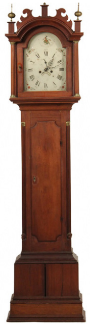
Lot 332 - 18th c. Mahogany Tall Case Clock with brass works, Pennsylvania Chippendale, 91" x 21" x 11" overall. est. $1000 - $1500