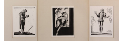
Lot 751 - ROCKWELL KENT (NY, 1882-1971) - Set of (10) Woodcuts Illustrating the Works of Shakespeare, 9" x 6 1/2" impressions. est. $2000 - $3000