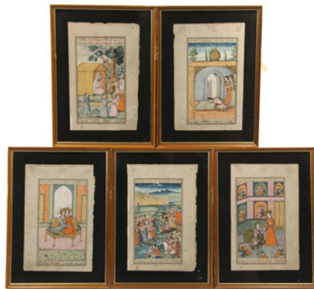
Lot 243 - (5) Illustrated, Gilt and Illuminated Leaves from a Poetry Text, Persia, Safavid, Shiraz, 16th c., each 7" x 11" est. $3000 - $4000