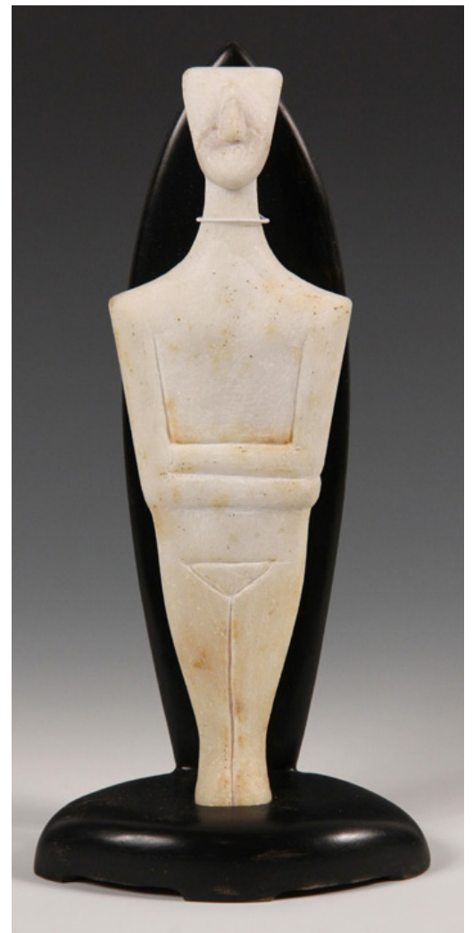
Lot 227 - Circa 2600-2300 BCE Greek Figurine of a Man, from Syros (Cyclades), 9 1/2" tall. est. $10000 - $15000