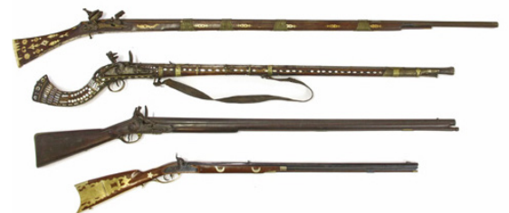
Early Firearms incl. "Brown Bess" Musket, Camel Gun, and Turkish Long Gun

Thomaston Place Auction Galleries, Inc. U.S. Route 1, P.O. Box 300, Thomaston, Maine 04861 Phone (207) 354-8141 • Fax (207) 354-9523