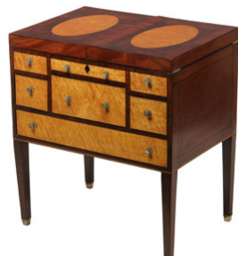
Lot 170 - English Gentleman's Dressing Table in mahogany with bird's-eye drawer faces, 31" x 28" x 20" est. $2000 - $3000