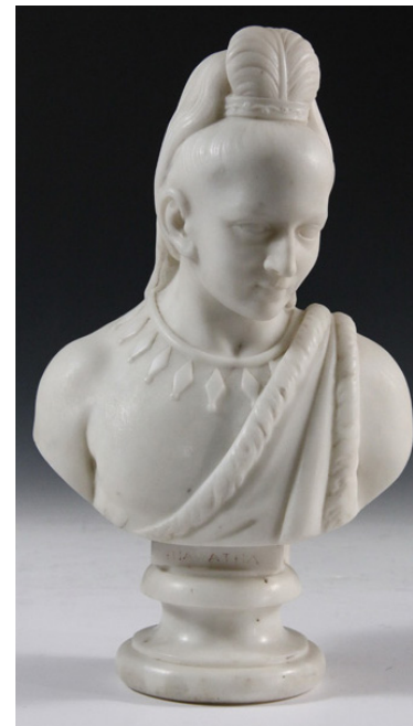
Lot 301 - AFTER EDMONIA LEWIS (MA/CA/Italy, 1845-1907) - "Hiawatha", Bust Portrait, circa 1868, 13 1/4" tall. est. $6,000 - $7,000