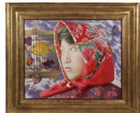
Lot 896 - YANZHOU XU (Cont. Chinese) - "The Grandfather's Birdcage", oil on canvas, signed & dated 1997, 19 1/2" x 23 1/2" est. $3500 - $4500