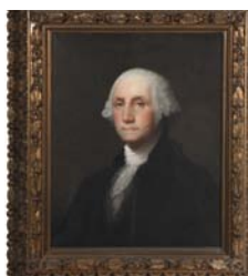
Lot 78 - 19th c. "Portrait of President George Washington", after Gilbert Stuart, oil on canvas, 29" x 23" est. $2000 - $3000