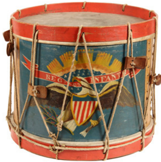
Lot 1200 - Circa 1863 Civil War Field Drum, by A. Rogers, 14 1/2" tall, 16 1/2" diam. est. $5000 - $8000