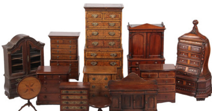
Single Collection of Apprentice Made Furniture Models