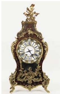
Lot 263 - Large Ornate Louis XVI Style French Boulé Mantel Clock. 29 1/2" x 13" x 7" est. $1000 - $2000