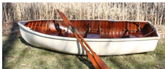
Lot 809 - 9 foot Fiberglass Penn Yan Aero Dinghy, built in 1954. 9' LOA, 36" beam, 61 lbs. est. $2,000 - $3,000