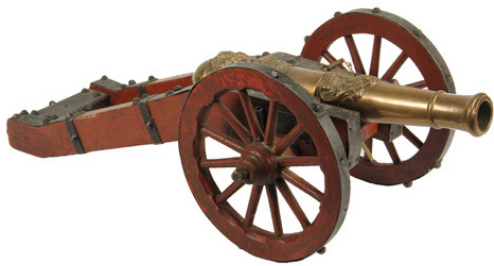
Lot 1212 - Highly Detailed Working Model of a 17th/18th c. European Bronze Artillery Piece, 3/4" bore, 12" barrel, 21" loa. est. $1000 - $1500