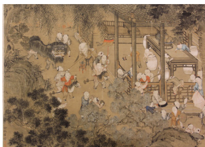
Lot 556 - Early Chinese Painting on Silk, horizontal format, laid to a later scroll, signed, 17 1/4" x 85 1/2" est. $1000 - $2000