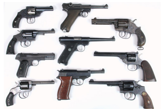
Selection of Handguns by Colt, S&W, H&R, Walther, Ruger and Mauser