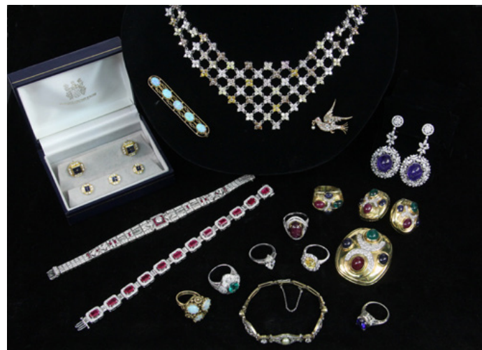
Sample of the exquisite jewelry, featuring this Multi-colored Diamond Necklace, total wgt. 29.25 cts.