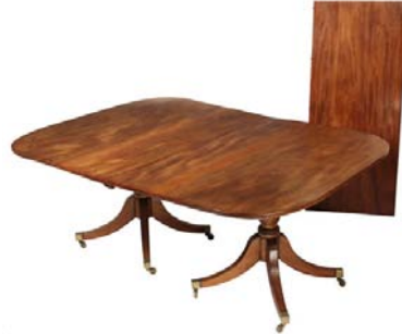
Lot 365 - Period Mahogany Three-Part Dining Table, 29" tall, 33 3/4" x 53 1/2" each section, 23" leaf. est. $1800 - $2400