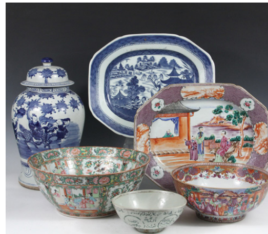
Six Lots of Fine Chinese Export Porcelain

Thomaston Place Auction Galleries, Inc. U.S. Route 1, P.O. Box 300, Thomaston, Maine 04861 Phone (207) 354-8141 • Fax (207) 354-9523