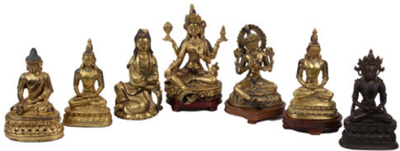
Collection of Chinese Gilded Bronze Buddha and Deity Sculptures