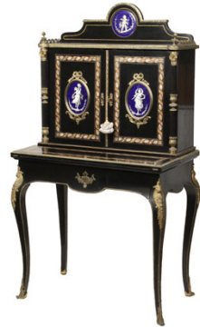
Lot 795 - Louis XV Style Lady's Escriptoire in black lacquer with ormolu mounts and inset porcelain portrait panels, 56 1/2" x 31 1/4" x 18" est. $3000 - $4000