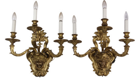
Lot 734 - PAIR OF BELLE EPOCH SCONCES - Large Three Arm Gilt Bronze Wall Sconces, circa 1880, electrified, featuring an allegorical head for the Americas, ornately cast and chased, reticulated backplate, scrolled arms and large round bobeches supporting faux candles, 18" x 18" x 13". Good condition. est. $2000 - $3000