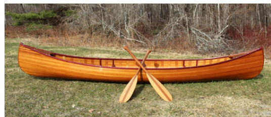
Lot 812 - Mid 20th c. Cedar Strip 12' Canoe with mahogany trim, original matching paddles and cover. est. $1,500 - $2,000