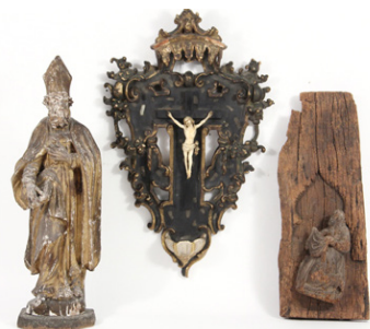
Ecclesiastical Items, including a 17th c. Spanish Baroque Crucifix