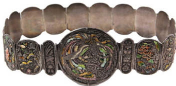
Lot 1133 - Meiji Period, Enameled Silver Belt, fits 26" waist. 10.220 oz est. $2000 - $3000