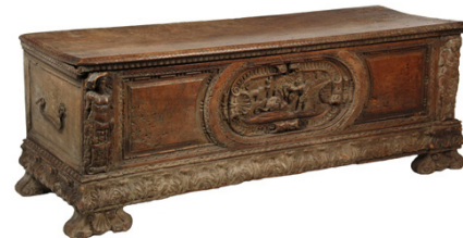
Lot 265 - 17th c. Ornatly Carved Italian Walnut Cassone, 24" x 56" x 22" est. $2000 - $3000