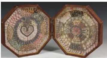
Lot 97 - 19th c. Folk Art Sailor's Valentine in the original octagonal hinged case, 9" x 2 1/2" est. $1,000 - $1,500