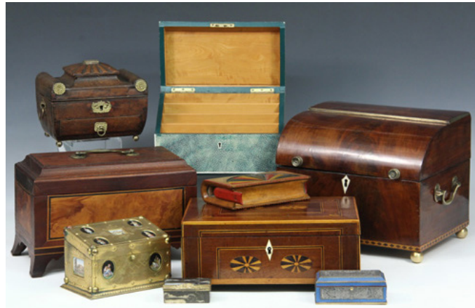
Great Selection of Boxes, incl. Italian Bronze Box w/ Micromosaic Panels