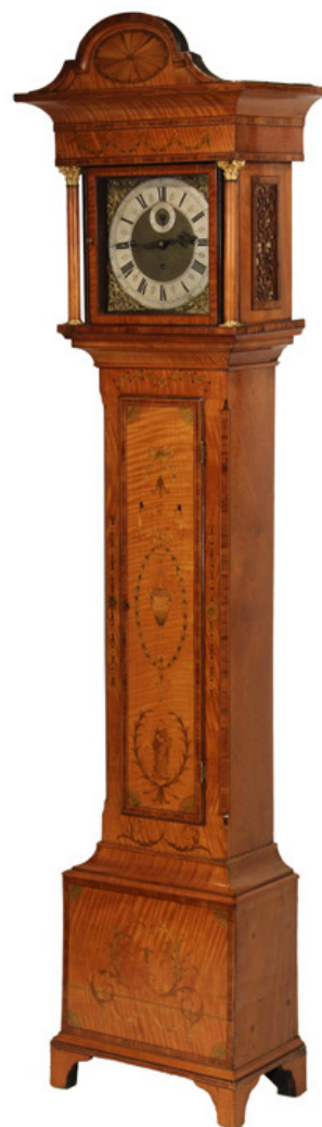
Lot 155 - Circa 1700 William III Satinwood Inlaid Musical Chime Grandfather Clock, 87 1/4" x 21 1/2" x 13" est. $6000 - $8000