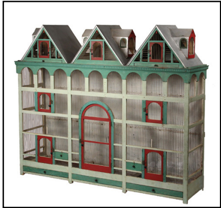
Lot 710 - Indoor Architectural Bird House in original pastel polychrome paint, 60" x 74" x 18" est. $1,500 - $2,000