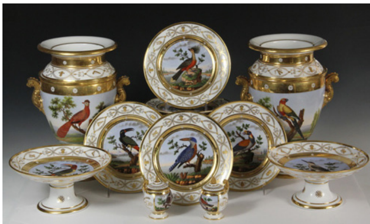
Lot 61 - Circa 1800 (22 pcs) French Porcelain Dessert Set by Jean Nepomucene Hermann Nast. est. $8000 - $12000