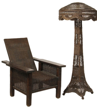
Lot 785 - Circa 1900 Bar Harbor Pattern Morris Chair and Floor Lamp, in chocolate brown finish. est. $800 - $1200