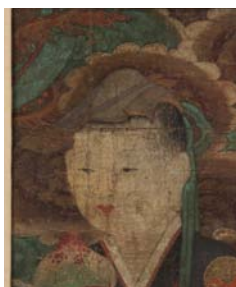
Lot 558 - 16th to 17th c Ming Dynasty Portrait Fragment in gouache on silk gauze laid on paper, 8" x 6" est. $700 - $900