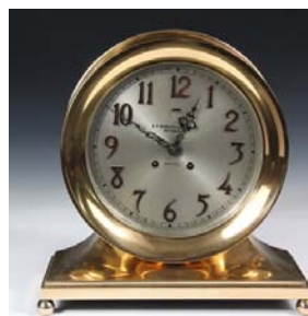
Lot 112 - Commodore Ship's Bell Clock with fancy dial, s/n 59176, 10" dia. bezel. est. $1,000 - $1,500