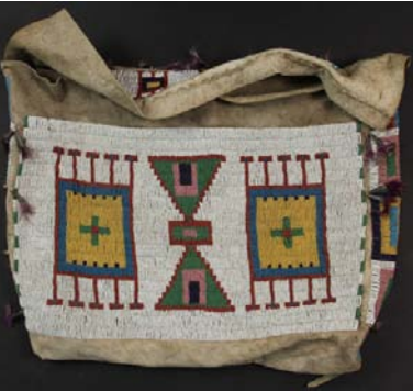
Lot 1102 - Lakota Beaded Buffalo Hide Possible Bag, 19th c., 13" x 19". est. $2500 - $3500