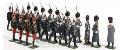
Lot 1336 - (23 pcs) Britains Lead Toy soldiers. 1 of 12 lots with over 200 pieces in all. est. $400 - $600