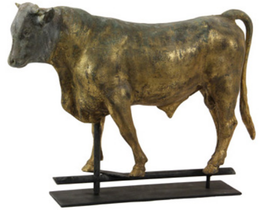
Lot 23 - 19th c. Full Body Gilt Copper and Zinc Weathervane in the form of a Bull, 18" x 26" x 5 1/2" est. $6,000 - $8,000