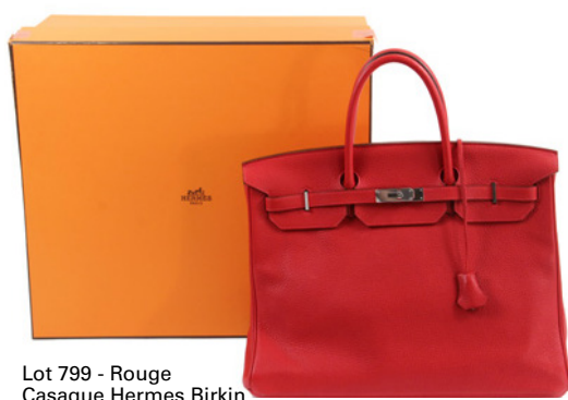
Lot 799 - Rouge Casaque Hermès Birkin 40 cm Bag, Taurillon Clemence leather, Palladium plated hardware. est. $10000 - $15000