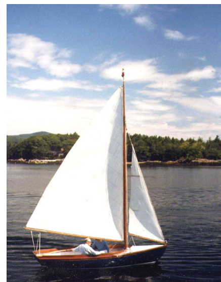
Lot 806 - Wood Hull Herreshoff 12 1/2, "FLEUR DE LIS", hull # 2048, built in 1946 by the Quincy Adams Boatyard. est. $6,000 - $8,000