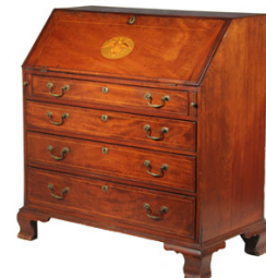
Lot 337 - 18th c. New England Chippendale Slant lid desk, 43 1/2" x 40" x 21" est. $2,000 - $3,000