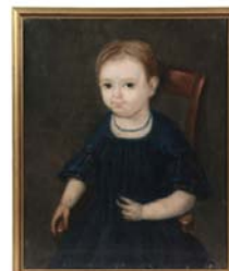
Lot 17 - LEGENVRE (19th c. French) - Portrait of a Young Blonde Girl, oil on canvas, 21" x 17" est. $1,500 - $2,000