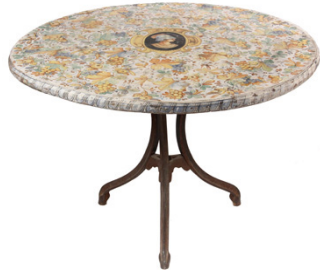
Lot 835 - 20th c. Majolica Topped Iron Garden Table decorated, 30" tall, 45" diam. est. $2000 - $3000