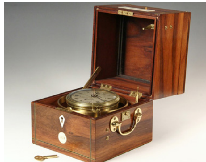
Lot 101 - Circa 1810 J.A. Hatton 8 Day Ship's Chronometer #311, London, 9 7/8" x 8 5/8" est. $7,000 - $9,000

Thomaston Place Auction Galleries, Inc. U.S. Route 1, P.O. Box 300, Thomaston, Maine 04861 Phone (207) 354-8141 • Fax (207) 354-9523