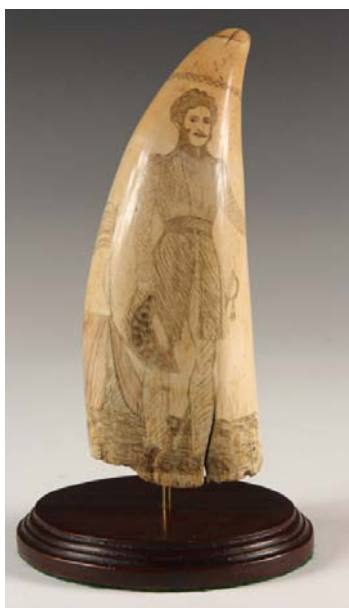
Lot 102 - Circa 1820-30 Scrimshaw Whale's Tooth, Portrait of an American Marine Officer, 7 1/2" tall. est. $5,000 - $7,000