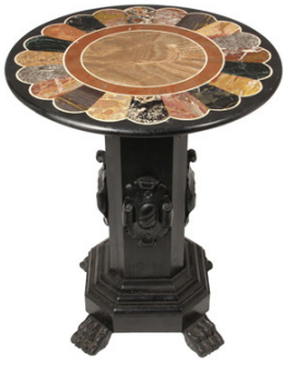
Lot 740 - 19th c. Italian Round Parlor Table with a slate top having inlaid semiprecious hardstone decoration, 29 3/4" tall, 23 1/2" diam. est. $2000 - $3000