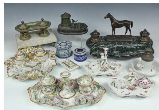
18th - 19th c. Inkwells, mostly from the Collection of Hans Morgenthau

Thomaston Place Auction Galleries, Inc. U.S. Route 1, P.O. Box 300, Thomaston, Maine 04861 Phone (207) 354-8141 • Fax (207) 354-9523