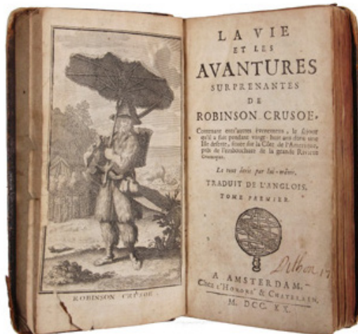
Lot 267 - Rare 1720 Robinson Crusoe First edition in French, after the original printing in English in 1719. est. $3000 - $5000