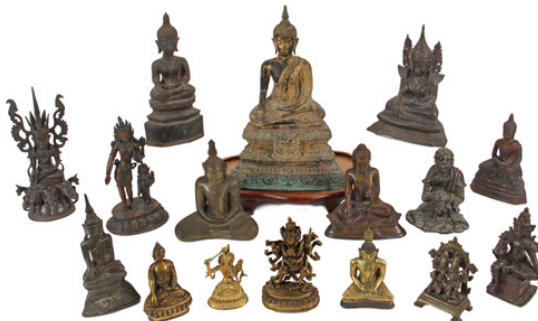
Sample of the Collection of Asian Bronze Statues, from Ceylon, Burma, Thailand and Nepal