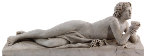
Lot 302 - NEO-CLASSICAL MARBLE SCULPTURE - Neo-classical marble sculpture of Dionysus, 8 1/2" x 21 1/2" x 5 3/4" est. $1000 - $1500