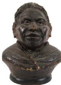
Lot 303 - 19th c. New Zealand Bust of a Maori Chieftain in solid kauri gum or copal, 10 3/4" tall. est. $2000 - $3000