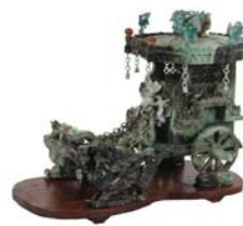
Lot 481 - Imperial Chinese Jadeite Chariot with Quanyin Driver, drawn by Four Dragons, 16" tall, 19" x 12" est. $3000 - $4000