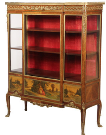
Lot 775 - 19th c. Louis XIV Style French Vitrine, in rosewood with ormolu mounts, 57" x 47" x 16 1/2" est. $2000 - $3000