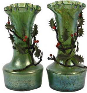
Lot 717 - PAIR OF ART NOUVEAU LOETZ GLASS VASES - with applied cold painted polychromed bronze in the form of holly branches, Vienna, circa 1900, the glass in iridescent green-gold having a round squat base, long tapering neck and flattened ruffled rim, 8" tall. Fine condition. est. $800 - $1200