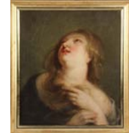
Lot 281 - 18th c. Italian School oil on canvas, from "The Penitent Magdalene", after Guido Reni (1574/5 - 1642), 18" x 16" est. $1500 - $2500