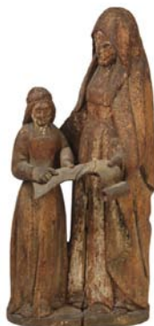
Lot 218 - 14th-15th c. Spanish Religious Statue, Education of the Virgin 42" x 19" x 15" est. $2000 - $3000