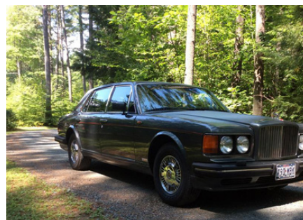
Lot 803 - 1992 Bentley Turbo RL, 4-dr Saloon Vin # SCBZP03D4NCX44209, 107,000 miles. est. $10,000 - $12,000