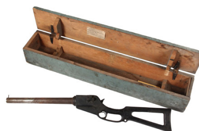
Lot 103 - Cunningham & Cogan Breech Loading Whaling Bomb Gun, patented 1876, 36" long gun. est. $3,000 - $4,000