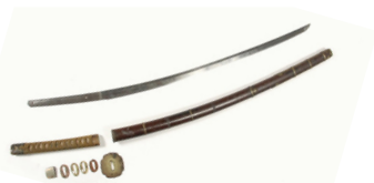
Lot 955 - Japanese Sword, Late Muromachi - Sengoku Period Koto Uchigatana Blade, signed by Kiyomitsu, Osafune, Bizen, dated 1533 est. $4000 - $6000