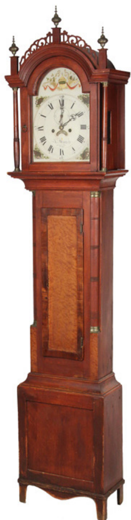
Lot 55 - Frederick Wingate Tall Clock, Country Chippendale Case in red stained maple, with a tiger maple door. est. $4,000 - $6,000