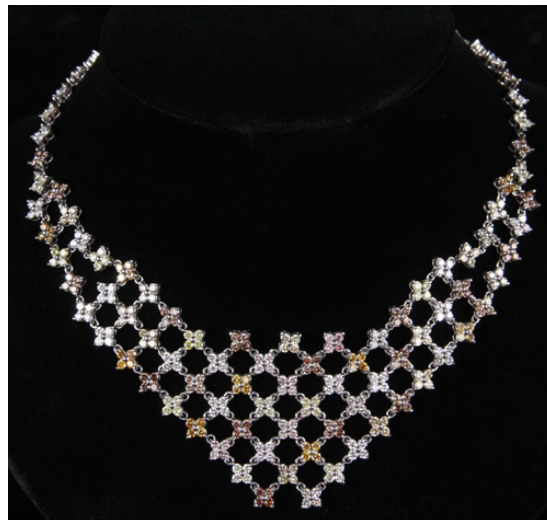
Lot 796 - 18K White Gold and Multicolor Diamond Necklace, total wgt: 29.25 cts, 17 1/2" long. est. $25000 - $35000