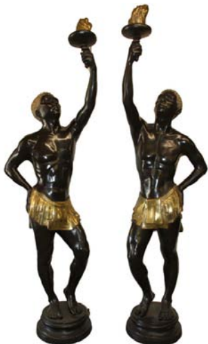
Lot 760 - A Pair of Nubians or Blackamoor Bronze entry Sculptures, 80" tall. est. $3000 - $4500