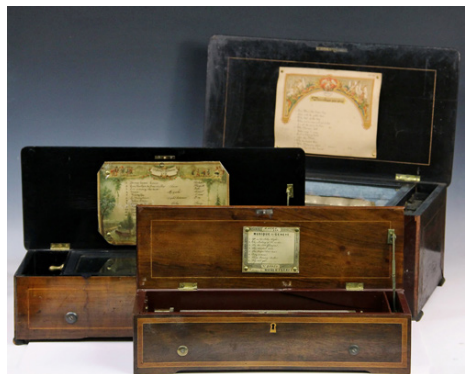
Sample of the 12 Swiss, German and French Music Boxes being offered