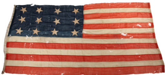
Lot 1206 - Twelve Star Civil War Union Field Flag, hand stitched linen, 42" x 84" est. $1,000 - $1,500