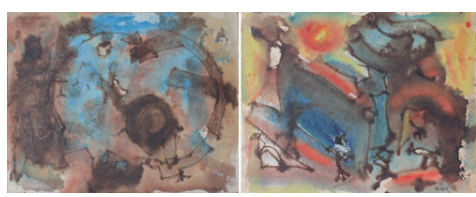
1190) 2 Merton Simpson Abstract Watercolors