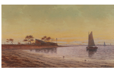
1225) Large George Essig Watercolor