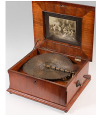
1008) Inlaid 15 3/4” Polyphon Music Box and Discs