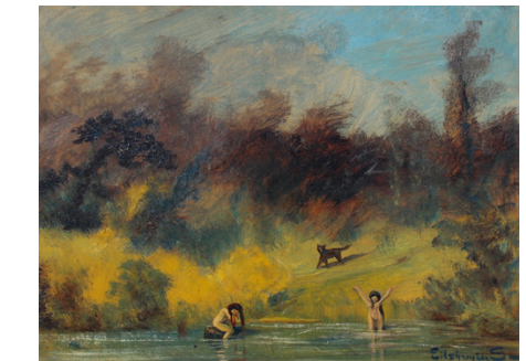
1195) Louis Elshemius Oil/Board Nude Bathers