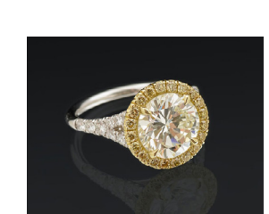
1035) 3.03 Ct Diamond w/ Fancy Yellow Diamond Halo in 18K