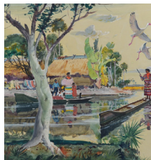
1216) Warren Baumgartner Watercolor Seminole Indian Village