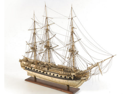
1065) Early 19th C Three-Masted Prisoner of War Bone Ship Model. 19” h x 23”