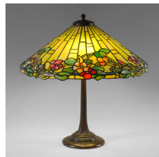
1012) Duffner & Kimberly Mandevilla Leaded Glass Table Lamp, 22 1/4” dia. Shade