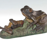
1022) J&E Stevens 2 Frogs Mechanical Bank, 4 1/2” h. x 9” x 3 1/4”