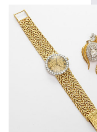
1029) 18K Gold Bueche Girod Wristwatch, quartz movement; 1030) 14K Gold & Diamond Brooch, 4.15 ct total