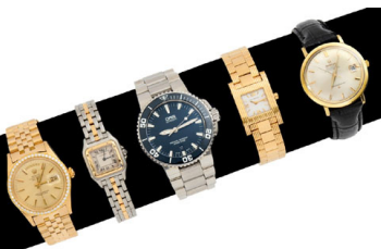
1053) Rolex 18K Diamond Bezel Presidential Watch, Pie Pan Dial; 1077) Lady’s Cartier Panther Wristwatch; 1069) Oris Stainless Steel Automatic