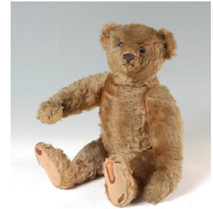
1009) 16” 1904/1905 Steiff Mohair Bear with blank iron button