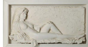
2 Large Bill Mack Bonded Sand Sculptures