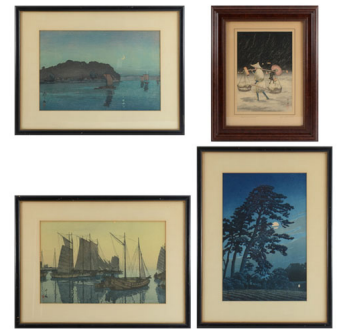
Hiroshi Yoshida, Kawase Hasui, and Koson Ohara