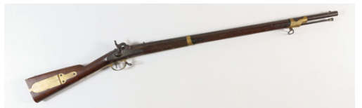
1211) US Percussion Model 1841 “Mississippi” Rifle