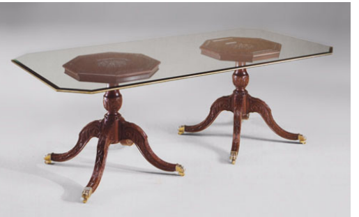
1024) Hickory Manufacturing Heirloom Collection Rocco Dining Table w/ Glass top, Model 1970-52p; 1025) 6 Hickory Dining Chairs (not shown)