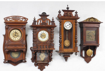
Collection of German wall clocks to include Furtwangler, Gustav Becker, Mauthe and more