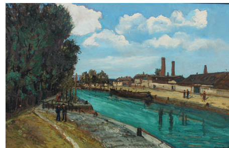
1040) Leon Quizez Oil/Coard Canal Scene