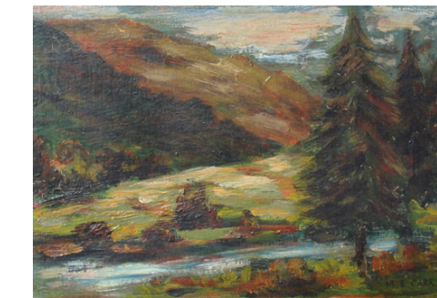
1150) Emily Carr Oil/Canvasboard Wilderness Landscape with Stream