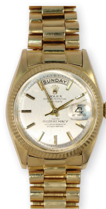
Gentleman's Rolex Day-Date President 18k yellow gold wristwatch, ref: 1803, circa 1959