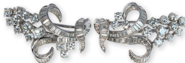
Pair of diamond and platinum double clip brooches, total diamond weight approximately 9.35 cts.