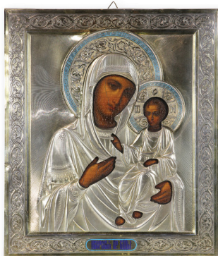
Russian enamel decorated icon depicting Iveron Mother of God, by Ivan Khibnikov, 15"h x 13"w overall