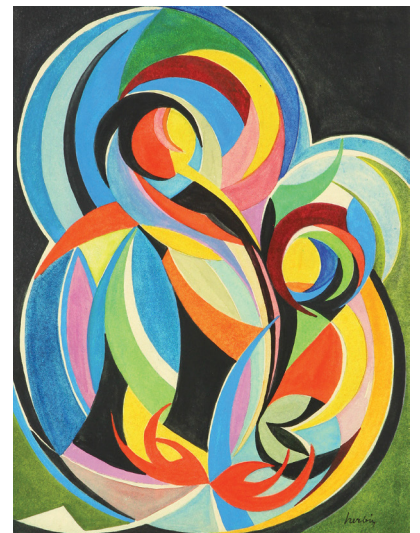
Auguste Herbin (French, 1882-1960), "Mouvement Coloré," gouache on paper, 12.5" x 9.5"