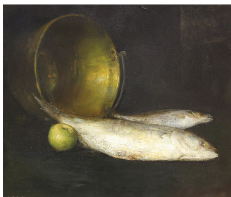
William Merritt Chase (American, 1849-1916), Still Life with Fish, Apple and Bowl, oil on canvas, 17.5" x 23.5"