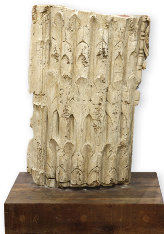
Architectural column fragment, original to the Palace of Fine Arts, San Francisco, and designed by Bernard Maybeck for the 1915 Panama Pacific International Exposition, 44"h x 28"w