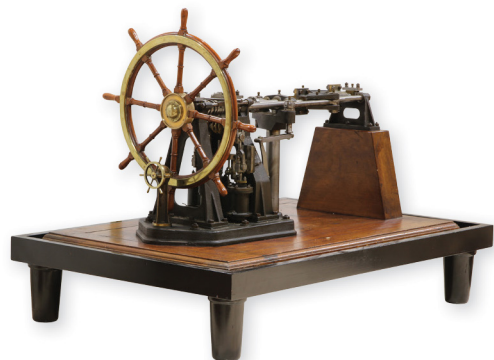
Rare steam assisted ship's wheel steering mechanism model, 19th century, part of a large collection of 19th century steam models from an important Peninsula, CA collection