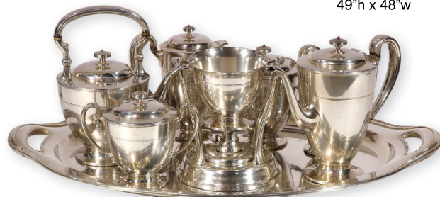
American Tiffany & Company sterling silver hollowware suite, 1907-1938, executed in the Colonial Revival style, 275.73 Troy oz.