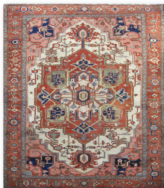
Antique Serapi carpet, circa 1900, 8'6" x 11'7" (one of two to be offered)