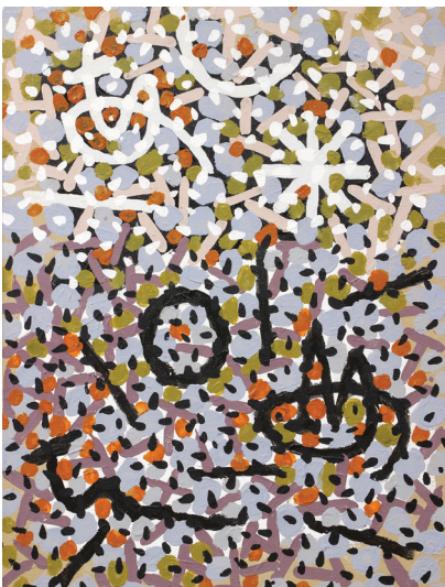
Gordon Onslow Ford (American/British, 1912-2003), "The Other Shore," 1965, Parle's paint-acrylic on canvas, 48" x 36" (1 of 2)