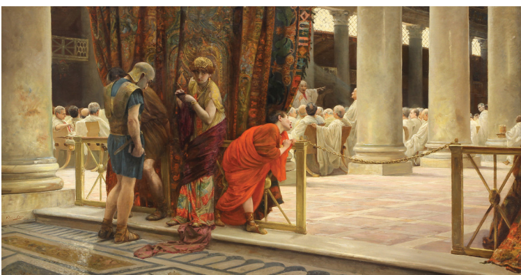
Edwin Long (British, 1829-1891), Claudius Appears Before the Senate, 1869, oil on canvas, 34" x 62.5"