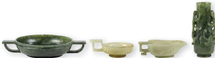
Selection of Chinese jade vessels