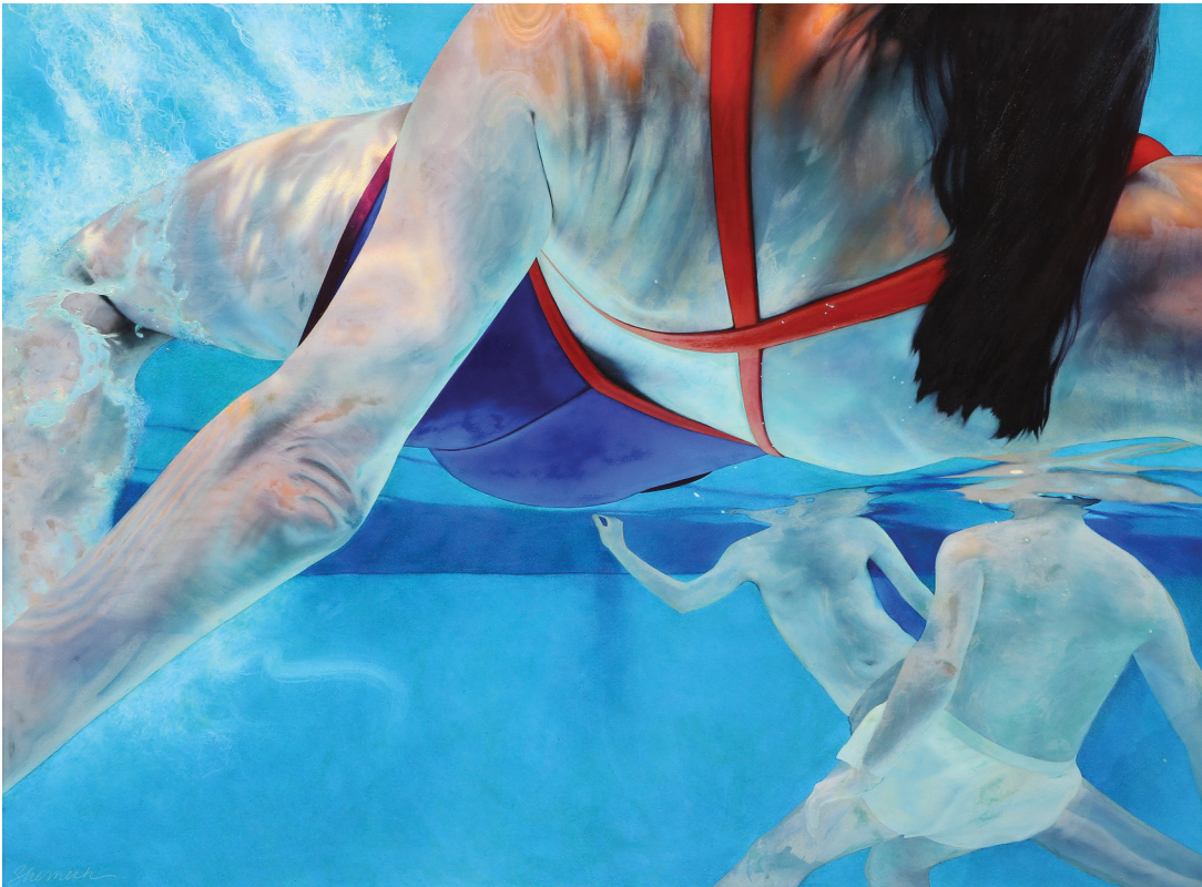
Lorraine Shemesh (American, b. 1949), "Criss-Cross," 1995, oil on canvas, 64.25" x 85.5"

Provenance: The Collection of Allan Stone