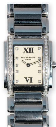
Lady's Patek Philippe Twenty-4 diamond and stainless steel wristwatch