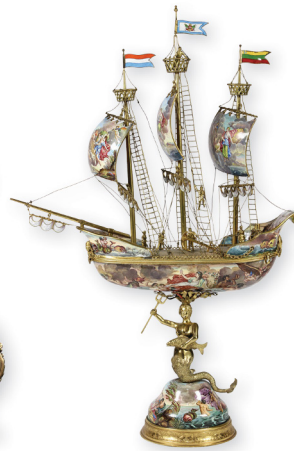
Important Viennese enamel and gilt silver Nef boat, having a mermaid support, 22"h