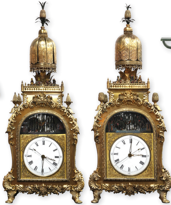
Rare pair of Chinese automaton triple fusee bracket clocks, 32"h