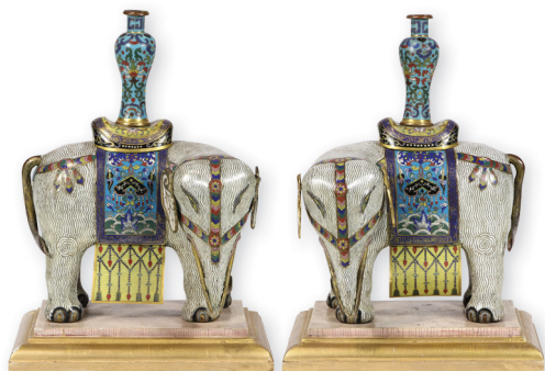
Pair of Chinese cloisonné enameled elephants, 9.5"l