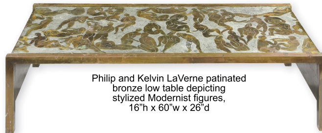
Philip and Kelvin LaVerne patinated bronze low table depicting stylized Modernist figures, 16"h x 60"w x 26"d