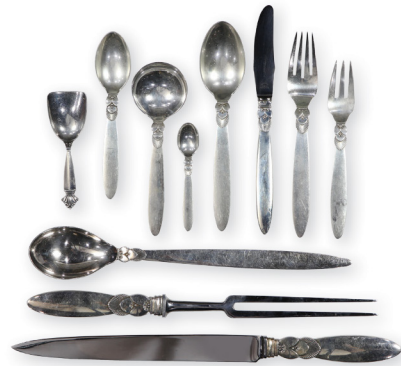
Danish Georg Jensen sterling silver flatware service for twelve in the "Cactus" pattern, having nine pieces per place setting, 118.05 Troy oz.