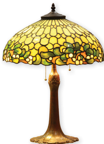
Duffner and Kimberly leaded glass table lamp, early 20th century, 22.5"h x 15.5" dia.