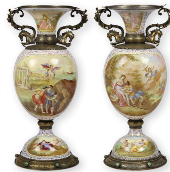
Viennese enamel and silver vases, each having a baluster form and decorated with classical figural scenes, 19th century, 11"h