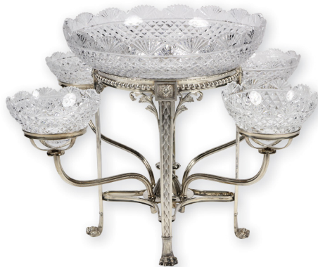
George III silver and cut glass epergne, Birmingham, 1802, by Matthew Boulton, 13"h