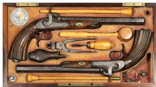
Cased pair of 19th century Belgian percussion target pistols