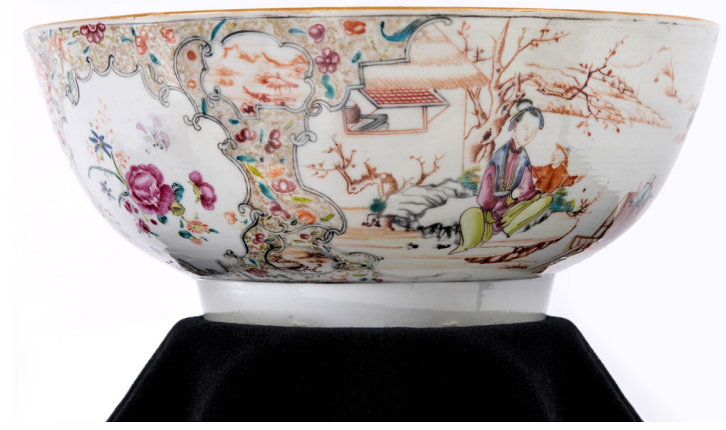
18th C. Mandarin Palette

Washington Map with Footnotes 18th C. Liverpool Type Jug