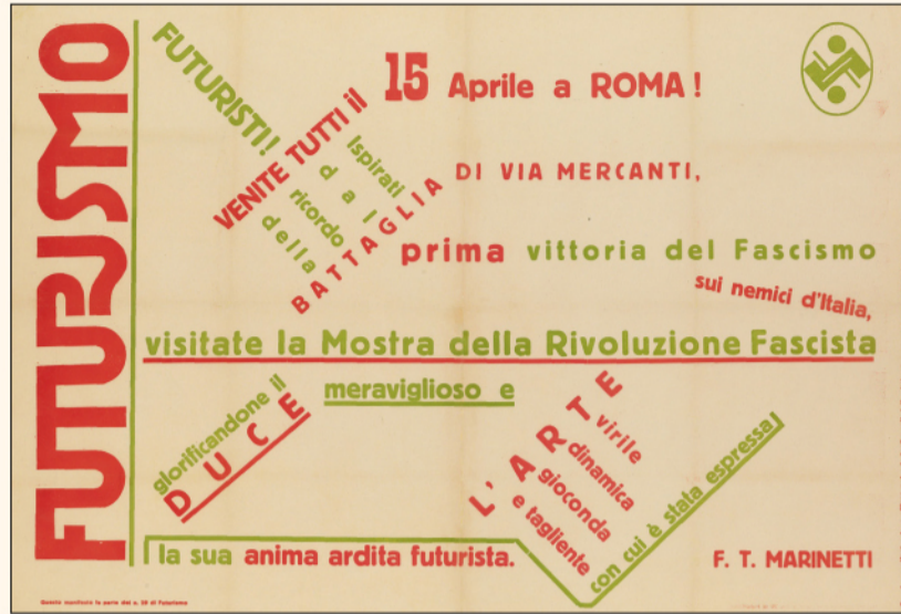
Filippo Tommaso Marinetti, Futurismo , 1932. Estimate $8,000 to $12,000.