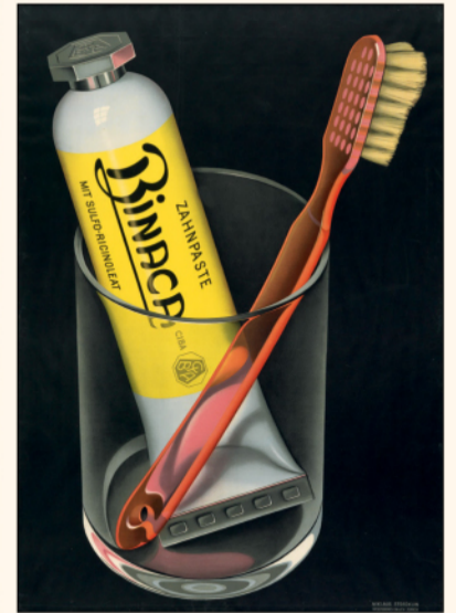
Niklaus Stoecklin, Binaca, Zahnpaste , 1941. Estimate $5,000 to $7,500.