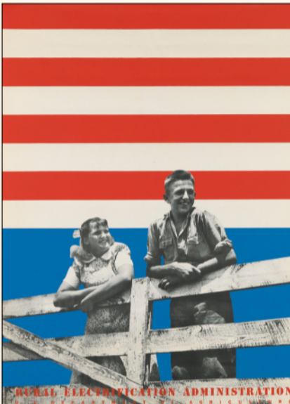
Lester Beall, Rural Electrification Administration , 1939. Estimate $20,000 to $30,000.