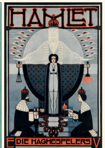
Chris Lebeau, Hamlet , 1914. Estimate $7,000 to $10,000.