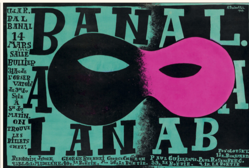
Alexey Brodovitch, Bal Banal , 1924. Estimate $10,000 to $15,000.