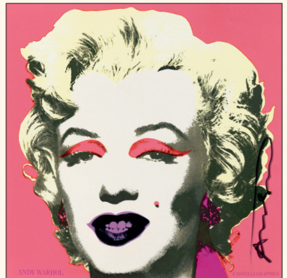
Andy Warhol, Marilyn (Announcement) , color screenprint, 1981. Estimate $6,000 to $9,000.