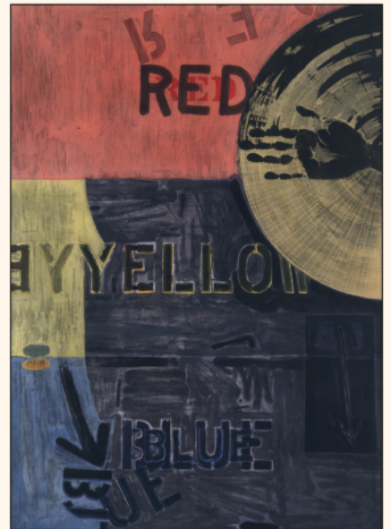
Jasper Johns, Periscope , color etching and aquatint, 1981. Estimate $15,000 to $20,000.