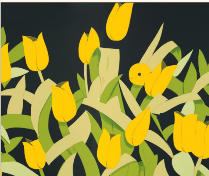
Alex Katz, Yellow Tulips (detail) , color screenprint, 2014. Estimate $20,000 to $30,000.