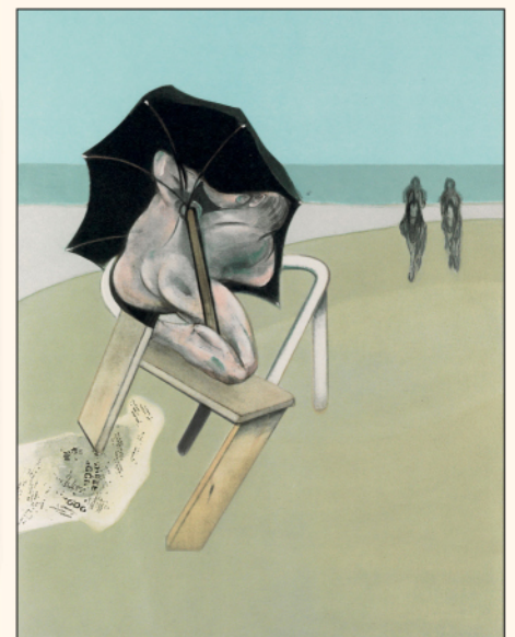
Francis Bacon, Triptych , color aquatint and etching, 1981. Estimate $8,000 to $12,000.