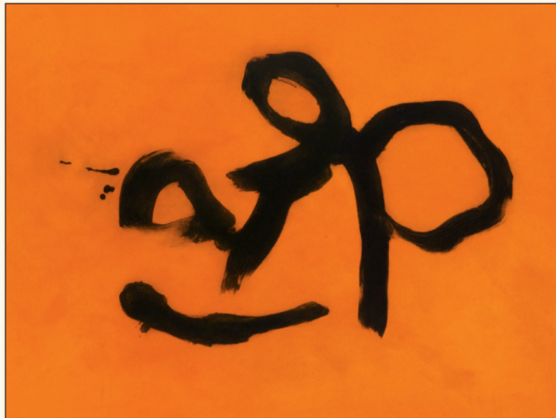
Robert Motherwell, Orange Lyric , aquatint with carborundum, 1989. Estimate $12,000 to $18,000.