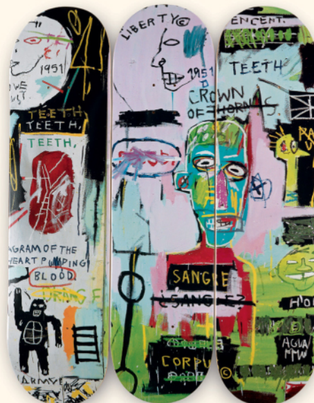
Jean-Michel Basquiat (after), Skateboard Triptych in Italian , color screenprint on three skate decks, 2014. Estimate $2,000 to $3,000.