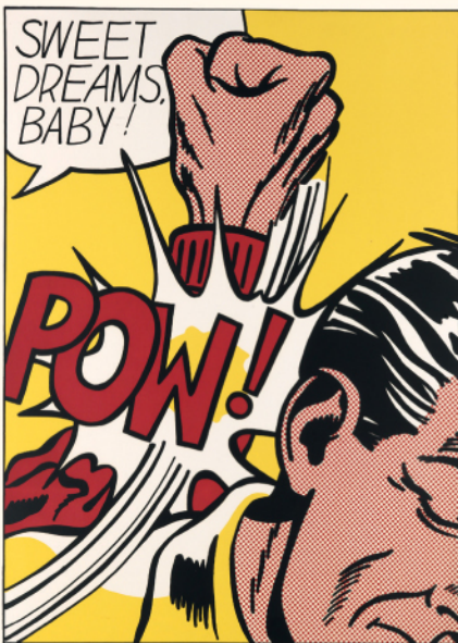
Roy Lichtenstein, Sweet Dreams, Baby! , color screenprint, 1965. Estimate $60,000 to $90,000.