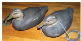
2 Black Ducks by Ken Harris