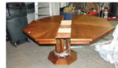
Walter Wabash Dining Set