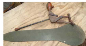
Wooden Dancing Man on Platform