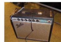
Fender Amp Princeton Reverb