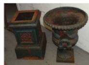
Large Cast Iron Urn