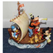
Land in Sight Disney Boat Hummel