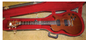
Gibson Electric Guitar LP Fire Brand