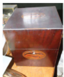
Cellaret and Bottles