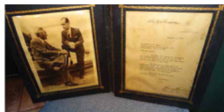
Henry Ford & Edsile Ford Signed Document