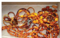
Butterscotch Amber Jewelry