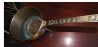
"Warner 3p" Copper Footed Pot