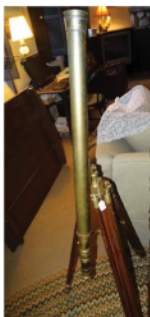
Harbor Master's Telescope