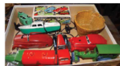
English Wind Up Toy Cars