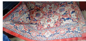
9 x12 Oriental Rug