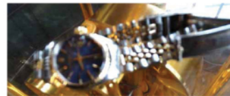
Oyster Perpetual Rolex Lady's Watch